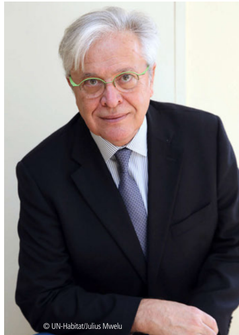
Dr. Joan Clos

UN-Habitat's vision of "urbanization" encompasses all levels of human settlements, including small rural communities, villages, market towns, intermediate cities and large cities and metropolises, i.e. wherever a stable community is continuously located and there are housing units together with permanent social and economic activities, common public space, urban basic services, and a local governance structure.