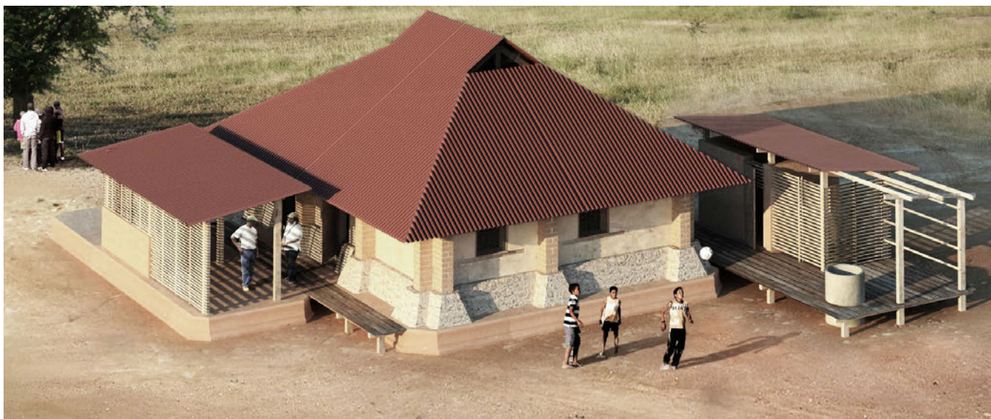
Manica province, Mozambique

UN-Habitat believes that governments and municipalities must have early warning systems for cities, towns and villages. Our experience tells us that the smartest, most sustainable solutions combine short-term emergency efforts with longer-term development.