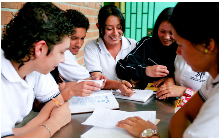
Antioquia, Colombia

There are more young people between the ages of 10 and 24 today than ever before in human history. Presently, 1.8 billion people - more than a quarter of the world's six billion people - are between the ages of 10 and 24, and about nine out of 10 people between the ages 10 and 24 live in less developed countries. (UNFPA/ Population Division of the United Nations Department of Economic and Social Affairs). These youth live, by and large, in cities and towns. It is estimated that as many as 60 per cent of all urban dwellers will be under the age 18 by 2030. UN-Habitat meaningfully engages youth so as to fully realize all the opportunities cities offer and thus create prosperity. UN-Habitat recognizes young people as the active participants in the future of human settlements, the UN parlance for towns and cities. UN-Habitat, through its Urban Youth Fund, and new Youth 21 initiative is actively involved with city youth projects around the world.