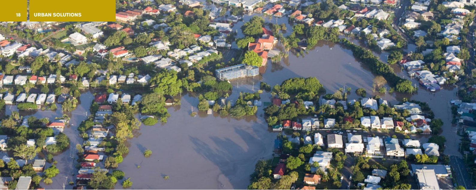
Milton, Canada