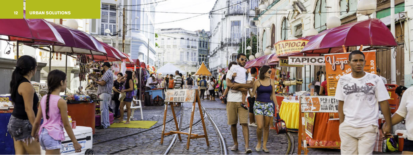
Recife, Brazil