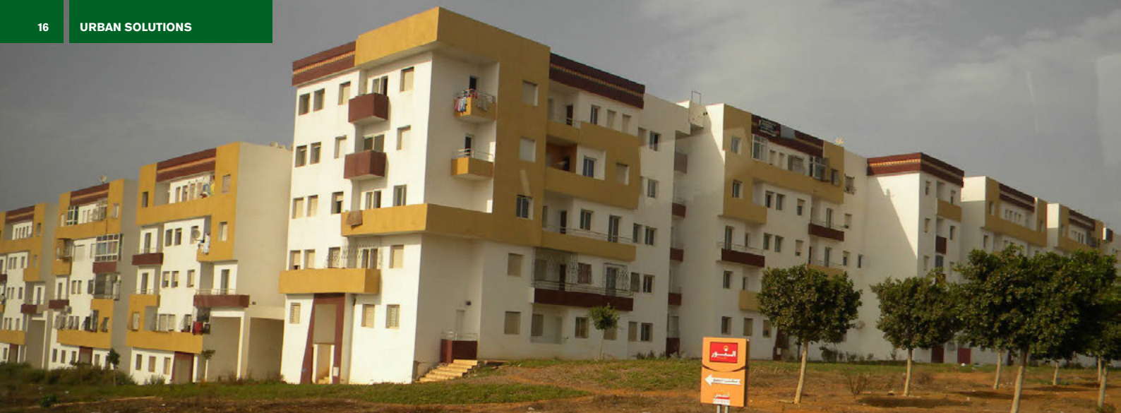
Rabat, Morocco