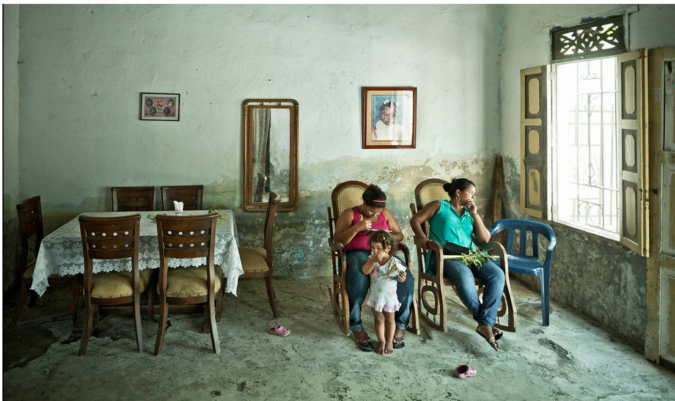
Santa Marta, Colombia

The 'Housing at the Centre' approach reflects the come-back of housing as a priority in the development agenda, addressing the needs of the poorest, repositioning housing at the centre of national urban policies and at the (physical) centre of cities; the latter in reference to the need for housing to be in well-located areas and linked to livelihood opportunities.