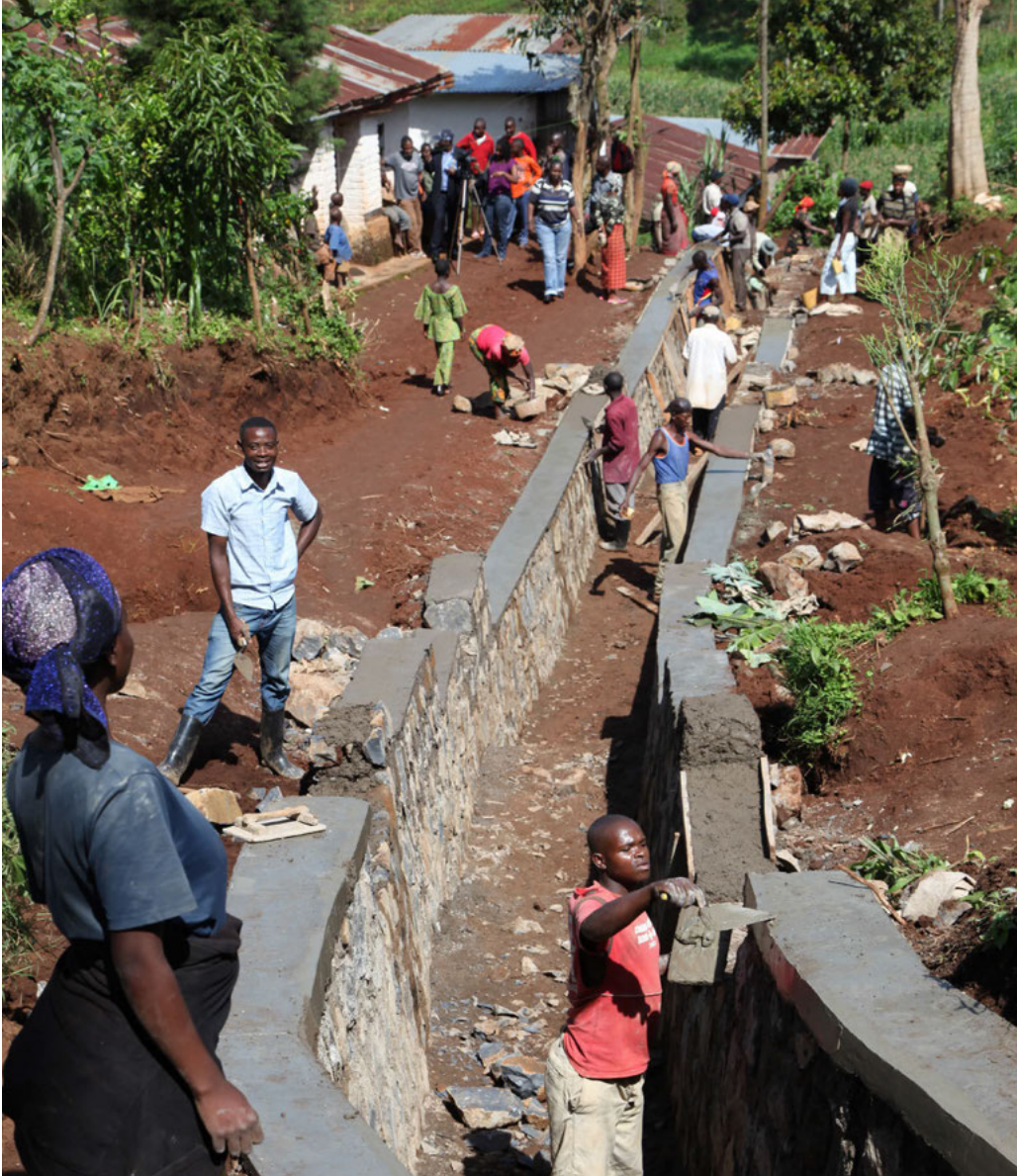
Rusizi, Rwanda