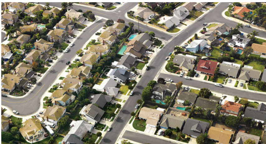
Los Angeles, USA