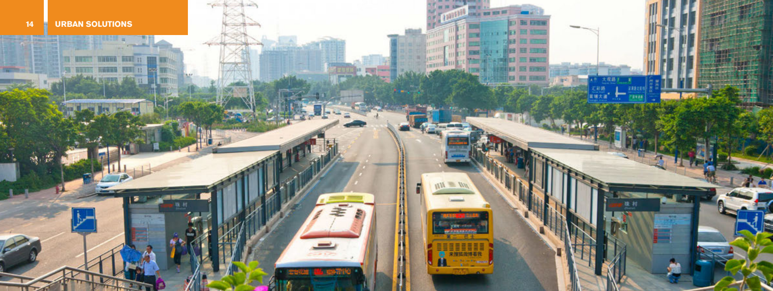
Guangzhou, China