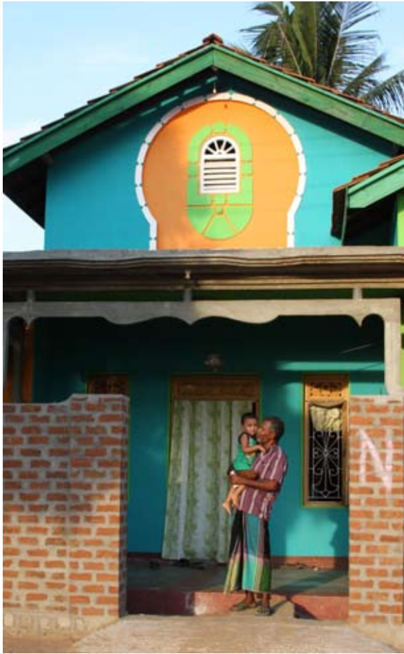
Incremental building is a norm in Sri Lanka, many families built a “500sqft” core house at first, and extended to suit their own aspirations

Under the CRRP, households received a top-up grant for house building to supplement the government’s base grant, a separate grant for water- and sanitation-related expenses, and technical guidance for building. In addition, the project provided a grant for the repair of or improvement to community infrastructure and for facilitating livelihood development.