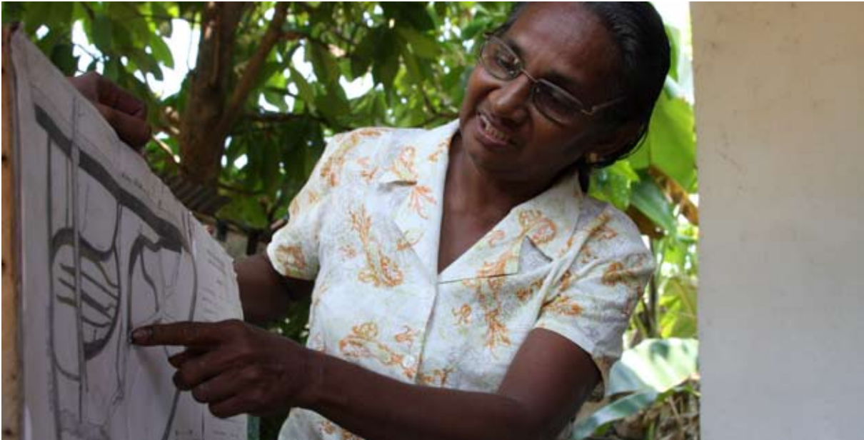
A settlement plan being discussed by the community

In December 2004, UN-HABITAT demonstrated its ability to respond quickly and effectively to a disaster recovery situation. The agency worked with the Sri Lankan government, donors and key stakeholders to assess the tsunami's impact and prioritize areas that were most in need. This was the beginning of UN-HABITAT's involvement in Sri Lanka's post-tsunami reconstruction programme.