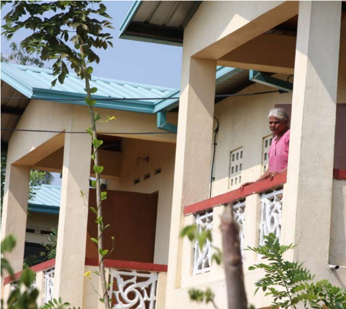
Disaster prepared construction: the 2nd Story provides a refuge against floods in Balapitiya

One of the problems the government had to deal with after the tsunami was the lack of suitable land for resettlement. In the Uddhakandara project the community regularly experienced drought and strong winds, and ‘swelling and shrinking’ of the soil. The project ensured that, from the very beginning, people would be introduced to community-based disaster prevention and mitigation concepts and practices. Each household carefully followed the guidelines for building in high wind- and drought-prone areas published by Sri Lanka Urban Multi-hazard Disaster Mitigation Project. Households were allocated Rs.