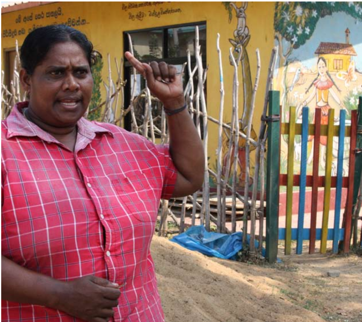
Savings through micro finance schemes such as womens banks' strengthen the voice of women