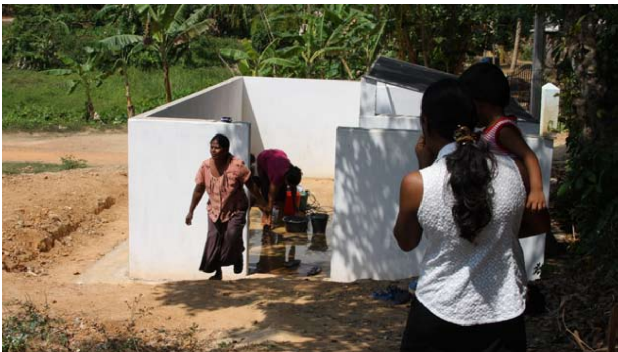
Communal water supply