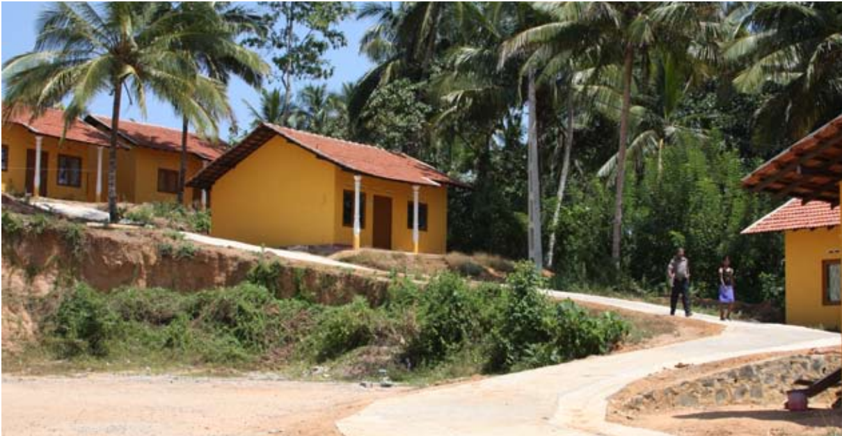
By working with communities UN-HABITAT ensured each settlement met accepted construction standards

UN-HABITAT provided technical assistance to the CDCs as well as to individual households. Following the initial training on basic house design and technical skills as well as project management and transparent administration of funds, CDCs played a vital role in the reconstruction process. CDC members joined the project's technical staff to help individual households design their homes, prepared technical documents and supervised the reconstruction work. As far as possible, both skilled and unskilled labour was sourced from within the community. The acquired skills remain within the community and would be indispensable when maintaining the new assets.