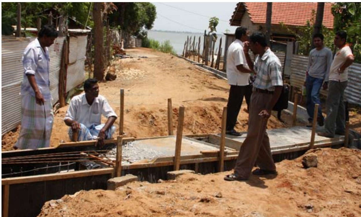
A drainage system being built: Communities pooled in their efforts, and resources to address common needs

In a way, we were intermediaries, we were in the middle. We had to satisfy people, many of whom had lost hope, and we had to talk to the government.