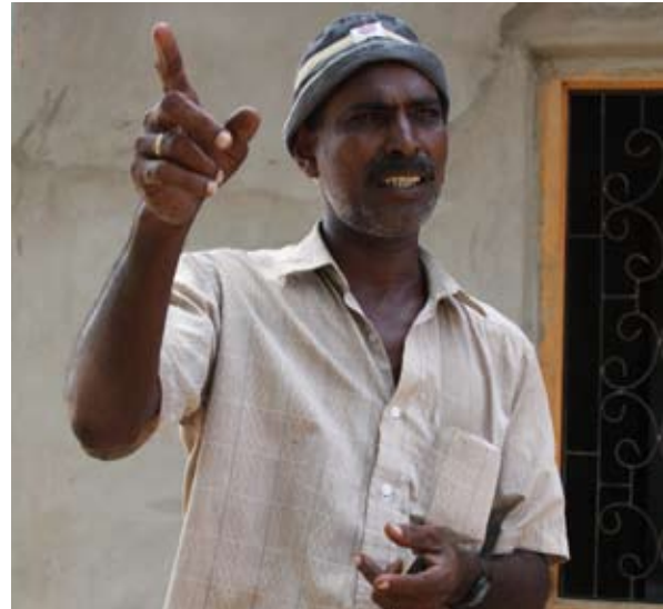
A man in charge, empowered to be the driver of self-recovery

Action Planning (CAP) workshops, organized by the CDCs and facilitated by project implementation teams, to agree on a prioritized set of activities within a clear time frame. Those responsible for carrying out the tasks were also identified and included individuals, groups, local authorities, other state institutions and donor agencies. CAP ensures that a range of views are taken into account and enables the negotiation of outcomes. It is based on principles of good governance that include concepts such as inclusiveness, partnership, accountability, decentralization, capacity-building and empowerment. Indeed, CAP is a creative process that promotes self-respect, self-confidence and self-reliance.