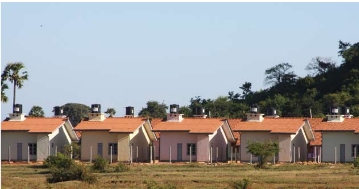
A large donor assisted housing scheme in eastern Sri Lanka

A key lesson learnt by many governments affected by the tsunami was that greater utilization of existing structures and capacity building of ministries such as housing, water and sanitation, urban development, environment and disaster management would be