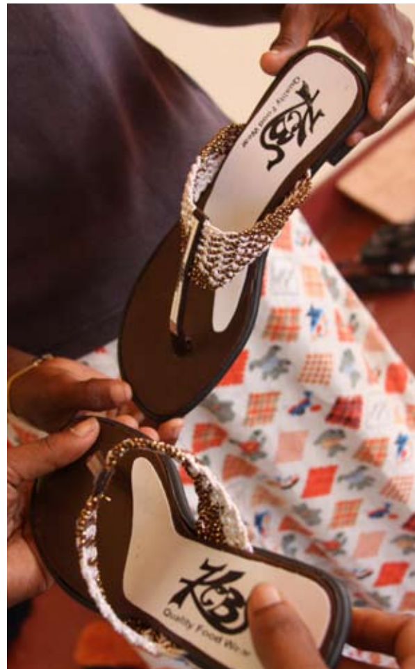
Sandals produced in the shoe factory at the Kadirgamar Tsunami Housing Project