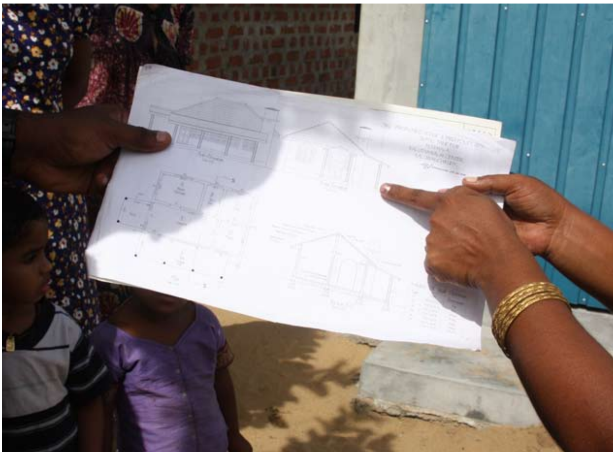
A family discussing the plans for reconstruction : many planned and built houses better and bigger than the grants would allow

CRRP demonstrated the superiority of the homeowner-driven approach in house construction over the donor-driven direct construction approach. It was evident that householders who were more engaged in the rebuilding of their homes were more satisfied with the final result and were also able to recover faster from the trauma caused by the tsunami.