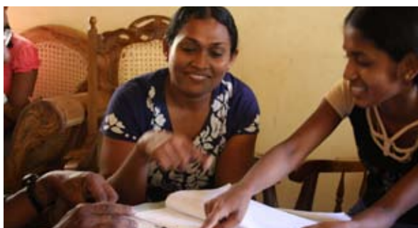
Smiles: ensuring standards results in lasting satisfaction

In Uddhakandara, to facilitate construction work 30 people from the settlement received training in masonry, carpentry, plumbing and electrical wiring. This enabled significant savings on building costs. The project's technical officers worked closely with the householders to finalize house plans as well as guide the entire construction process.