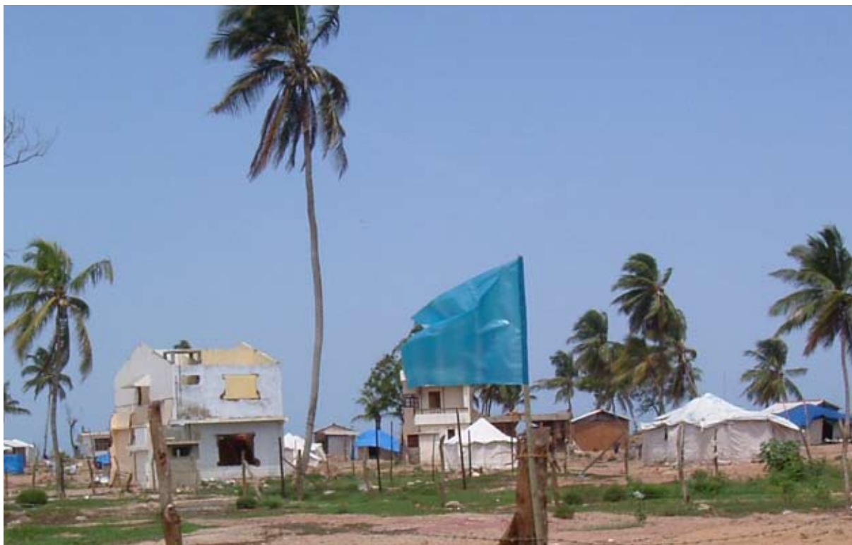
Most devastated houses were in close proximity to the sea, many were affected by the "Buffer Zone" policy

As the title suggests, coordinating hundreds of newly-arrived agencies was an almost insurmountable task. Immediately after the tsunami, UN-HABITAT advocated strongly for an integrated coordination to support the government's effort. While funding for reconstruction projects was plentiful, funding for coordination proved elusive. Although UN-HABITAT provided guidance and support to a