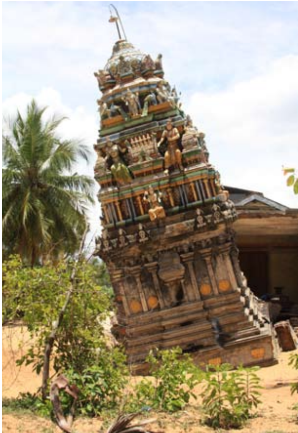
People were forced to rebuild their ways of life: ruins of a Hindu shrine destroyed

avoid winter back home and relax around the magnificent Sri Lankan beaches. When the tsunami struck these tourists were instantly affected and a number were killed. This gave the tsunami an additional international profile and video footage was transmitted around the globe almost instantly.