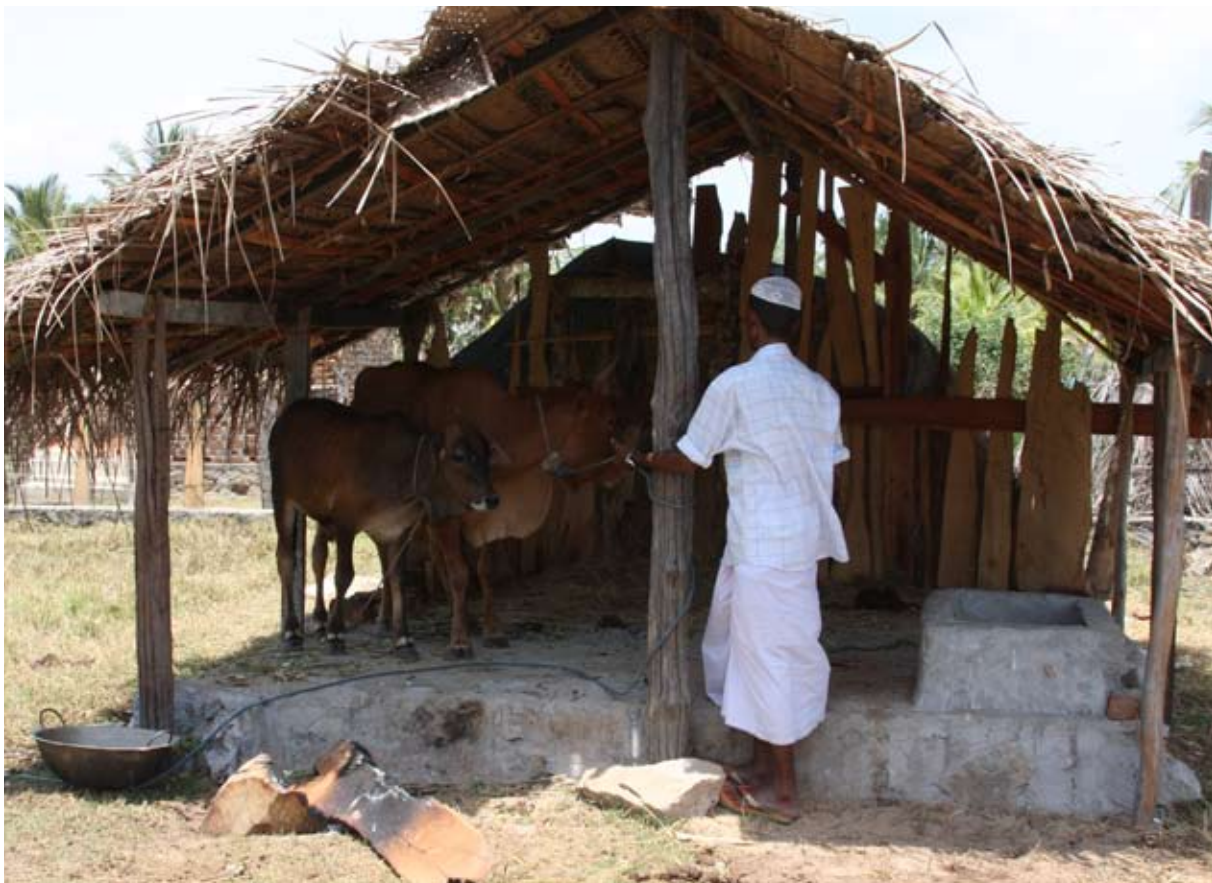
Through partnerships with stakeholders livelihood activities such as cattle farming were promoted

The RCIS project's infrastructure development in the area included drains and culverts in Thirukovil, electricity supply in Vinayagar and a fish stall in Komari.