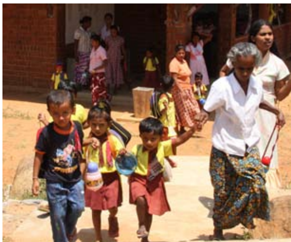
Children head home after a days' learning: the community center rebuilt in Udahakandara features a pre-school

Another problem project staff had to deal with was that both the Urban Development Authority and the Pradeshiya Sabhava, the local government authority, were seriously understaffed. However, as work progressed, people were able to deal directly with government officials and other agencies.