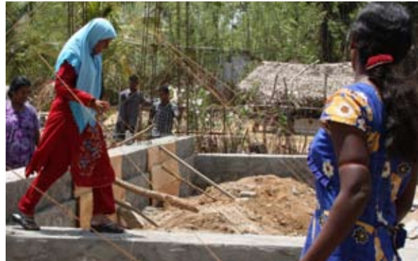
A community in Ampara district works together to build a multipurpose community center