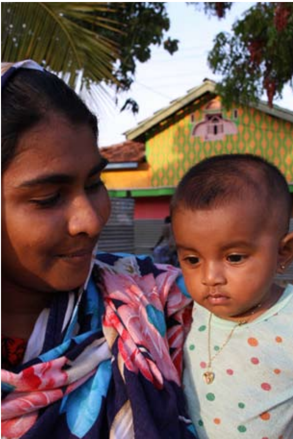
Anticipating a better future; It was not uncommon that women were heads of household, and were in charge of reconstruction

UN-HABITAT recognized the opportunity afforded by the post-disaster situation and its recovery and reconstruction process for social transformation. Particular effort was made to ensure inclusiveness and fair representation of people in terms of ethnicity and gender as well as social and economic status in CDCs and project activities. This could be considered one of the most crucial tasks undertaken by the community mobilizers.