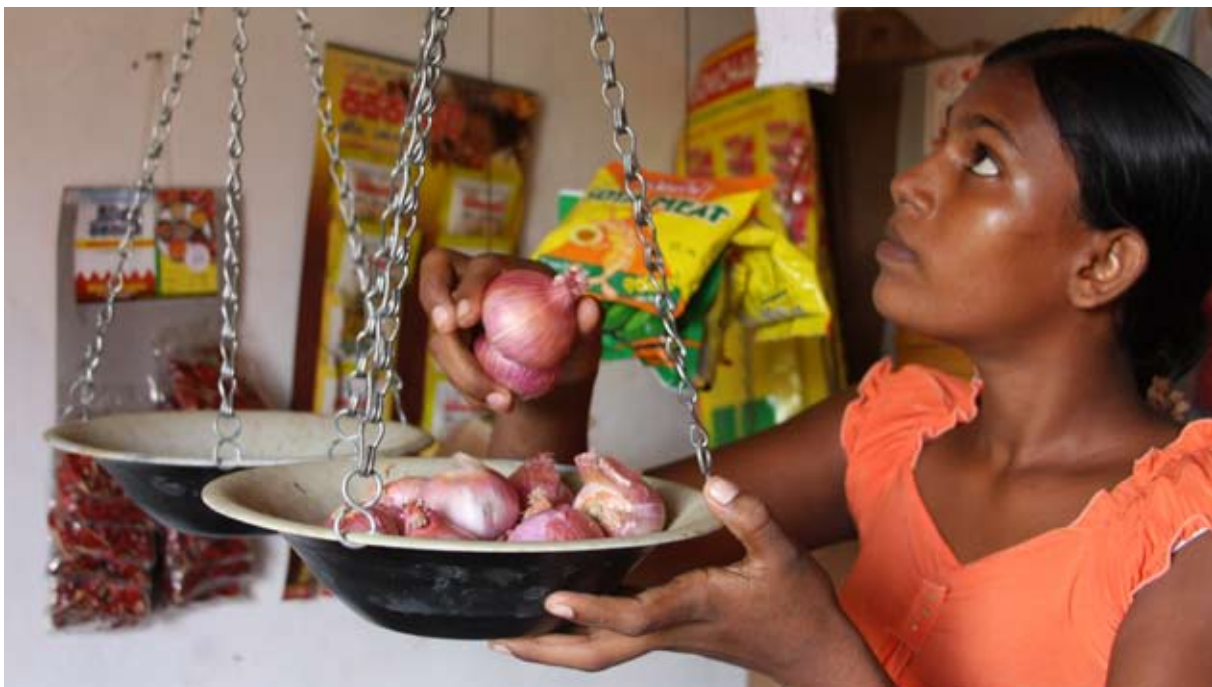
Trading for the future: A young woman entrepreneur has now set up a small shop adjacent to her home