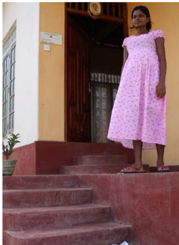
The foundations were elevated to withstand floods