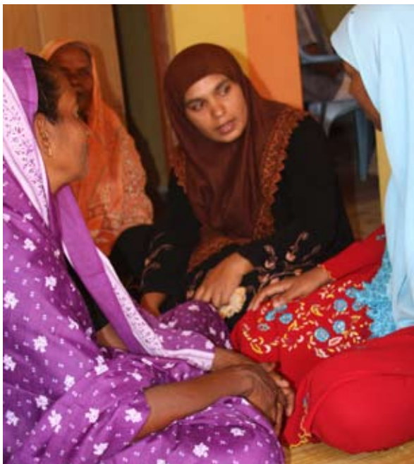
A group of women discuss their community plans, many women enjoyed leadership roles

Key stakeholders came together at Community