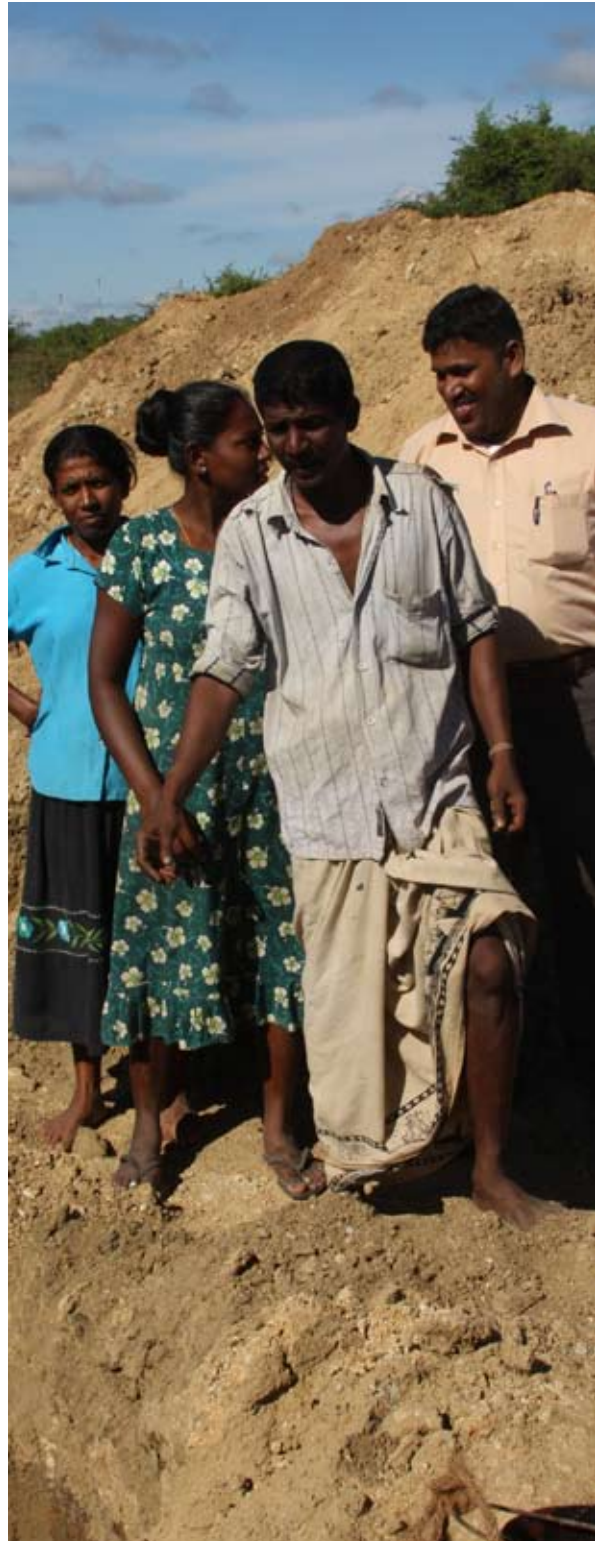
A diverse group from different ethnicities worked together to build a communal water supply