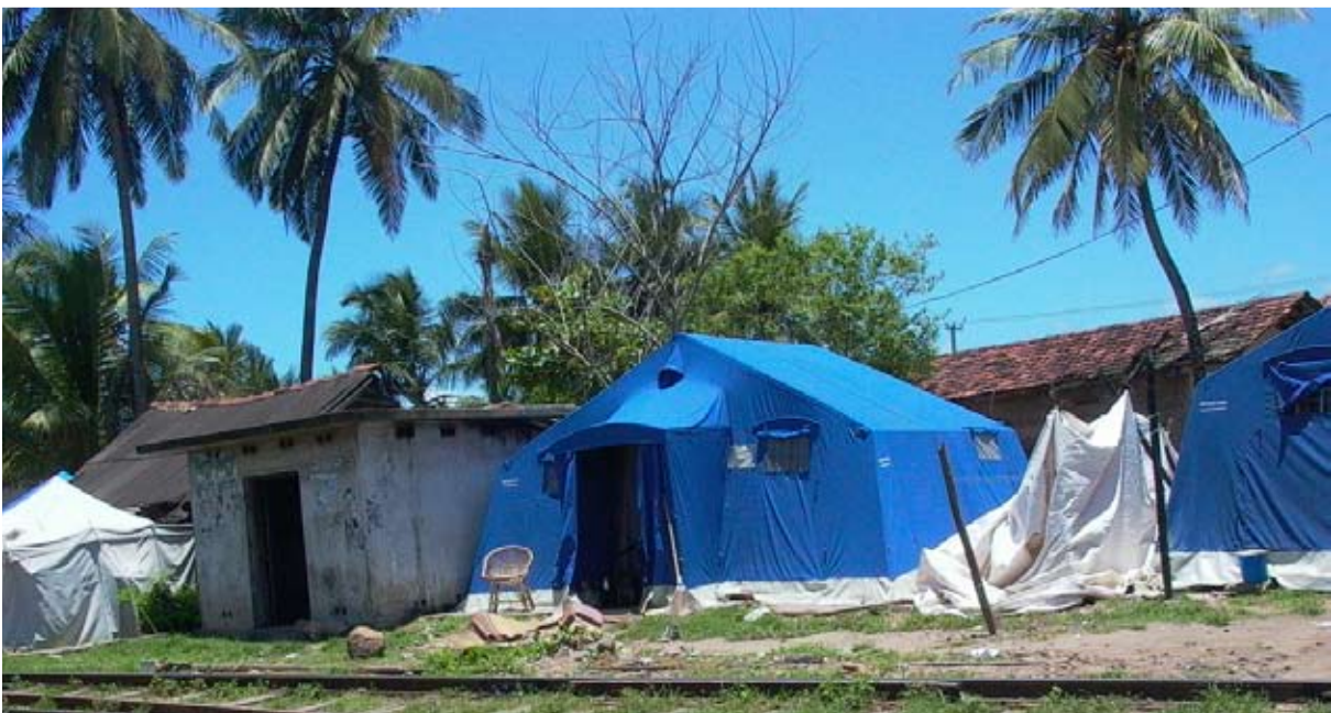
While emergency assistance was quick to arrive, sustainable recovery proved more challenging

The tsunami occurred the day after Christmas Day in 2004 and in many ways this timing proved to have enormous significance for what would follow. Sri Lanka is a popular tourist destination for tens of thousands of Europeans who are looking to