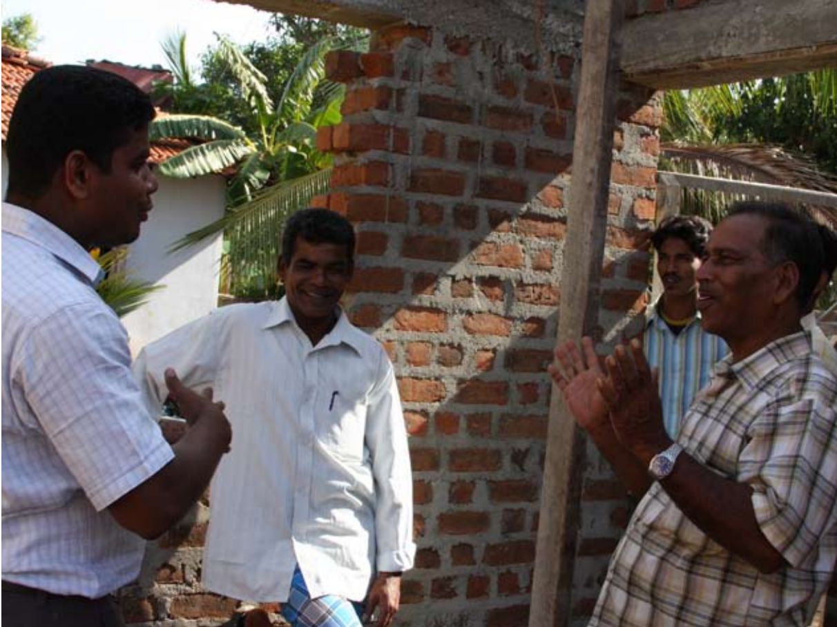
A Home owner, UN-HABITAT staffer and masons discuss the progress of construction

UN-HABITAT's tsunami response work was a coordinated effort carried out in partnership with a range of stakeholders. The formation and registration of CDCs was the beginning of partnership building within the community for collaborative decision making, problem solving and resource sharing. Communities learnt the principles of partnership: trust, solidarity and accountability through their experience of working together. Links were made between CDCs and Divisional Secretariats, Pradeshiya Sabhas, government departments, NGOs/INGOs and a range of supporters and donors, including the private sector.