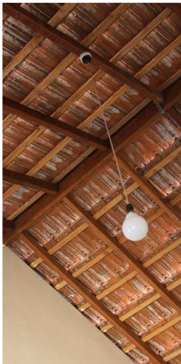
Tiled roofs are not only safer than asbestos, but they also ensure cooler interiors – especially in hot tropical climates such as coastal Sri Lanka

Mr. Chandana, the technical officer, was very particular about every detail. We had to complete something perfectly before going on to the next step. For example, we couldn't fix the doors until the frames were fixed exactly right. Sometimes we found this really frustrating. But we began to understand the value of doing this correctly. The CDCs began to supervise construction closely. Not even a small amount of cement was allowed to go waste. Some people saved money by buying materials in bulk and doing part of the construction themselves.