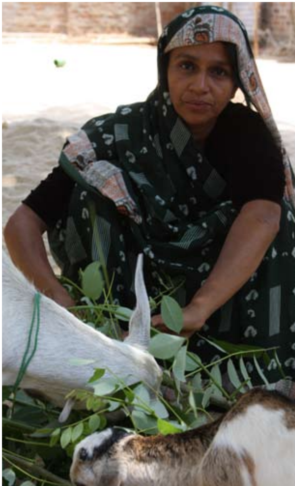
A sustainable Livelihood is a precursor to development: backyard farming and goat rearing is a popular choice

In many areas affected by the tsunami, although people had succeeded in rebuilding their homes, communities still had some way to go to achieve satisfactory infrastructure and livelihoods even five years later. In the Rebuilding Community Infrastructure and Facilities project implemented in collaboration with IFAD, UN-HABITAT's extensive experience in a people's process of reconstruction and recovery was once again put to good use. The project followed the same approach used for the reconstruction of houses: setting up CDCs (where they were none), holding CAP workshops, developing necessary community skills and, as far as possible, building infrastructure through community contracts managed by CDCs.