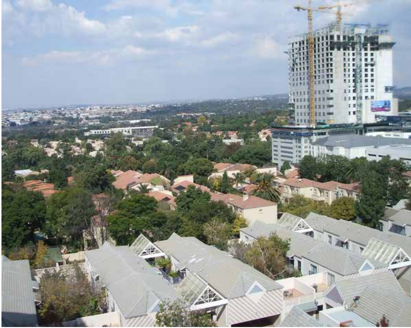
Housing in Johannesburg, South Africa.