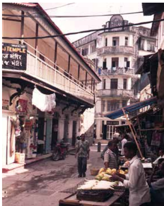
Zanzibar Tanzania.