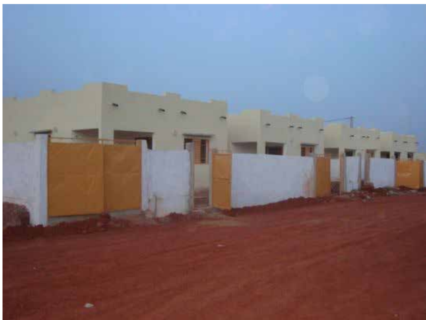
Low cost housing, Bamako, Mali.