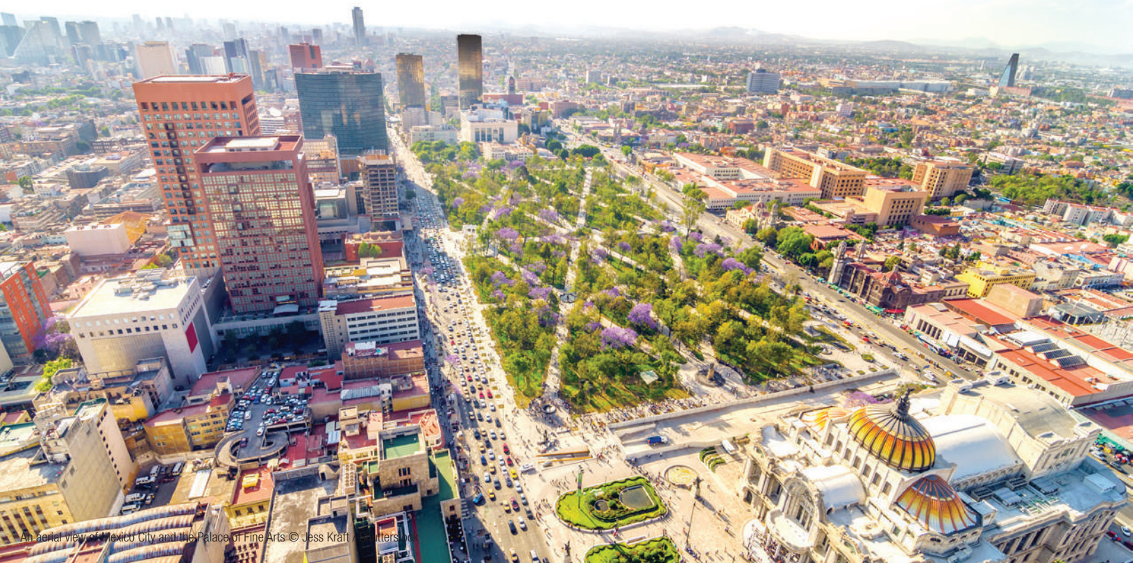
An aerial view of Mexico City and the Palace of Fine Arts