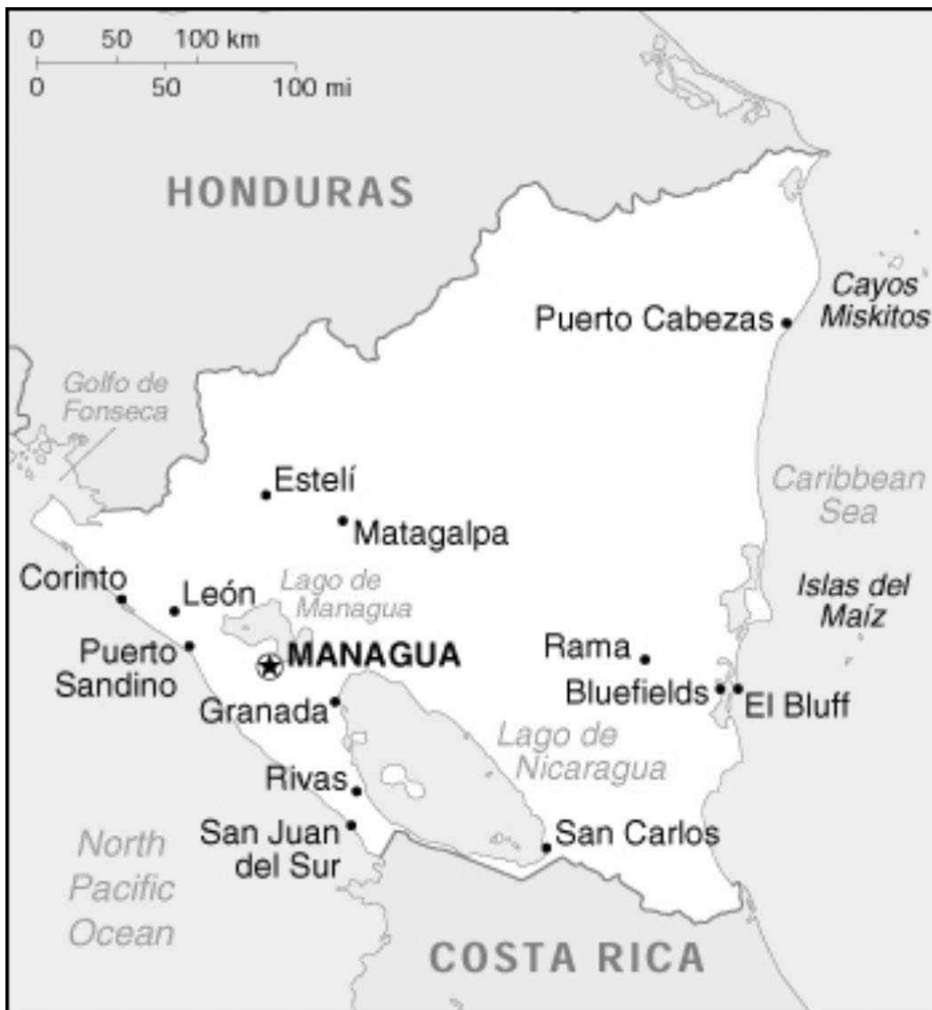
Figure 1.1 Map of Nicaragua

The final sections draw on information provided in the previous parts of the report. The best practices section tries to identify any positive and possibly replicable practices that have emerged. The conclusions section flows from the previous section, identifying problems and constraints to land and housing rights delivery. The final part of the report makes recommendations. These are designed to be realistic, taking into account the specific conditions in each country, within the context of the region.