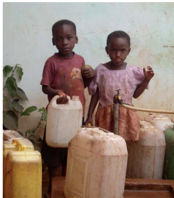
Children queue at water kiosk in Muleba, Tanzania.

Although there was a need for expenditure for immediate rehabilitation of the system and procurement of supplies and equipment (e.g. water quality testing kits, bulk meters, computers, software) to support improved operation and maintenance,