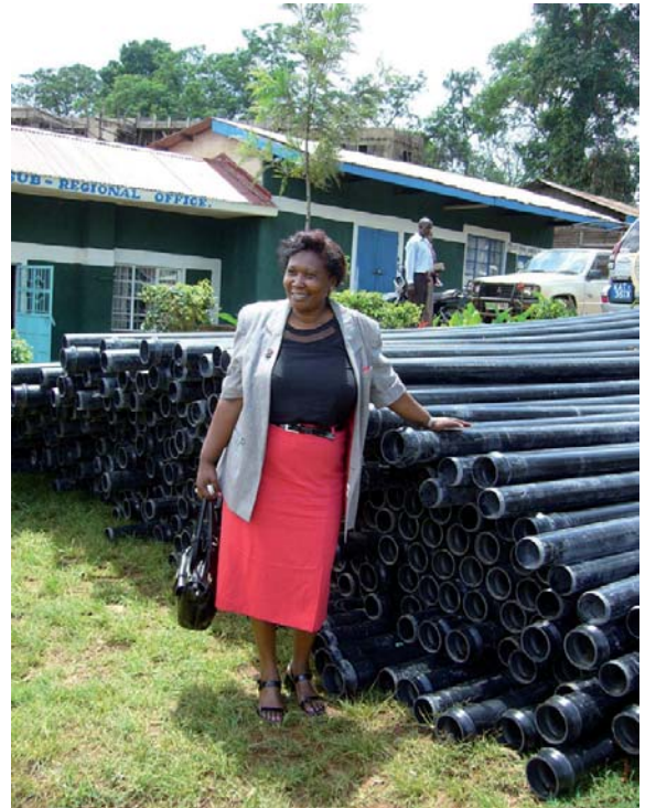
An official receives water pipes for the LVWSAN initiative in Homa Bay, Kenya.

● The Fast Track Capacity Building programme implemented by the National Water and Sewerage Corporation (NWSC) in Uganda under UN-HABITAT's 'Water for African Cities' programme demonstrates that an integrated programme of training and capacity building, combined with investments in physical infrastructure, offers the best hope of improving institutional capacities to reduce non-revenue water, improve service delivery and increase the sustainability of investments in the long-term. GRAHAM ALABASTER discusses the programme's success in five towns in Kenya and Tanzania.