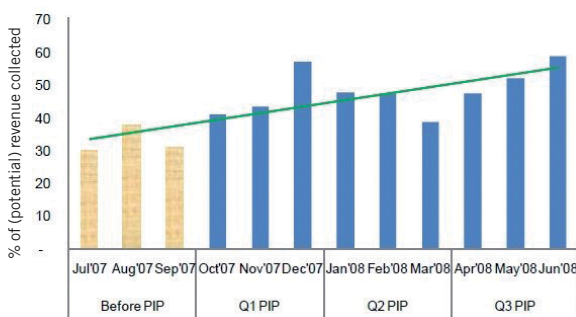
Figure 3: Revenue collection trends for BUWASA (July 2007 – June 2008)

Graham Alabaster is Chief of Section I of the Water Sanitation and Infrastructure Branch in the Human Settlements Financing Division of the United Nations Human Settlements Programme UN-Habitat, Nairobi, Kenya. Email: Graham.Alabaster@unhabitat.org