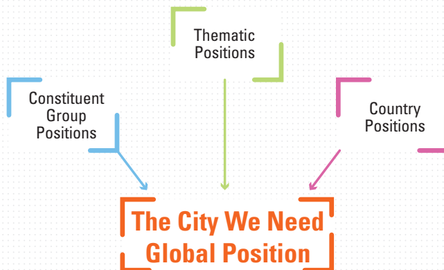
Figure 3: City We Need process framework

Constituent group positions shall be elaborated by each constituency through their own partnership process. All positions will be harmonized at the global level through the General Assembly of Partners for Habitat III.