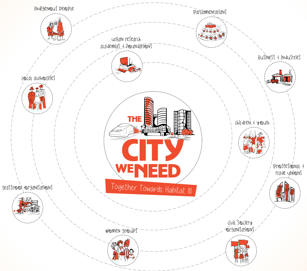
Figure 2: Partners categories proposed by the World Urban Campaign for 'The City We Need'