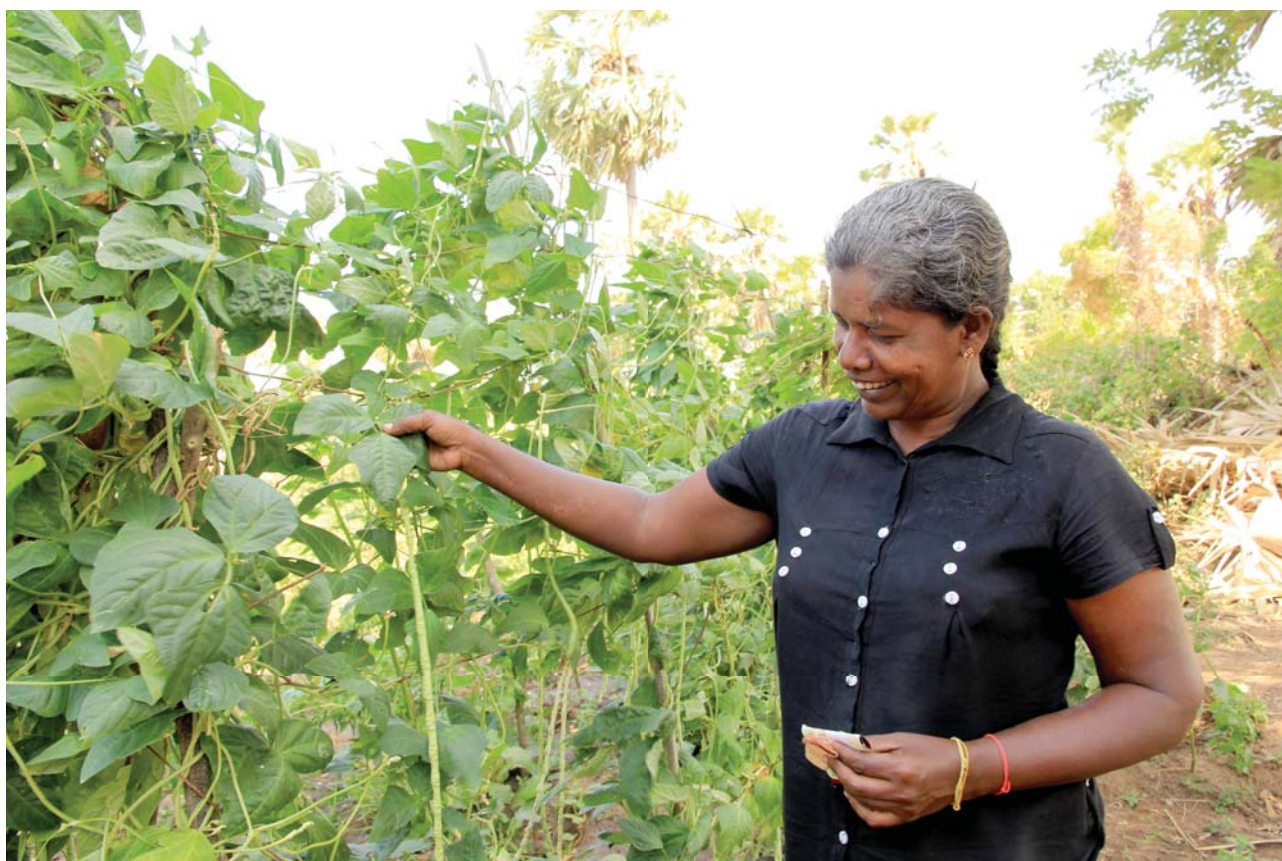
Home gardens provide nutrition and additional income for beneficiary families.