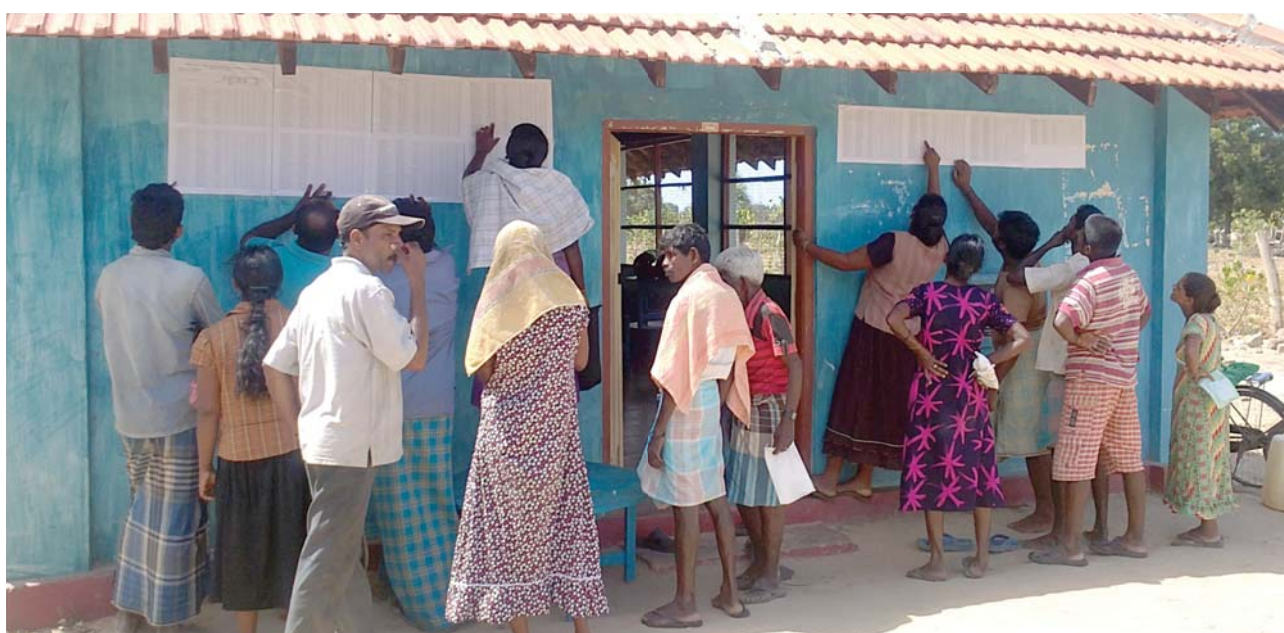
Community members scrutinising final beneficiary lists displayed at prominent locations for the Indian Housing Project.

As the number of households eligible for housing assistance greatly outnumbered the number of households allocated with available funding, a transparent beneficiary selection process was a vital requirement of the programme. This required the eligible beneficiaries to be carefully screened and selected. The eligible beneficiaries were ranked based on the vulnerability of the households as per the eligibility and ranking criteria. This selection process is different to that of selecting the vulnerable villages and providing assistance to all the eligible beneficiaries in the village. Although there are some merits in this method, experience shows that most vulnerable families in other villages do not have the opportunity for assistance. By choosing this method most vulnerable families in the entire district were included for assistance.