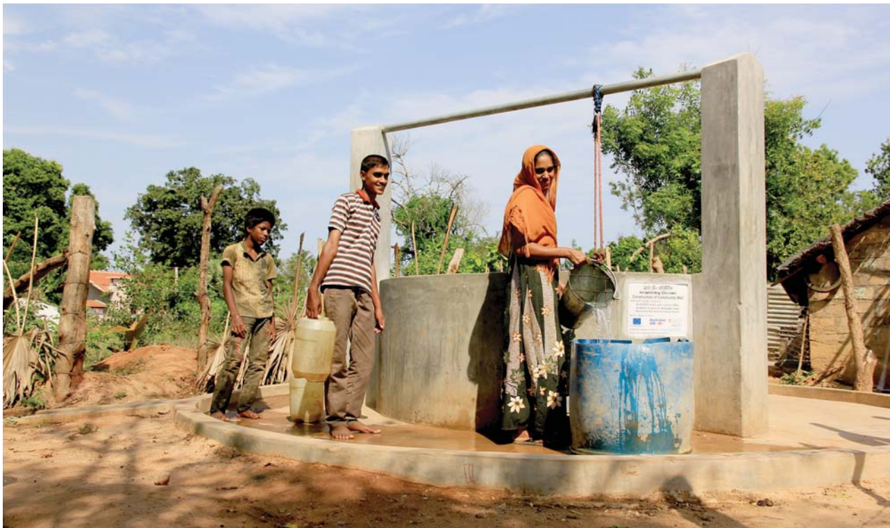
Residents collecting water from a community well in Mullaitivu district.

were handed over to the Agrarian Services Department, a government body with an appointed official in each area.