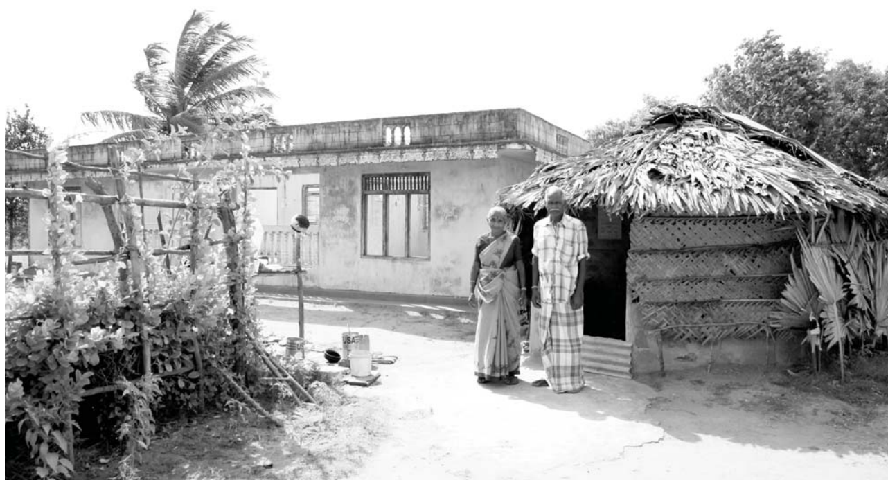
Returnee homeowners in Mullaitivu outside their temporary shelter. Their damaged house is in the background.

Frequent clashes resulted in the migration of large numbers of civilians in the Northern and Eastern