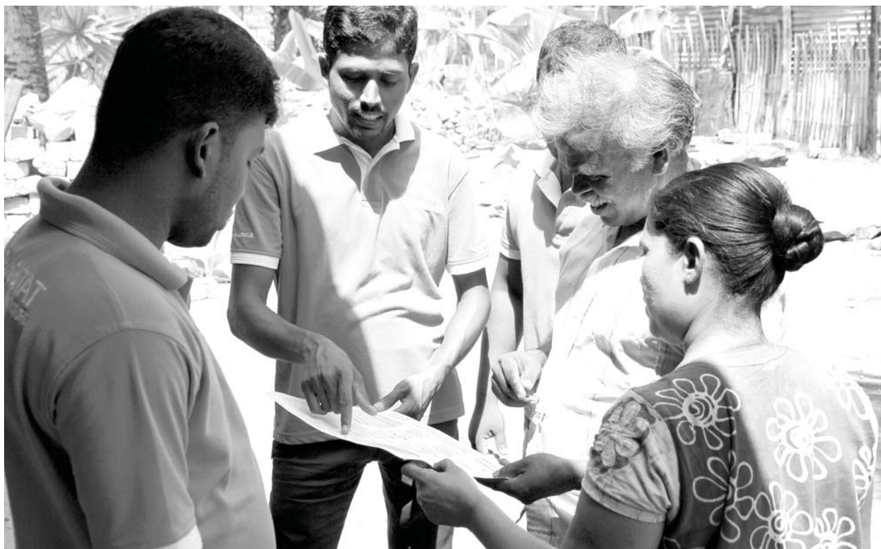
Homeowners in Mullaitivu discussing specifications of their house plan with UN-Habitat Technical Officers.

Once plans were finalised, a construction schedule was prepared, and homeowners began the process of