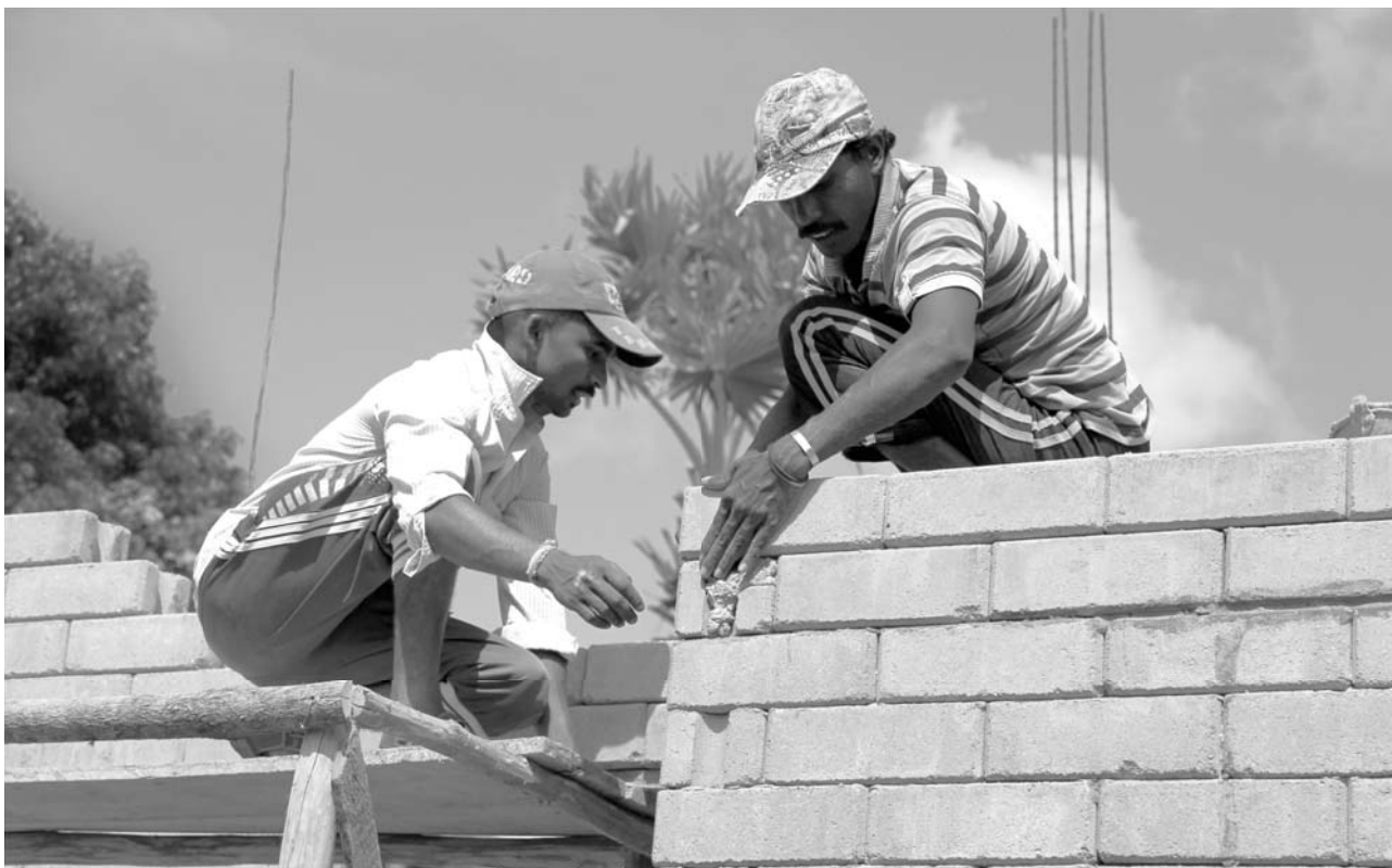
Masons constructing a wall using compressed stabilised earth blocks.