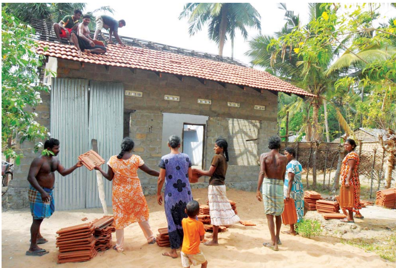
Members of VRCs collaborated to help vulnerable beneficiaries, such as elderly or female headed homeowners to construct their houses.

Another unexpected need for women's empowerment was discovered in fishing villages, where the majority of men returned from the sea in the mornings after working all night, and slept most of the day. This left the house construction in the hands of the women.