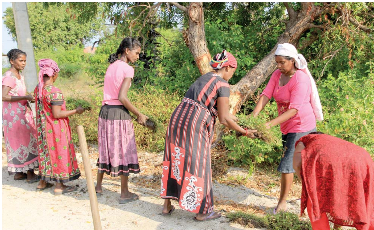
Members of the Kovilvayal Women's Rural Development Society performing voluntary shramadana activities to turf the roadside.

Most of the infrastructure facilities were constructed parallel to, or after the construction of housing to ensure rapid development of conflict affected villages. UN-Habitat field staff initiated discussions with the community members through Settlement Improvement Planning Workshops to identify the needs and available resources of each community for the development of their village. Action Plans were drafted accordingly, prioritizing essential infrastructure for each village. The design of each infrastructure project was customised according to the needs of the community in collaboration with the relevant local government authorities.