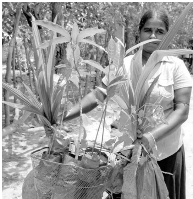
Tree saplings were distributed to community members in project locations.

UN-Habitat made a concerted effort to increase the level of forest cover and to restore the green cover lost due to construction activities through an extensive community based initiative that resulted in the planting of more than 170,000 saplings. These included species of timber and fruit trees. These serve a dual purpose, with the fruit trees providing an additional source of income for homeowners and the timber trees providing shade as well as timber for maintenance of homes and an additional income. In addition, the trees will improve the overall quality of the environment including air and thermal quality, soil stabilisation and ground water recharge.