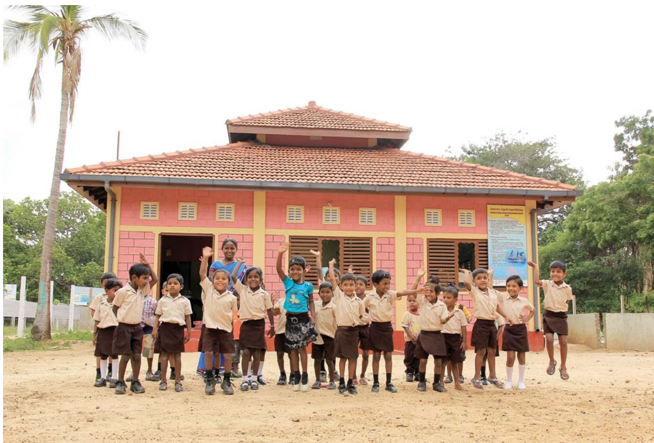
Child friendly concepts were introduced to newly constructed preschools.

Therefore, when housing grants were released to beneficiaries, a significant number were trying to meet their day to day needs from the grant. In the case of housing construction, some homeowners built their houses with larger plinth areas by borrowing additional funds through loan schemes, which further negatively affected their financial situation. This often resulted in a half-built house with inadequate finances to complete the construction.