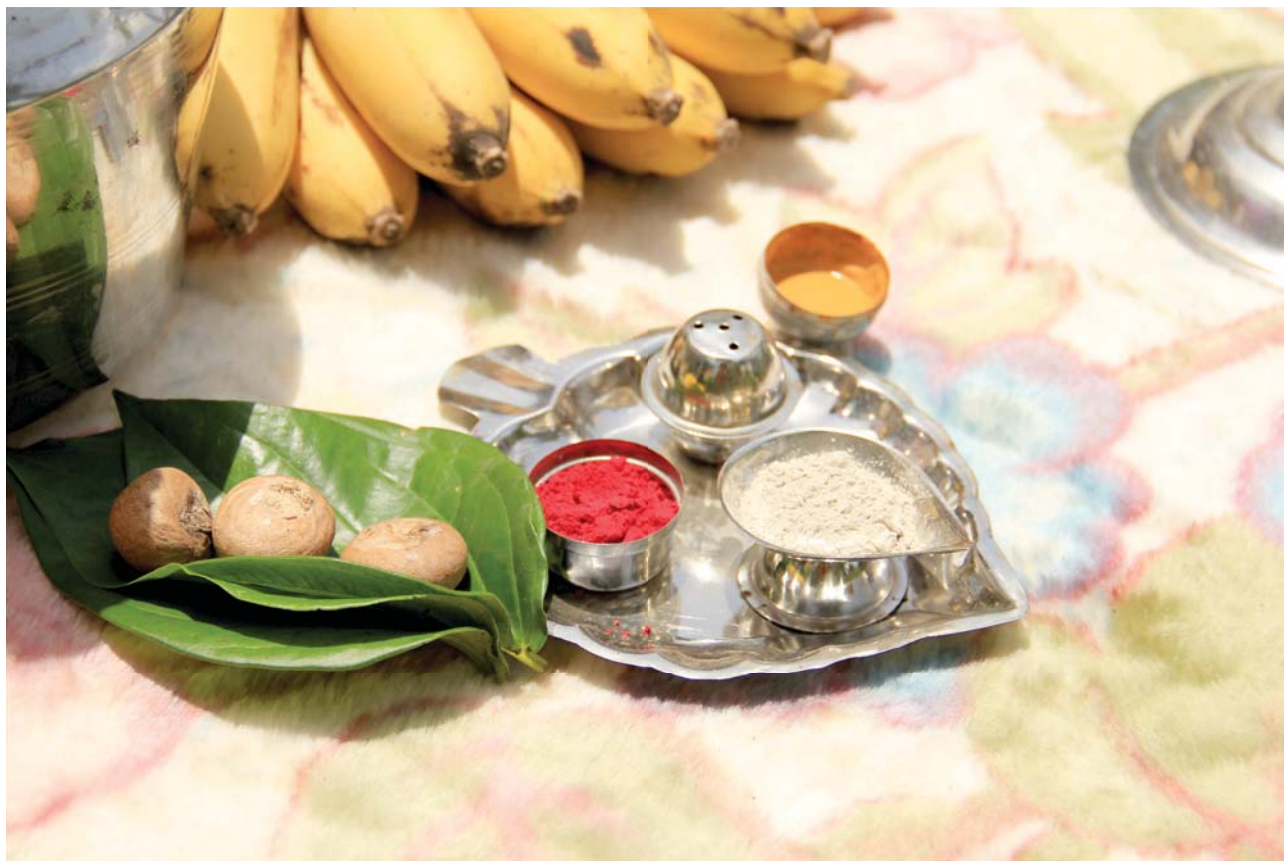
A traditional Hindu welcome table at a house warming ceremony in the Northern Province.