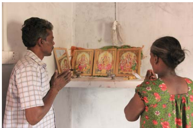
The shrine room served a dual purpose - a place of worship and a room to store valuables.

multi-functional community centres and preschools, UN-Habitat followed a policy of respecting all religions. In some regions, several villages of different religious faiths were brought closer together by the provision of shared infrastructure provided by the programme.