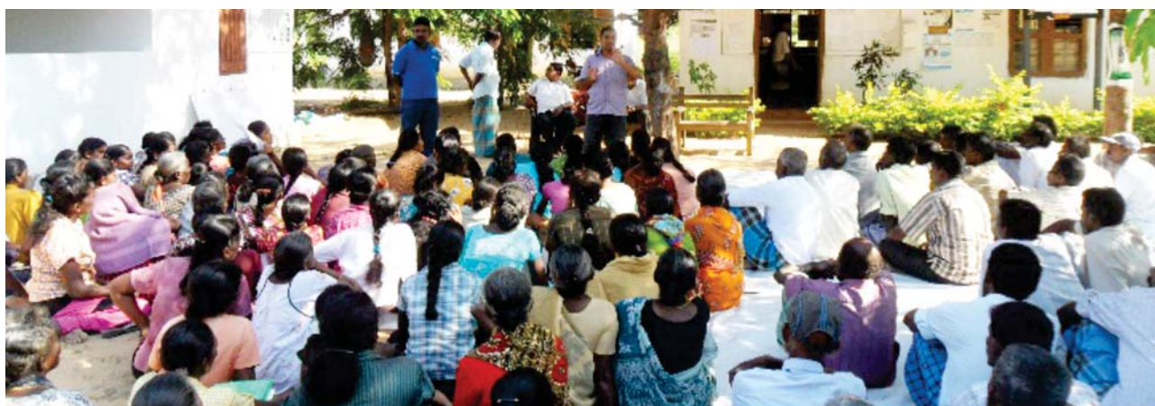
Community members participating in a mass meeting.