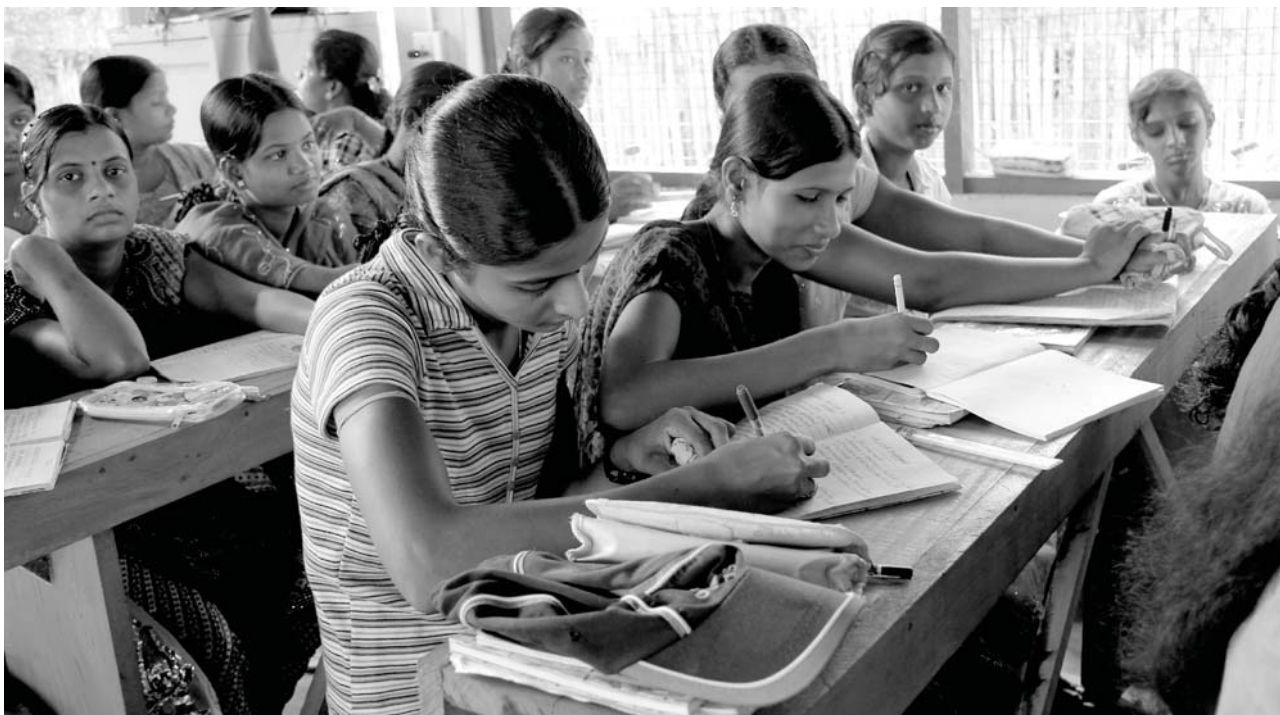
Classroom masonry training in progress in Kilinochchi district.

commenced during the early stages of projects, in order to ensure rapid completion. In addition, youth skills development training and engagement in construction resulted in new livelihood opportunities, which was an important factor considering that in the immediate aftermath of the conflict, lack of employment opportunities and space for meaningful engagements in remote villages led many youth towards anti-social activities and alcoholism.