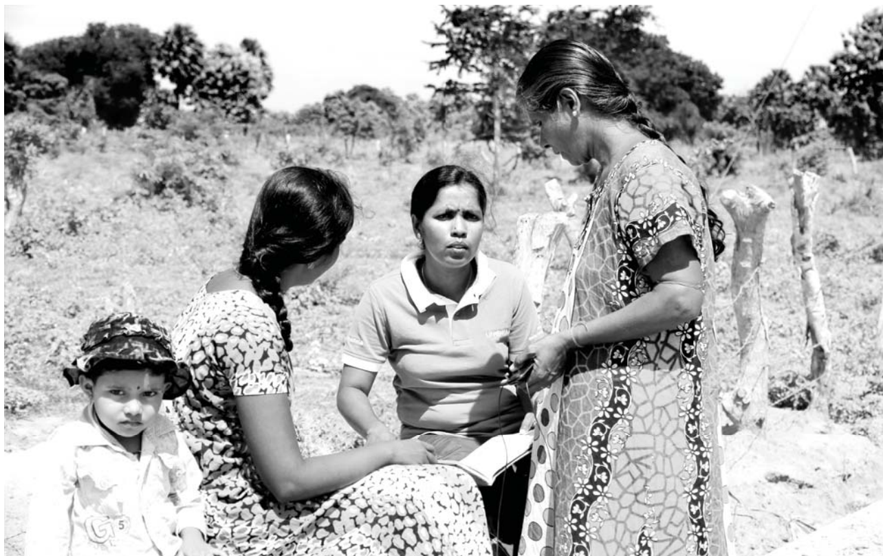
UN-Habitat officer discussing road construction with members of a Women's Rural Development Society in Mullativu.