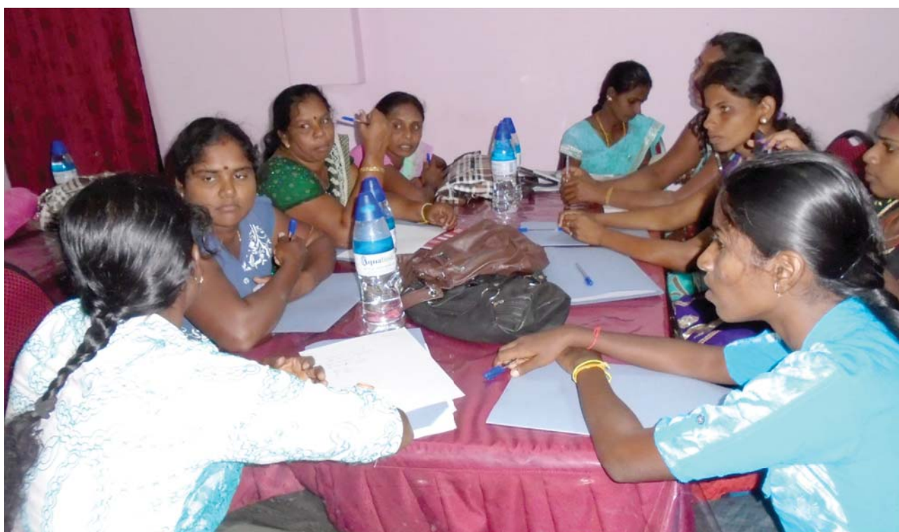
Small savings groups were established in villages.

UN-Habitat engaged more than 60 Women's Rural Development Societies (WRDS) to construct community infrastructure facilities including internal access roads, storm water drainage systems, community centres and preschools. In general, it was experienced that WRDSs displayed a high level of commitment in ensuring quality of work and completing projects on schedule.