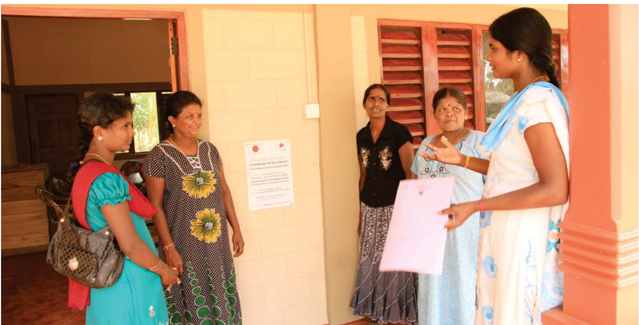
UN-Habitat worked closely with community members to implement the projects in villages.

Data for this report was drawn from field visits, interviews with staff of UN-Habitat Sri Lanka, and from material published by UN-Habitat Sri Lanka.