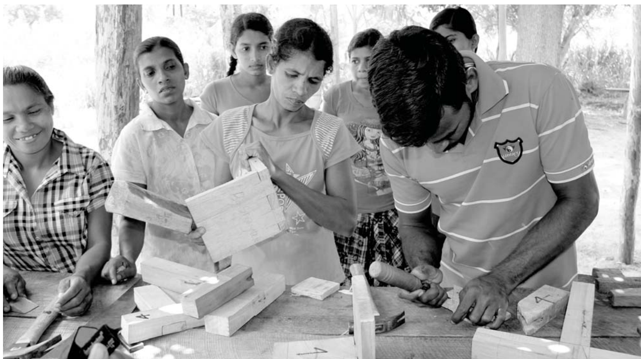
Young men and women participate in practical carpentry training programme in Welimada, Mullaitivu District.

The experience in the programme showed that training in construction methodologies should be