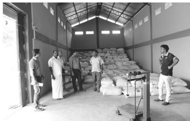
Rice paddy stored in a community storage facility in Kilinochchi district.

A total of 13 storage facilities were constructed as infrastructure interventions in communities. These