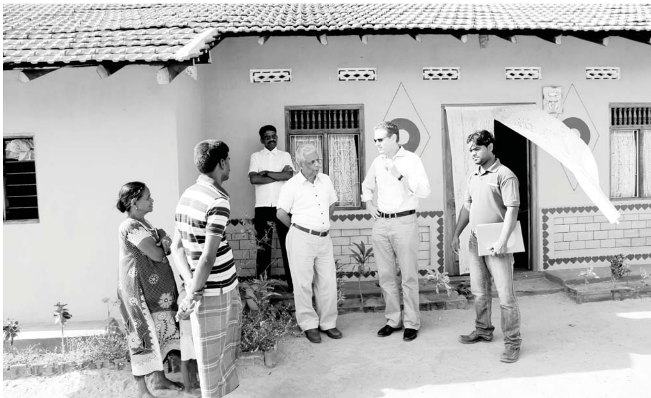
UN-Habitat staff provided vital technical assistance to homeowners to construct their houses.