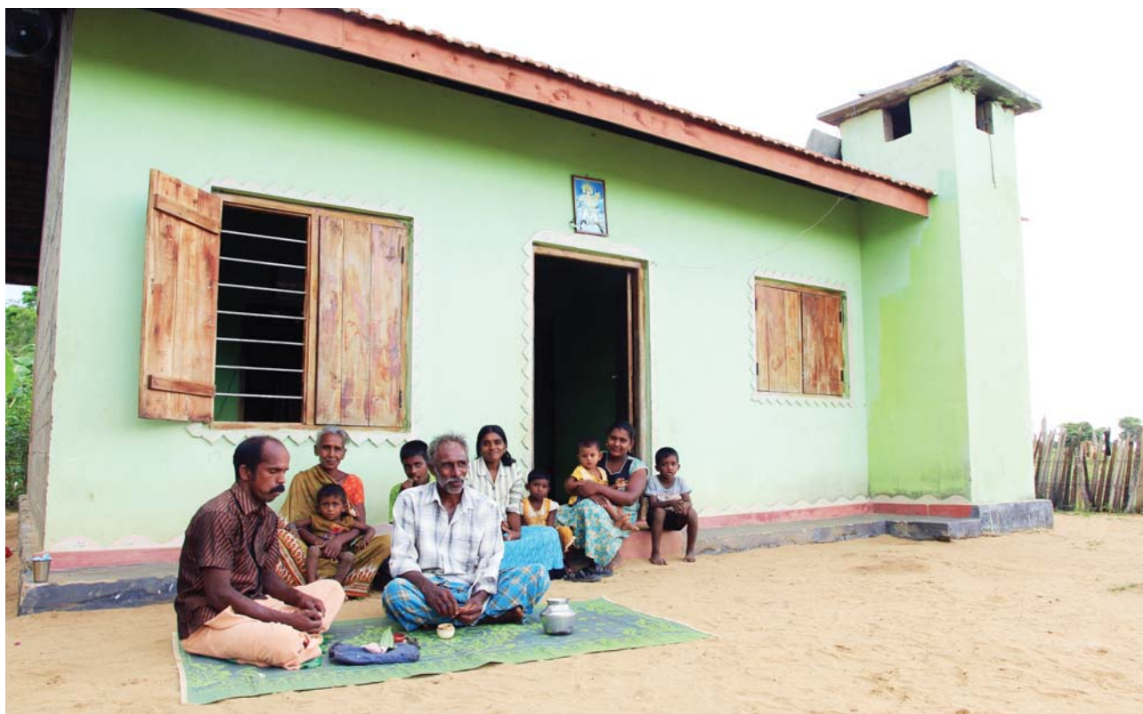
Over 31,000 houses were constructed in the North and East using a homeowner driven process.

F or many decades, the United Nations Human Settlements Programme (UN-Habitat) has been providing assistance to rebuild lives devastated by natural disasters and conflicts around the globe. Yet, no two situations are ever the same. Each provides a unique set of circumstances, and every new initiative produces fresh challenges and opportunities to learn.