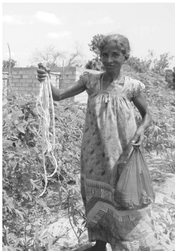
Organic vegetables from a home garden in the Northern Province.