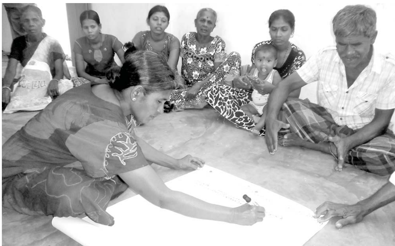
CAP workshops provided opportunities for community members to map the development priorities for their villages.

development or creation of new settlements. Therefore Settlement Improvement Planning exercise was confined to planning of improvements needed for existing villages. An important tool in ensuring community involvement in the participatory process was the series of Participatory Settlement Improvement Planning (SIP) workshops, also known as Community Action Planning (CAP) workshops, which were organised in many villages during the programme. The SIPs provided the space for community members to provide insights into the development of their respective communities through the identification of gaps in infrastructure facilities and prioritisation of needs.