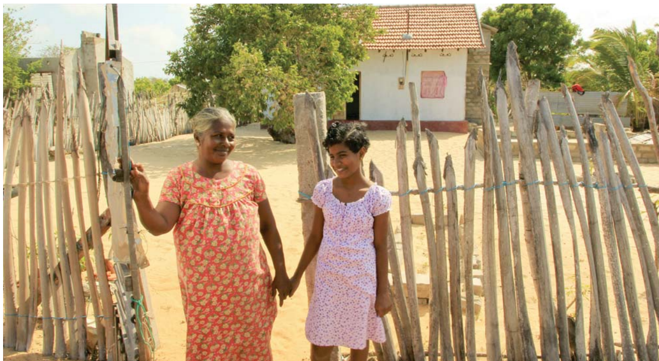
Female headed homeowner in Jaffna district with her daughter in front of their permanent home.

during the conflict. During SIP workshops it was discovered that some priority needs, including livelihoods and health, were outside the purview of the project and were referred to relevant agencies.