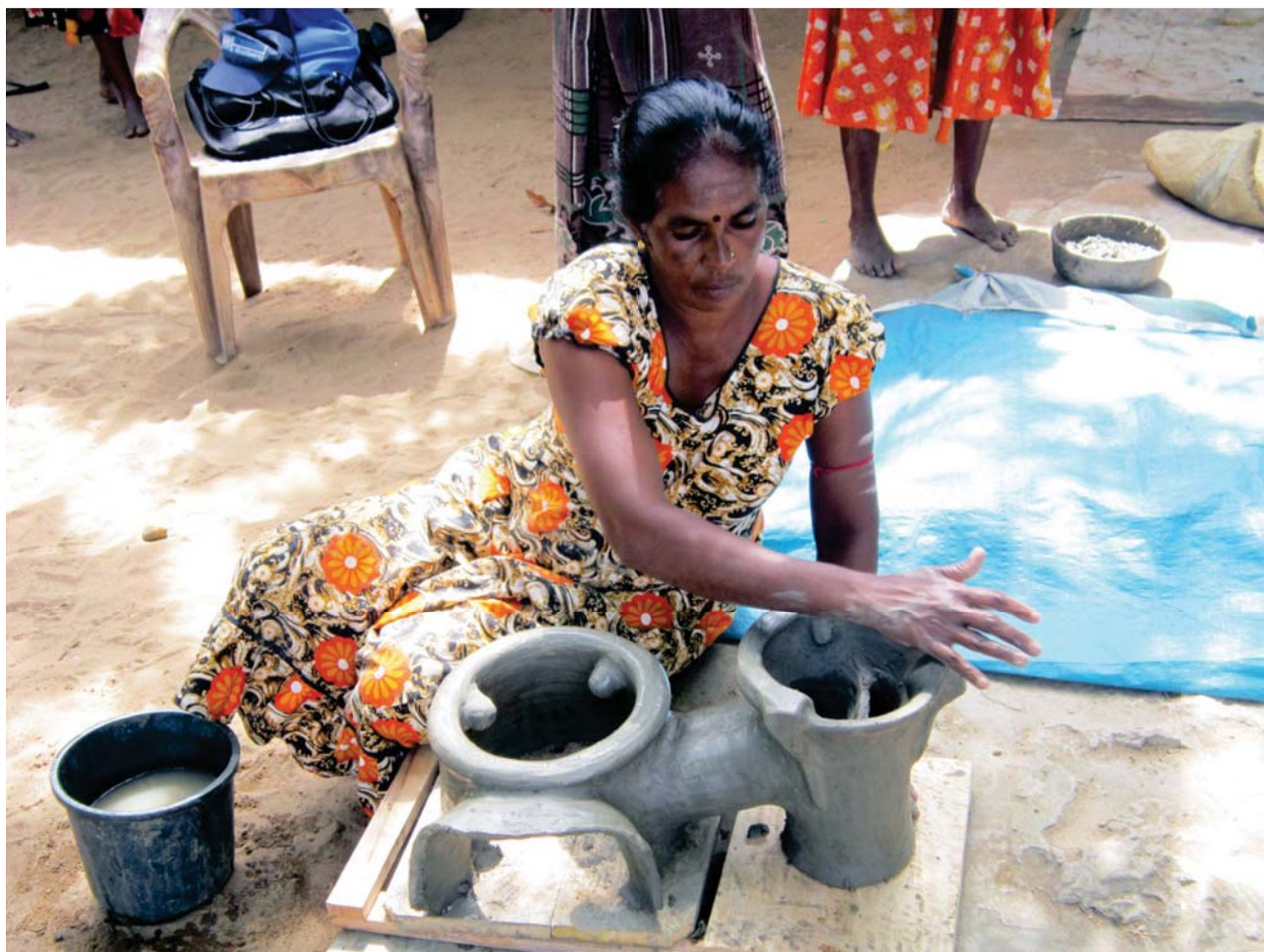
Female potter producing Anagi cooking stoves.

with a national NGO, the Integrated Development Association (IDEA) to implement this initiative.