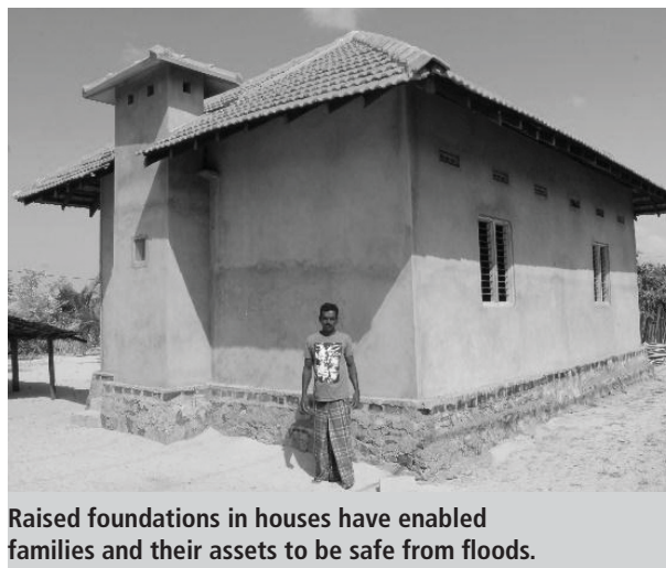
Raised foundations in houses have enabled families and their assets to be safe from floods.

UN-Habitat's integrated approach served to ensure that some aspects of DRR were included in the post-