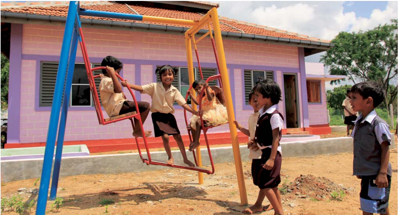
The programme helped communities construct infrastructure facilities, including preschools.

measures in construction, mainstreaming gender equality, boosting the local economy and environmental conservation. While these may seem commonplace, it must be remembered that the 30-year conflict had in many ways stalled progress in the main conflict regions.