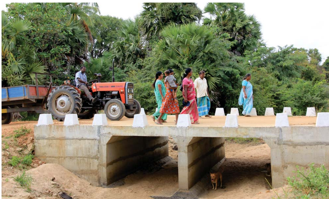
The storm water drainage system constructed in Puliampokkanai GN division.