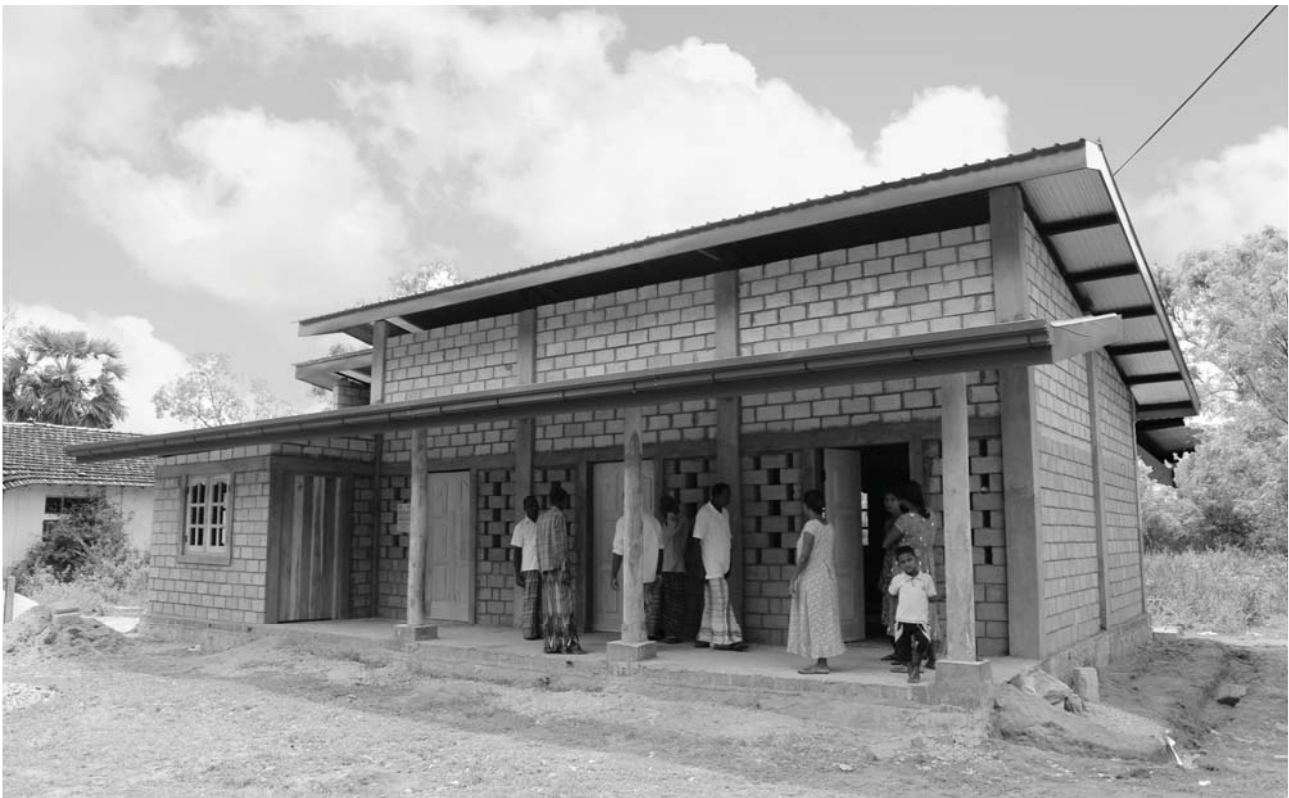
Mahilawedduwan Community Centre in Batticaloa district constructed using Mud Concrete Blocks.

The traditional “cement: lime: sand” plastering of walls, finishing with emulsion paints, proved quite costly for homeowners. The introduction of mud plastering and mud paint on a pilot scale in a number of houses offered a low cost alternative to the traditional methodology.