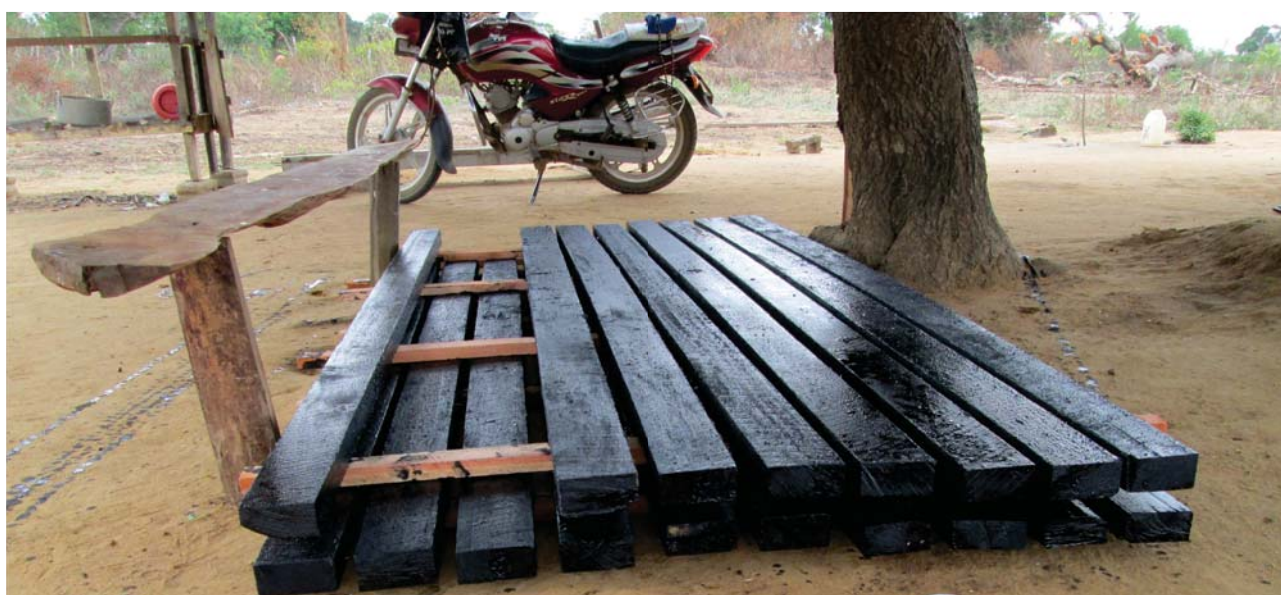
Treated roof timbers.

UN-Habitat through focused awareness programmes, educated the skilled workers and beneficiaries in a number of good practices to reduce wastage. These included proper site planning, correct method of mixing and using cement mortar and concrete, methodical stacking and storage of materials, regulating block dimensions and ensuring uniformity in size when casting of blocks, coordination of