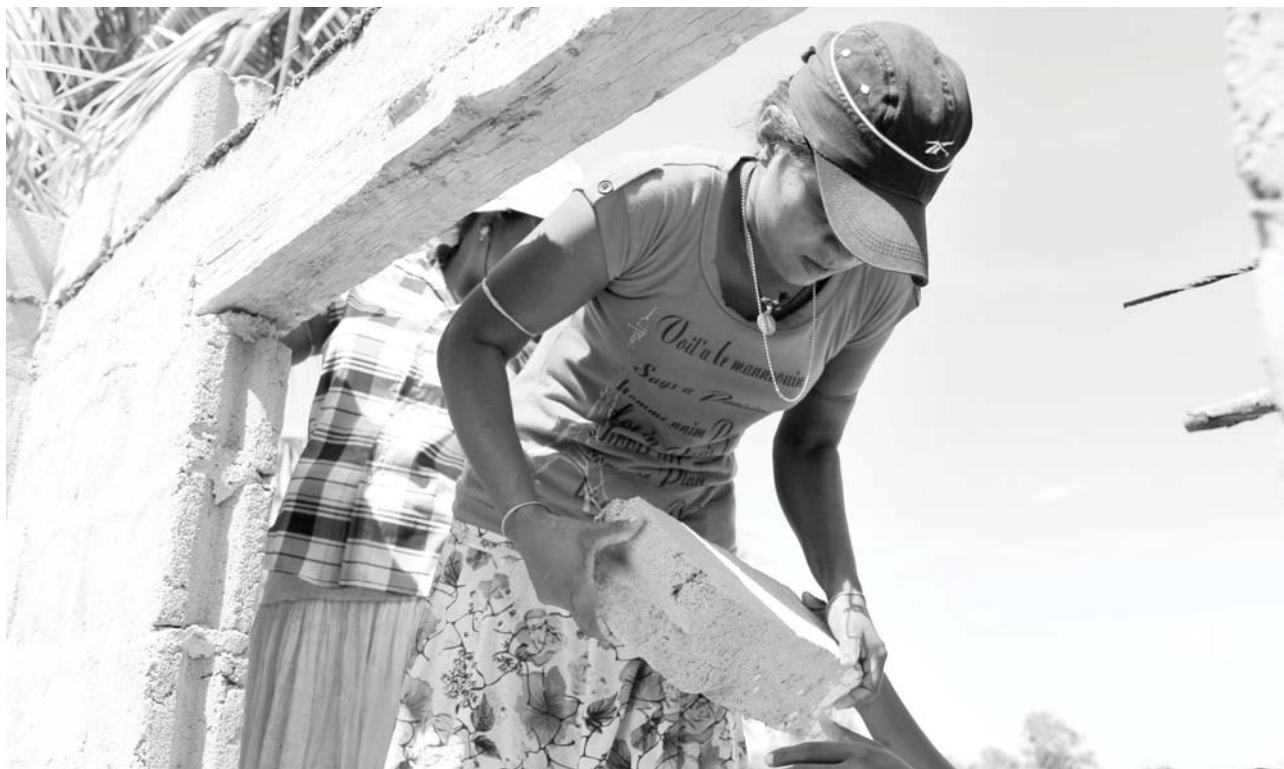
Female masonry trainees undergoing "on the job" training in Kilinochchi District.

conditions, served to improve access of both women and men to resources, most importantly encouraging female-male power balance, and positively transformed the unequal gender relations to achieve equal benefits.