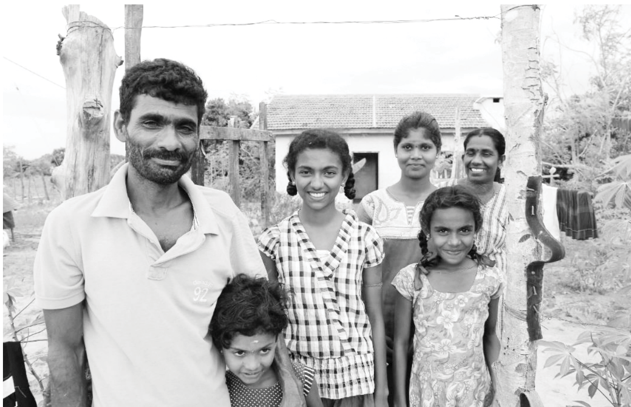
A happy family outside their newly constructed house in Batticaloa district.