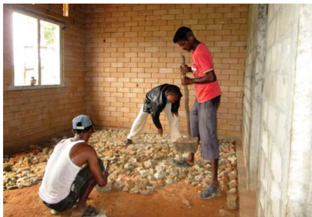
Using recycled material in foundations and floor concrete.