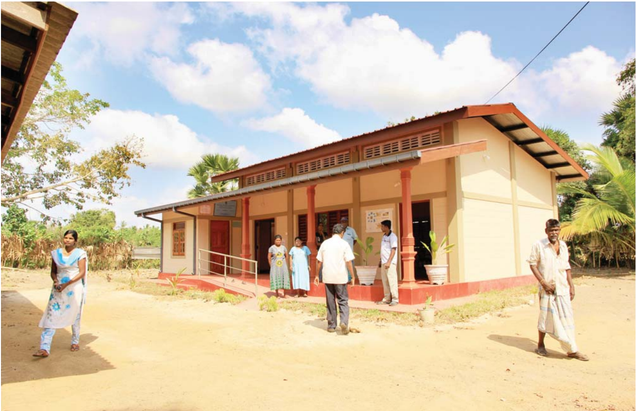
All public buildings constructed by the project included wheelchair ramps for differently abled and elderly persons.