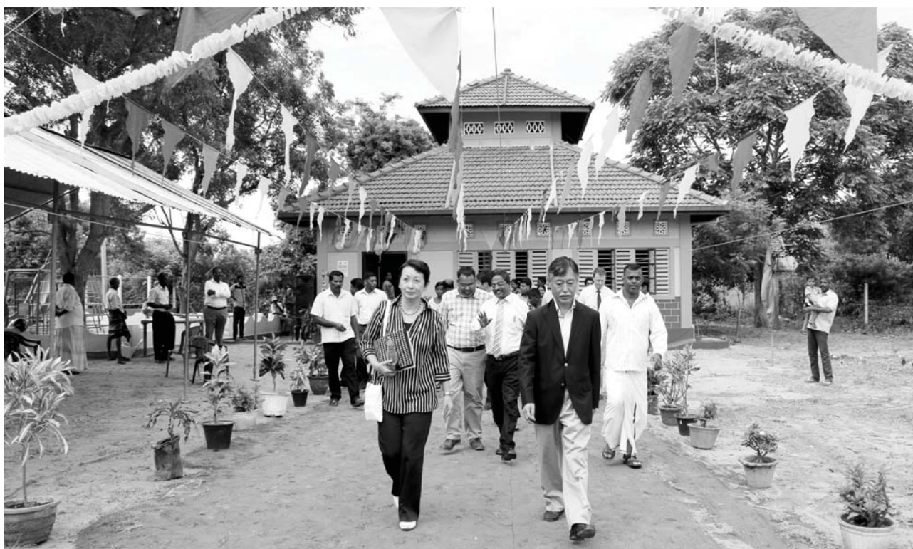
Opening of preschool by the Japanese Ambassador in Sri Lanka.

UN-Habitat worked in close collaboration with the PTF with regular monthly meetings to keep PTF members informed of progress of the reconstruction programme, challenges and issues faced, and to obtain the assistance of the PTF. UN-Habitat