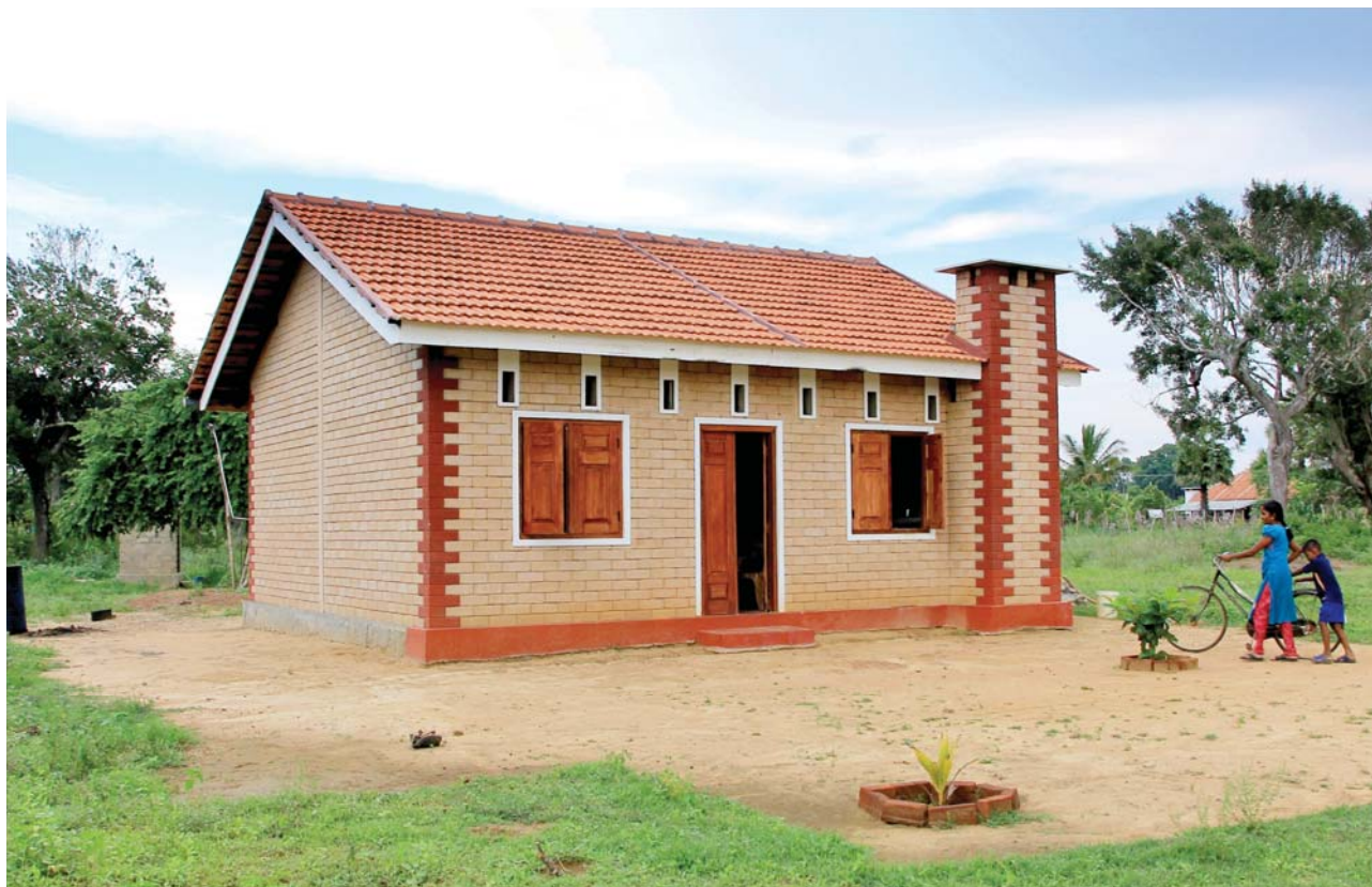
Model demonstration house constructed using CSEB for walls.

The cost of transportation of CSEB from outside the Northern Province was also prohibitive which resulted in limited usage of this building material to a few houses.