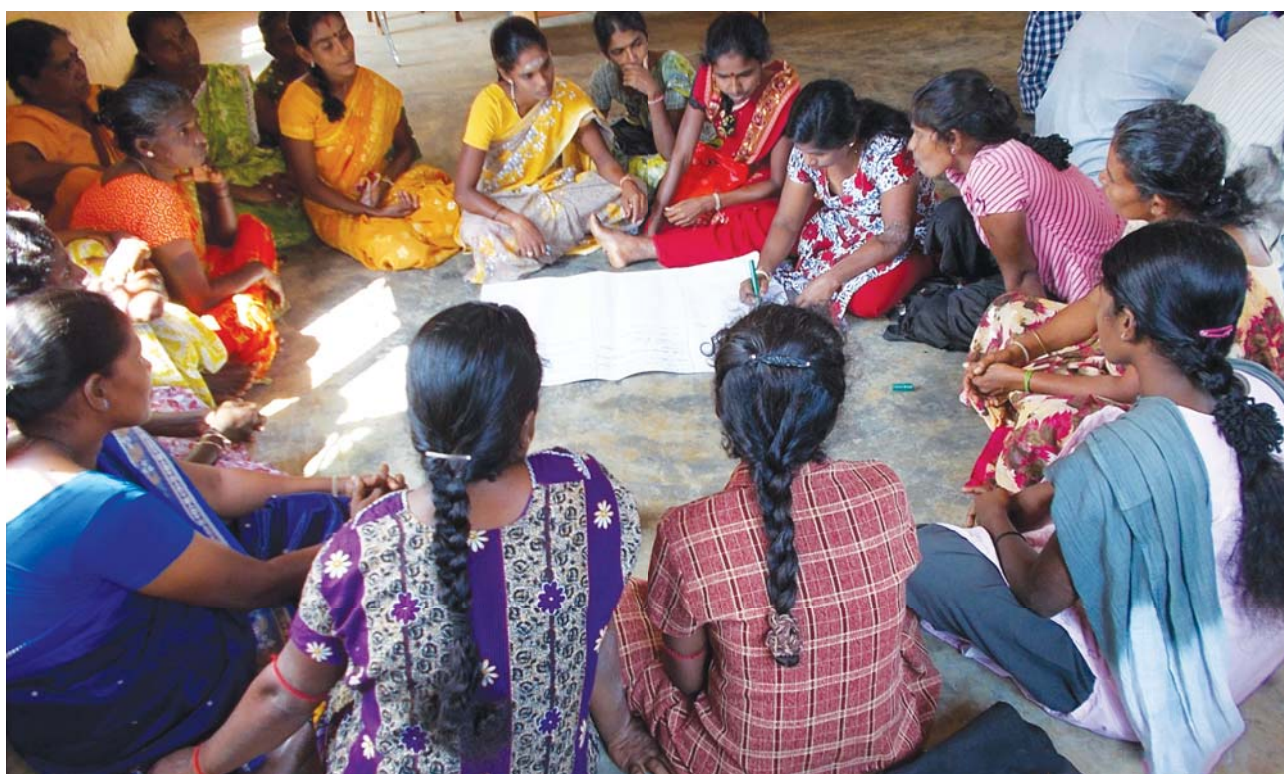
Community participation was a key aspect of UN-Habitat's approach.

The programme also witnessed the introduction of concepts such as access for the differently abled, child friendly facilities, disaster risk reduction