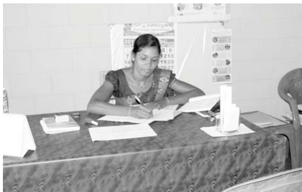
Samurdhi Officer in her office at the Thiruvaiyaru Community Centre in Kilinochchi district.

The standard community centre design included a large meeting hall, two office rooms for village administrative officers, toilets and a front verandah that is used as a waiting area. Three designs were developed by UN-Habitat with varying meeting hall sizes to suit the size of the community. The communities and government stakeholders were consulted in customising the designs to suit each village. Disaster risk reduction features were incorporated into the construction to ensure