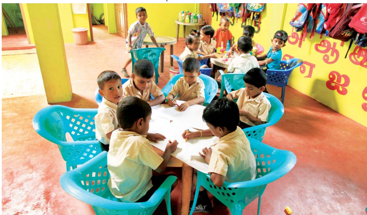
Preschool children in the bright and airy environment of their newly constructed preschool.

In addition to providing the building and equipment, the programme also contributed towards capacity building of preschool personnel in the North. Through a partnership with Save the Children Japan, selected preschools were provided with specialist training, targeting teachers and preschool management committee members. This included conducting a preschool teacher diploma course, training on Child Friendly Teaching Methods and Preschool Management techniques. This joint initiative provided training for 21 preschool teachers on child-friendly teaching methods in seven preschools in the Mullaitivu District, and training on overall pre-school management to over 70 members of the Management Committees in the seven preschools.