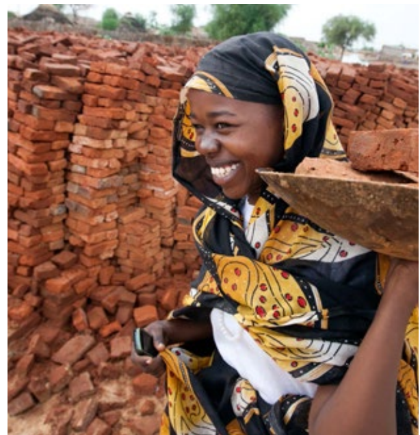
A young woman carries bricks for the construction of a community center in Althoura Shemal in El Fasher, North Darfur.