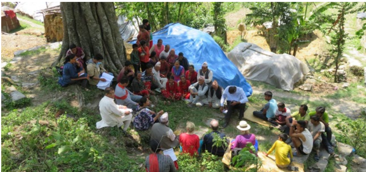
Promoting the use of STDM in Nepal as a flexible, sustainable and holistic tool for enumeration.

4. These initiatives were driven by an intelligent implementation strategy that was catalytic and based on facilitation and working through global and national partners, rather than direct implementation. Its design was responsive to the urban governance, legislation and land objectives of UN-Habitat's Medium-Term Strategic and Institutional Plans for the 2008-13 and 2014-19 periods. The project's relevance was reinforced by its consistency with the Voluntary Guidelines for the Governance of Land Tenure (VGGTs) and regional programmes implemented by the consortium of