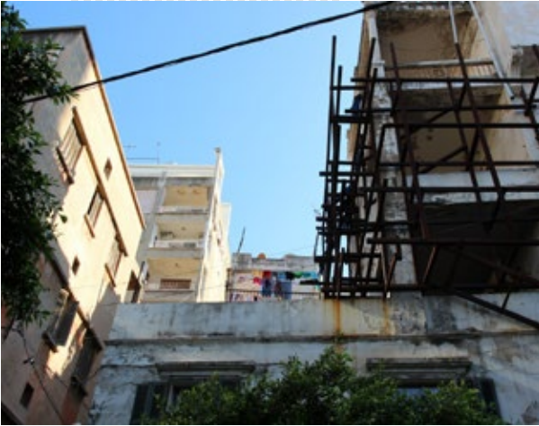
Developing capacities and exploring solutions to land and tenure security challenges in the Arab States.

13. To a large extent, the evaluation focused on the implementation of land tools in six pilot countries that were selected under the GLTN's second phase, five of which are in Africa. The lower level of activity in other regions ultimately limited the programme's global impact. Most in-country demonstrations were based on the Social Tenure Domain Model (STDM) tool and participatory enumerations, with lesser use of tools such as the Gender Evaluation Criteria (GEC).