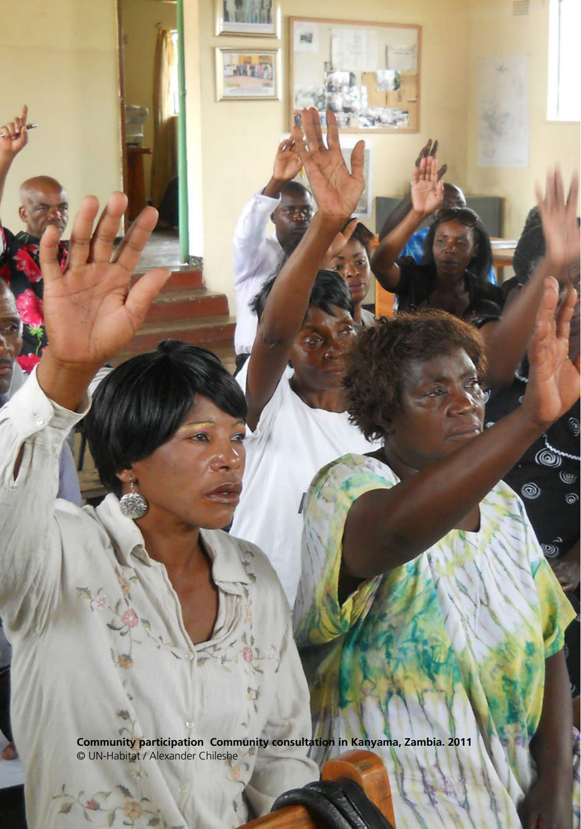
Community participation Community consultation in Kanyama, Zambia. 2011