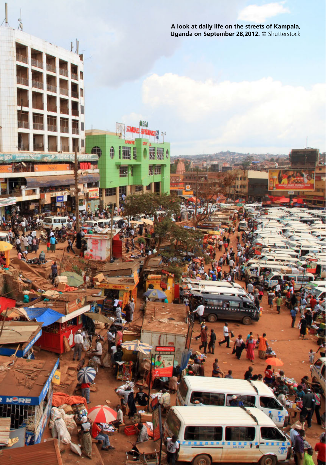
A look at daily life on the streets of Kampala, Uganda on September 28, 2012.