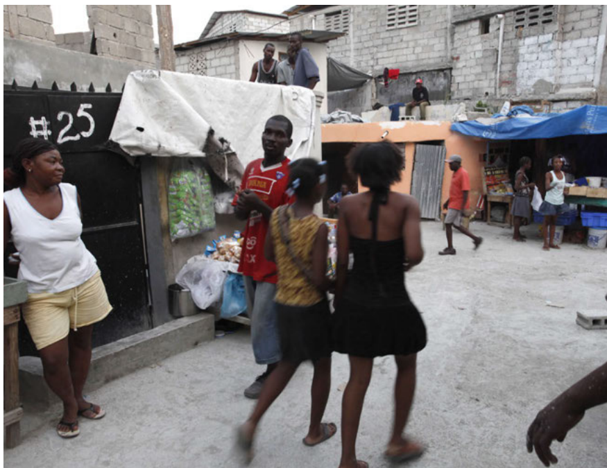
A street scene in Delmas 32, a neighborhood in Haiti.

Women, children, youth, indigenous people, older persons, minorities and vulnerable groups suffer disproportionately from the practice of forced evictions. Women in all (the afore mentioned) groups are especially vulnerable given the extent of statutory and other forms of discrimination, and their vulnerability to acts of violence and sexual abuse when they are rendered homeless.” 2