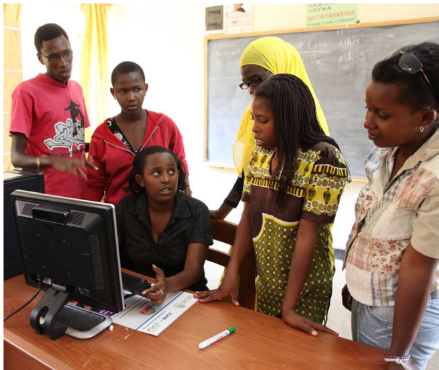
Youth taking part in a computer training at the UN-HABITA One stop Center in Kigali, Rwanda 2012