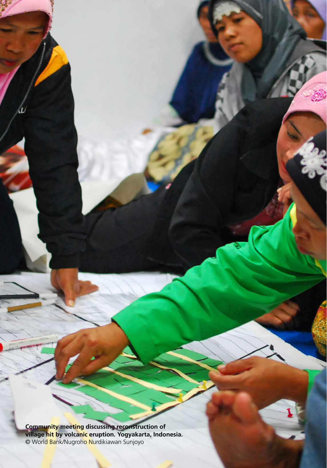
Community meeting discussing reconstruction of village hit by volcanic eruption. Yogyakarta, Indonesia.