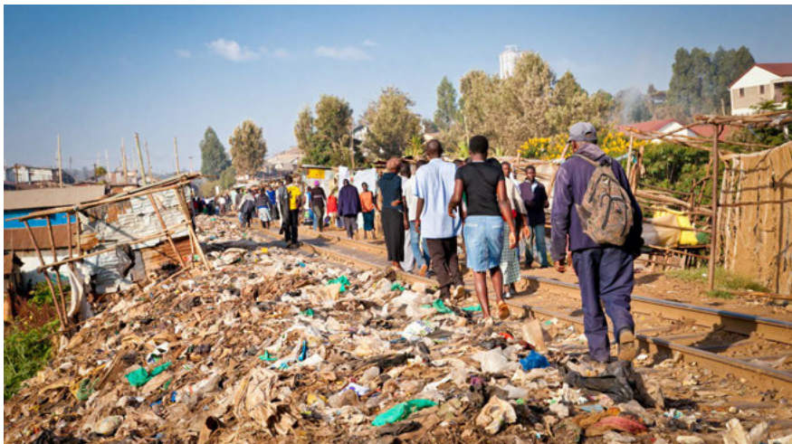
Life of local people Kibera slums in Nairobi, Kenya, the largest slum in Africa with about 270 thousand people, on February 6, 2014.