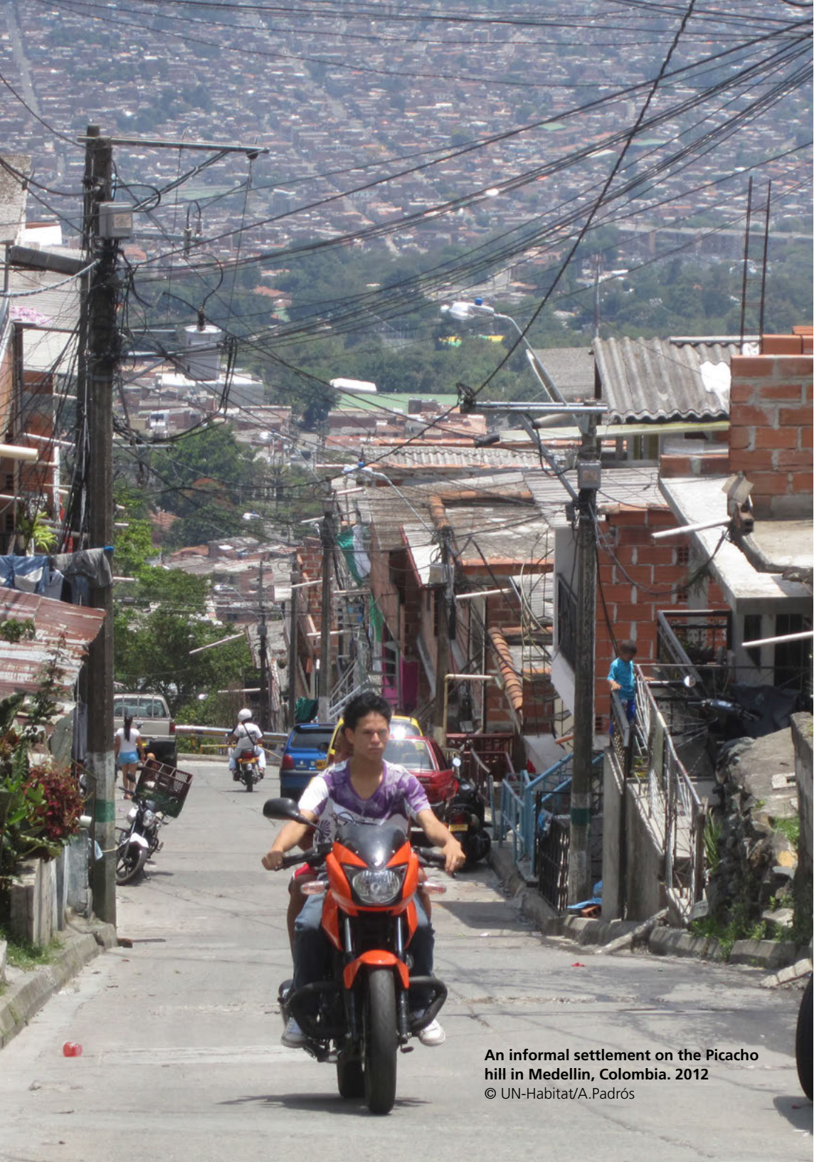
An informal settlement on the Picacho hill in Medellín, Colombia. 2012