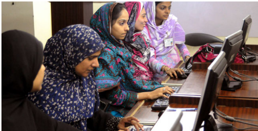
Young women learn computer skills. Hyderabad, Pakistan.