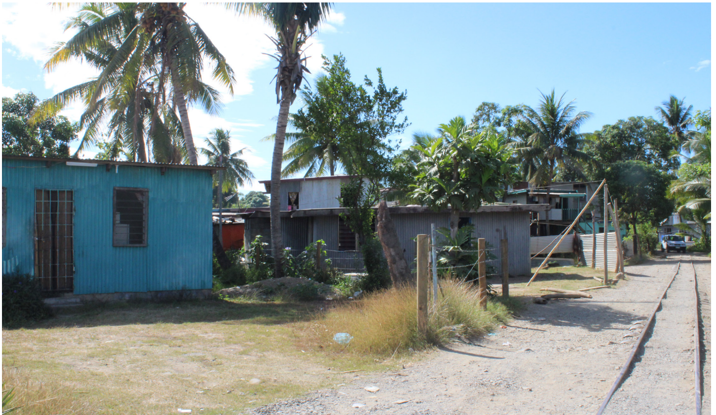
A Squatter Settlement in Nadi