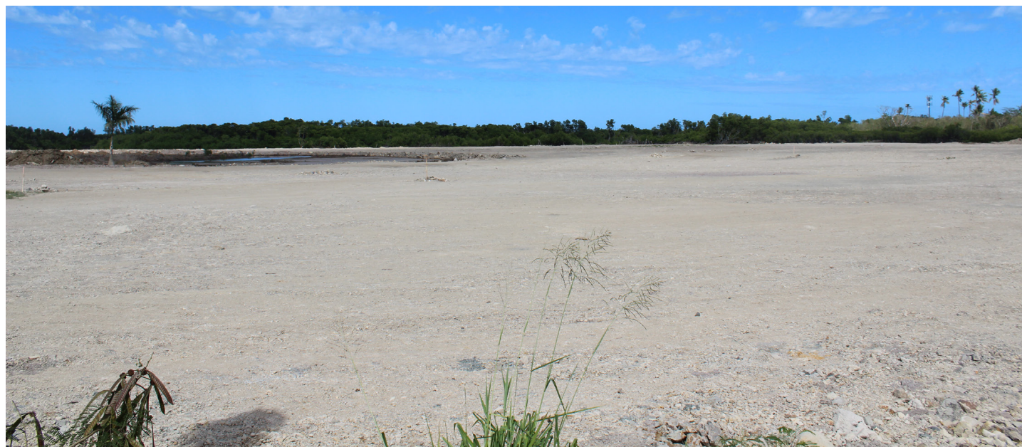
Landfilling After Mangrove Destruction in Nadi

For further elaboration of these provisions, the Fiji government adopted the Environment Management (EIA Process) Regulations, 2007. The Regulations elaborated provisions for screening, EIA processing, and the EIA Study and Report. A very important provision of the guidelines is the clarification regarding development projects by government ministries and entities. According to these regulations, if a government ministry or other government entity proposes a development activity or undertaking for which it would otherwise be the approving authority, it must apply to the EIA Administrator wherein the EIA Administrator performs the role of the approving authority. However, the power of screening is conferred upon the environmental management unit of the proposing government entity, 68 which may create some problems. The Department of Environment also published the