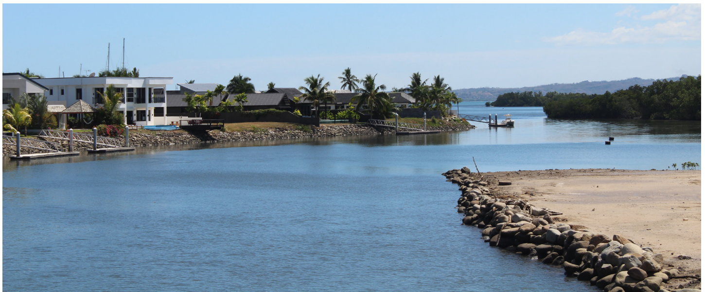
Denarau Island Development