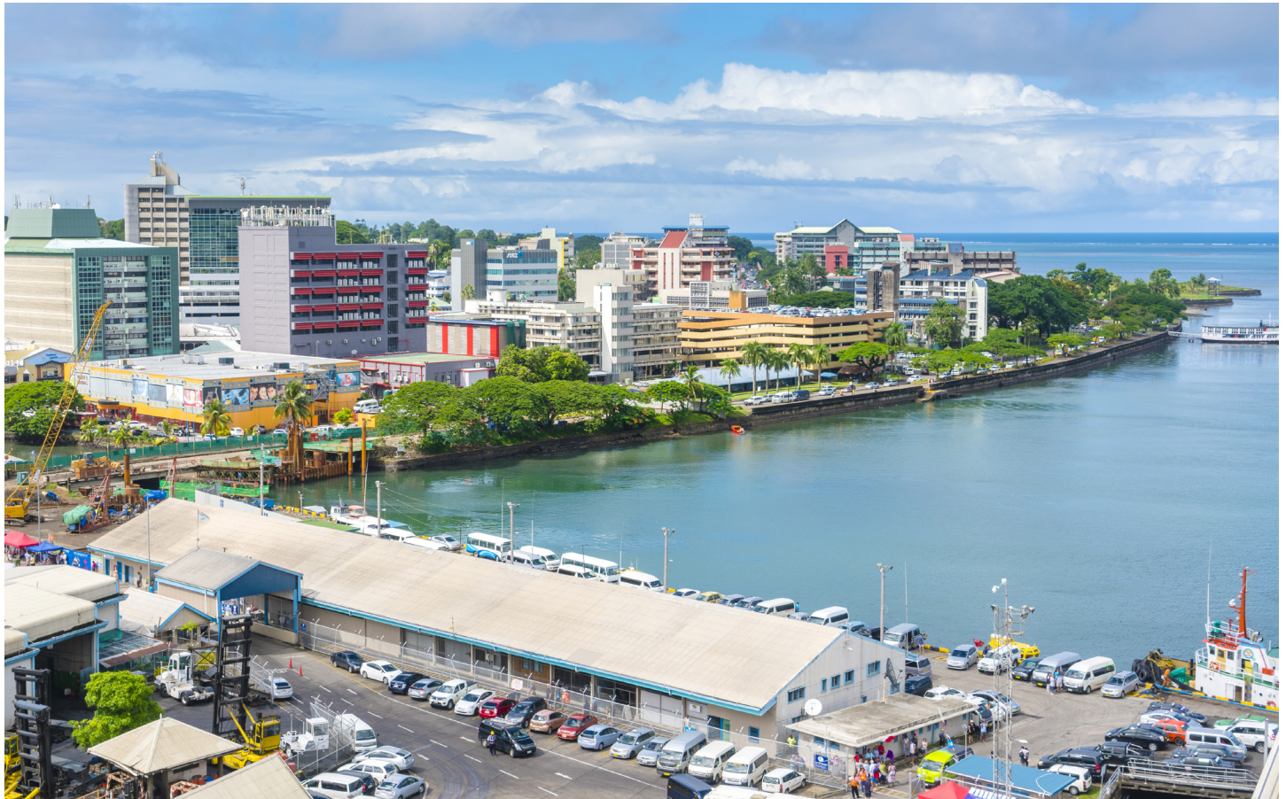
View of the city centre of Suva, the capital city of Fiji

The South Pacific Islands Country of Fiji is facing rapid urbanisation. The urban areas of Fiji currently host 50.7% of the 865,611 people of the country (2014 estimate). 1 More than 60% of Fiji's population will live in urban areas by 2030. 2 The growth rate of the urban population is significantly greater than the rural population growth rate in Fiji. 3