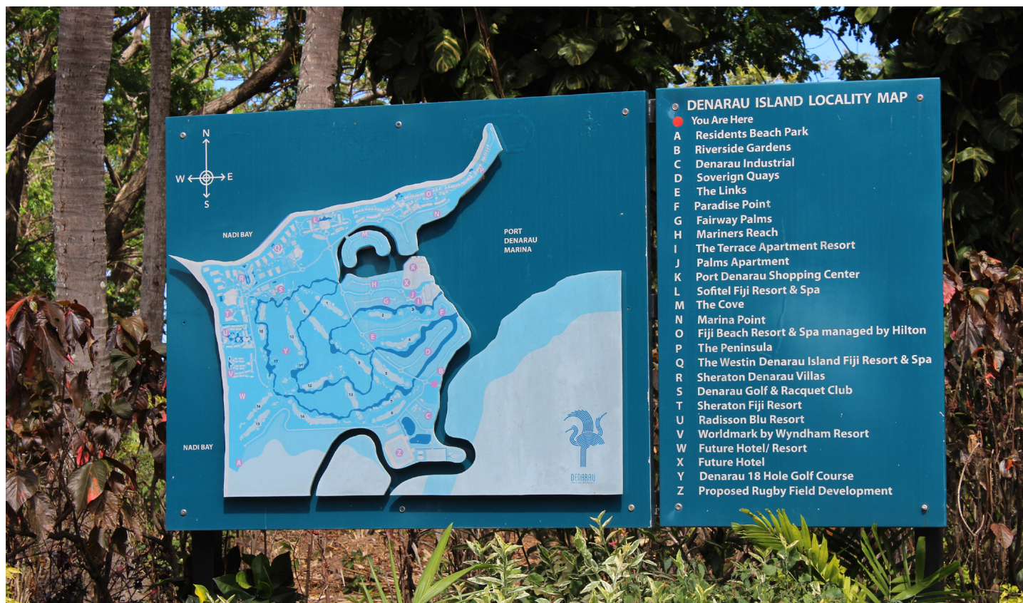
Denarau Island Development

impact of climate change on tourism may be highly relevant for environmental review of tourism related developments in urban and peri-urban areas. The Climate Change Policy further states that the tourism sector may face some challenges due to climate change including buildings and infrastructural damage; disruption in transport network; a decrease in the number of tourist arrivals; adverse changes in natural attractions; increase of costs for adaptations; and a decrease of touristic capital investments due to climate impact. 51