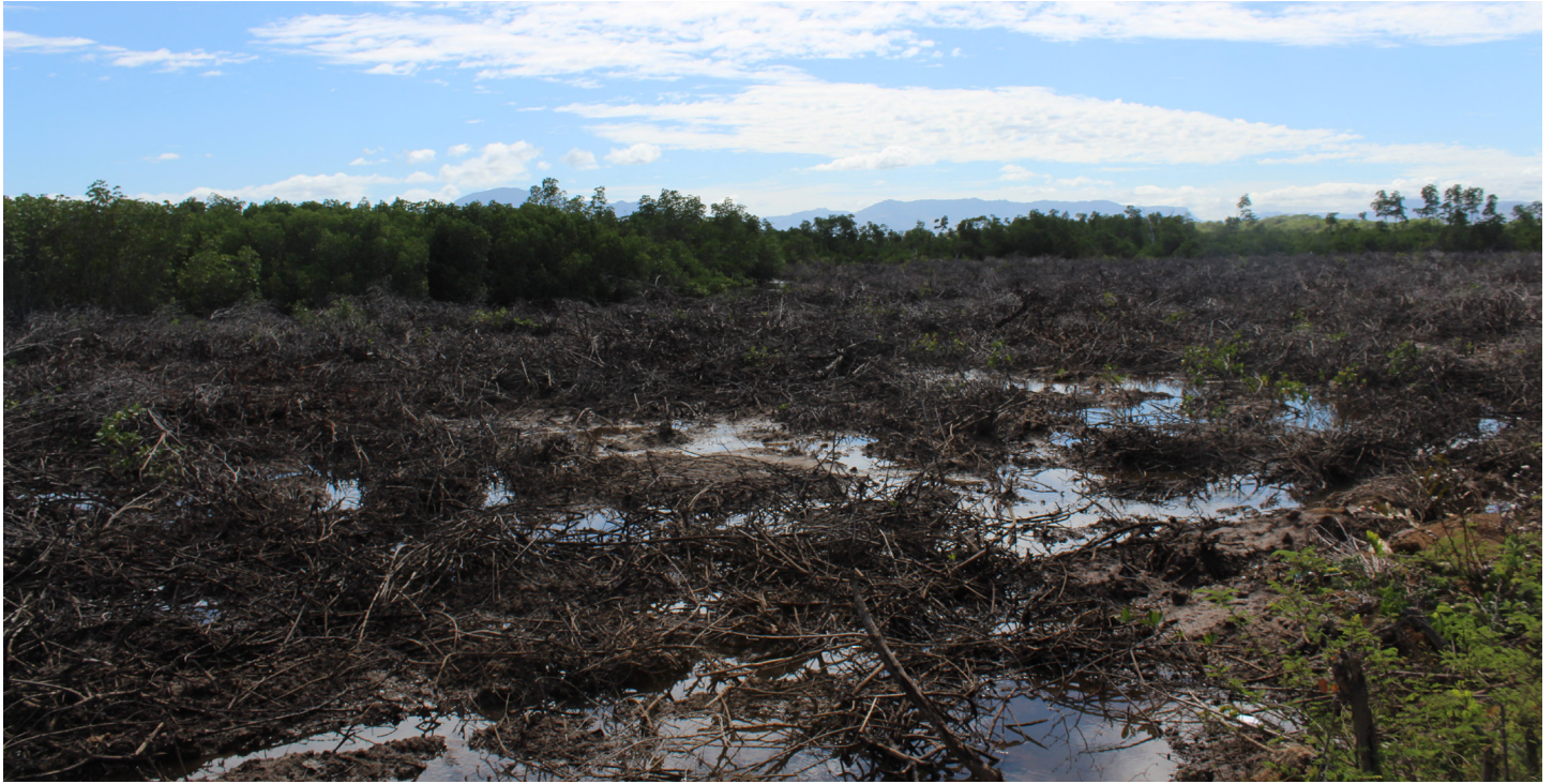
Mangrove Destruction in Nadi

protested the mangrove destruction. Today the Vanua [land] of Nadi is facing numerous floods that are partly linked to the clearing of mangroves in Denarau Island and Denarau Island's beach front sand erosion... In terms of livelihood, we have lost forever our mangrove food source, while we gained some source of employment for our villagers. At that time no proper economic analysis on the opportunity cost foregone for clearing the mangroves for the golf course was undertaken... 44