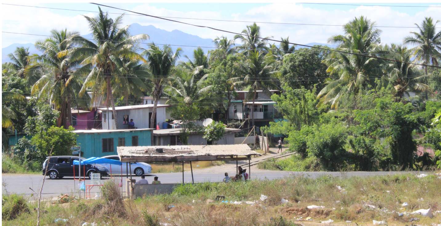
A Squatter Settlement in Nadi

surrounding peri-urban areas) the town is experiencing a population growth of 2.5% per year. 33 Economic activities of Nadi rely mainly on three interconnected sectors: tourism, transport and real estate. 34 Growth in the tourism sector has changed the land use pattern of Nadi and surrounding area from predominately residential to tourism related development. However, the effectiveness of environmental review of tourism related development projects is questionable. This will be elaborated here with an example from the Denarau island development.