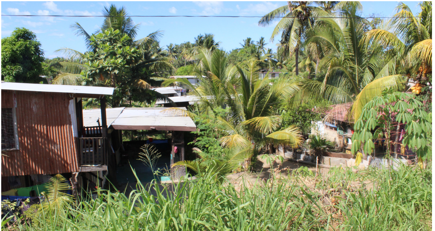
A Squatter Settlement in Nadi