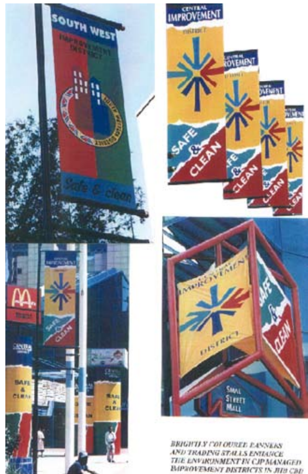
BRIGHTLY COLOURED BANNERS AND TRADING STALLS ENLIVEN THE ENVIRONMENT IN CJP MANAGED IMPROVEMENT DISTRICTS IN JOB CBD

One of urban renewal goals for Johannesburg is to have Improvement Districts manage the entire inner city. This will prevent the marginalisation of certain areas and allow the entire Central Business District to be a well-managed place.