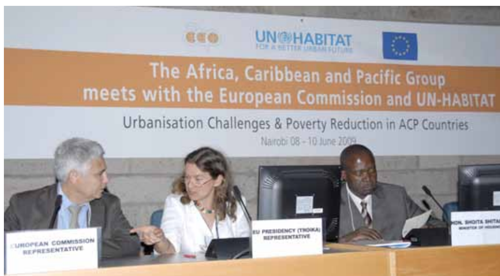
Co-chairs at the first joint conference on the Africa, Caribbean and the Pacific Group of Countries (ACP I) Opening Ceremony, held in collaboration with the European Union and UN-Habitat, 2009

Fundraising: The Brussels office has played a critical catalytic role in fundraising. In 2008, the European Commission (EC) contributed USD 7 million in funds to support projects in African, Caribbean and Pacific Group of States, capitalizing on the interest the European Union had shown in UN-Habitat's Regional Urban and Strategic Profiles. In 2010, the European Commission further approved about USD 14 million for the second phase of project implementation in the African, Caribbean and Pacific countries. As of December 2011, pipeline projects and programmes worth EUR 77 million (more than USD100 million) were being negotiated with the European Commission targeting projects on low carbon initiatives, water and sanitation, development of urban energy corridors in Africa, and development of a social, economic, geographical information system for African Cities.