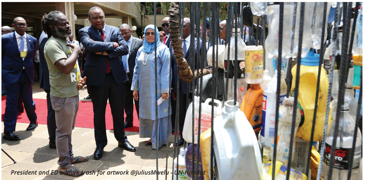
President and ED admire trash for artwork