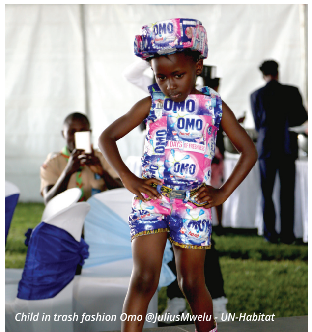
Child in trash fashion Omo

There was excellent media coverage with the Executive Director taking part in a live breakfast show on Kenya's NTV channel, two pull out spreads in Kenyan The Nation and The Standard newspapers, a press conference, a large group of Chinese media who interviewed the Executive Director, a spot on Kenya's Citizen television and a feature on solid waste in Congo by Al-Jazeera featuring UN-Habitat.