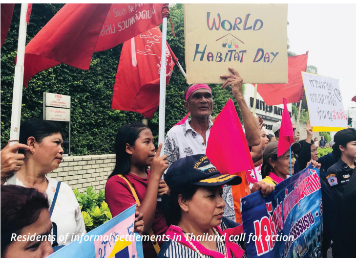
Residents of informal settlements in Thailand call for action

In Brazil, the UN-Habitat office launched a national initiative called the “Urban Circuit” (Circuito Urbano in Portuguese) to call for urban events. Over half of the proposals submitted were selected by UN-Habitat to receive support and events took place in 29 cities.