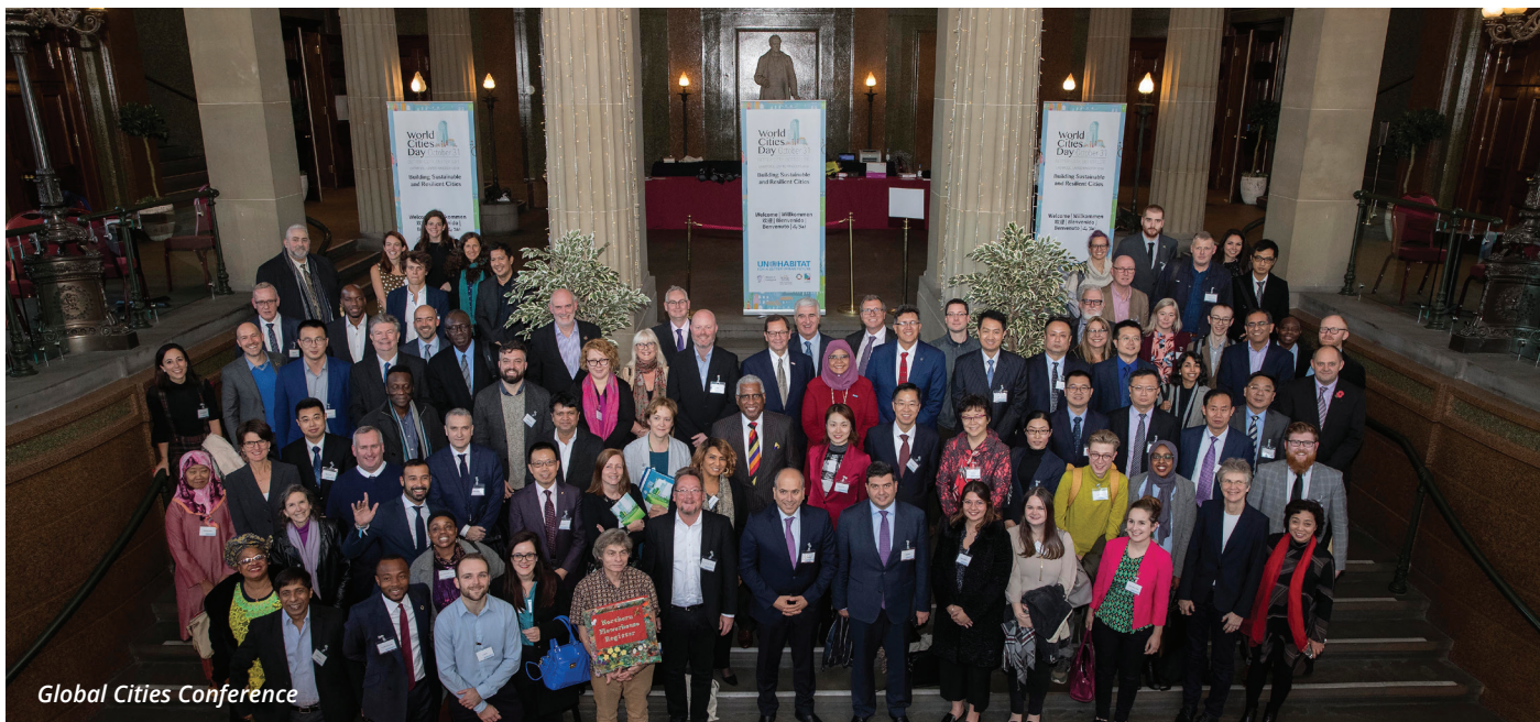
Global Cities Conference