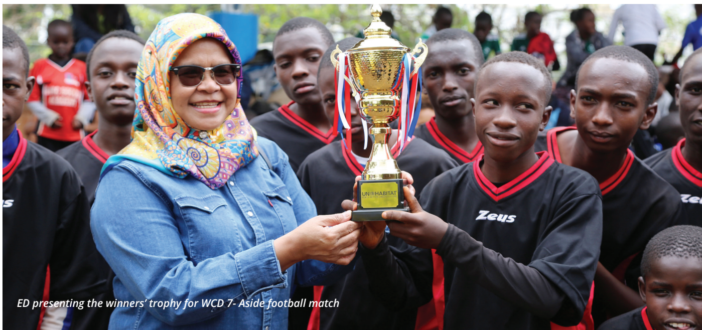
ED presenting the winners' trophy for WCD 7- Aside football match