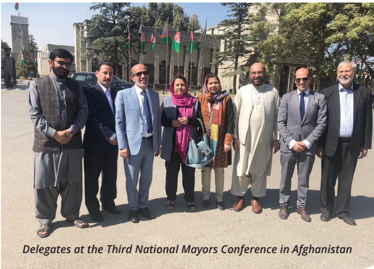
Delegates at the Third National Mayors Conference in Afghanistan

In Asia more than 40 events were held in 15 countries. In Afghanistan, the Third National Mayors’ Conference discussed the country’s rapid urbanization process while in India, UN-Habitat, the Ministry of Housing and Urban Affairs and partners organized activities, including an Urban Café on ‘River and Habitat’, about urban rivers and water bodies in urban areas.