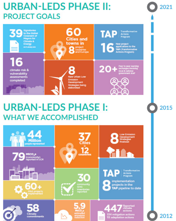
Figure 1: Urban-LEDS: Phase I Accomplishments and Phase II Goals

This mid-term evaluation (MTE) of the Project serves both accountability and learning objectives, intending to: (i) provide evidence on whether the project is on track towards achieving its intended results and objectives; and (ii) enhance learning, identify constraints and challenges which may need corrective measures and improvement.