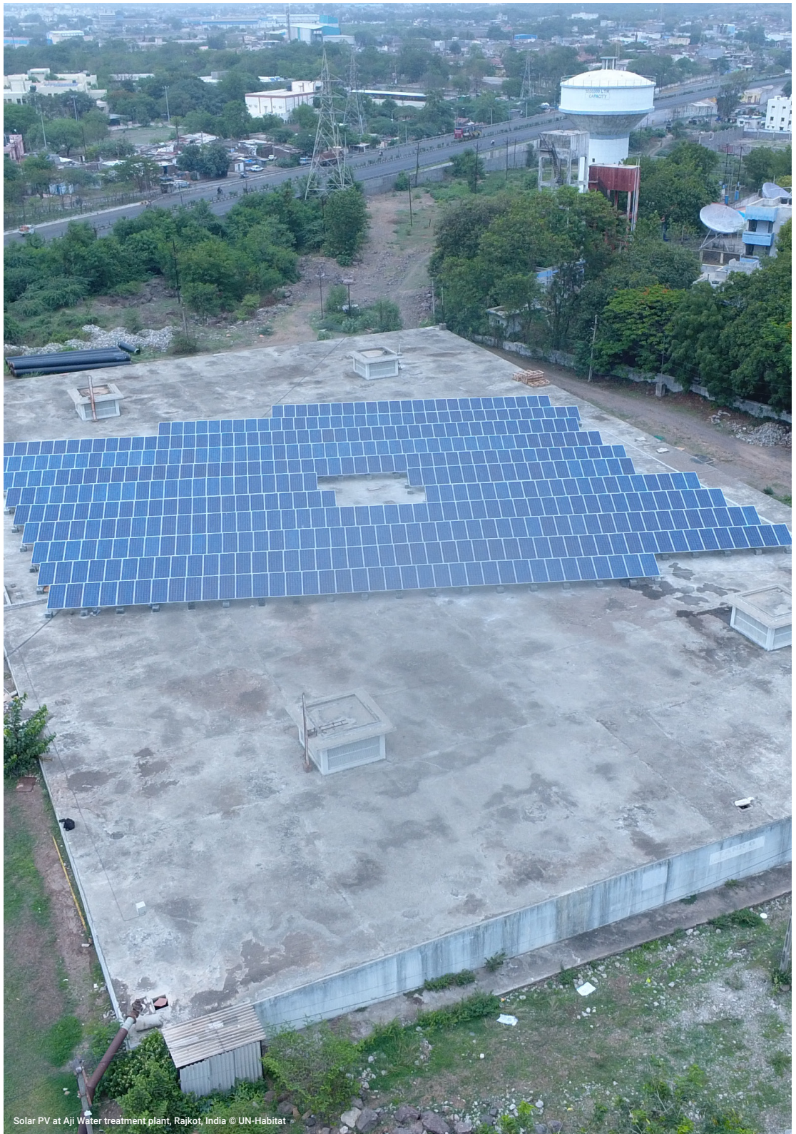
Solar PV at Aji Water treatment plant, Rajkot, India