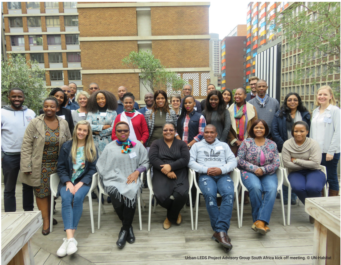
Urban-LEDS Project Advisory Group South Africa kick off meeting.

The relevant design features mentioned included: