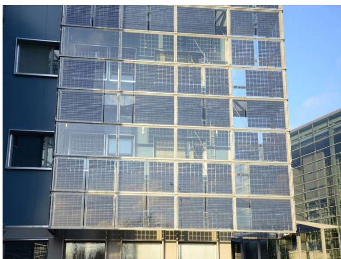
Solar panels on the Viikki Environment House in Helsinki, Finland