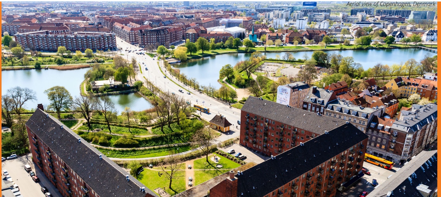
Aerial view of Copenhagen, Denmark