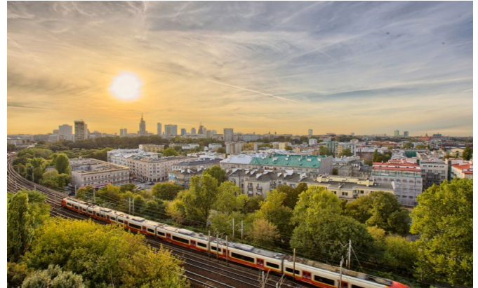
Warsaw, Poland

Last year, Warsaw joined the UNEP-led District Energy in Cities initiative and SE4ALL Building Efficiency Accelerator , with ICLEI a founding partner of both these initiatives – our role is to support local governments in scaling up their local climate and energy action.