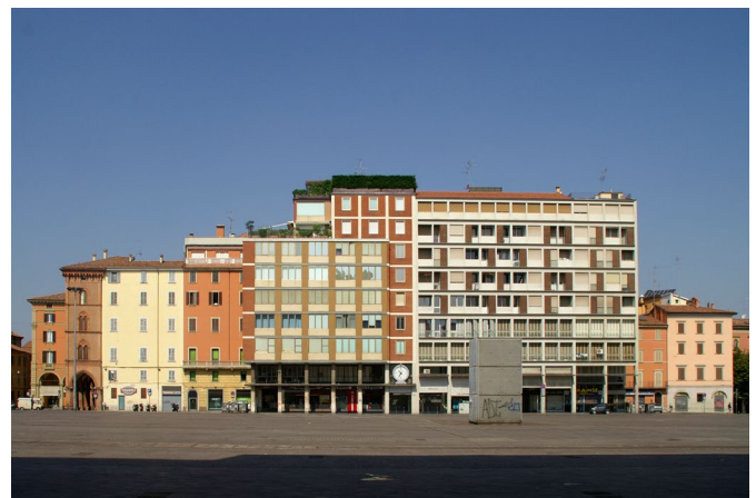
Otto Agosto Square in Bologna, © krss.

The delegates studied Bologna’s Sustainable Energy Action Plan (SEAP) and 2007 Energy Plan, gaining a comprehensive insight into the city’s energy strategies and how these are integrated. Further, the delegates explored how the city has managed public-private partnerships (PPPs) and how innovative technology can improve energy efficiency. This is done for example by stimulating the green economy