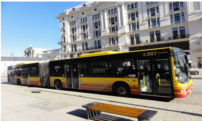
Low emission public bus in Warsaw, Poland

The city’s green growth vision includes sustainable transport development as a key component. Warsaw’s extensive bus fleet includes 18 buses operating on liquefied natural gas, 10 new electric buses, and a further 15 are fitted with photovoltaic panels – a combined innovative approach clearly exploring different options. The carbon-neutral electric buses were found to be just as durable as diesel buses while being more fuel efficient and less noisy, representing a preferable option for replication in the two delegates’ home cities. An additional interesting consideration is the reduction of air pollution from transport, which is much needed in densely populated cities.