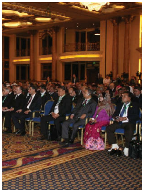
ABOVE: The 4 th session of Asia Pacific Ministerial Conference on Housing and Urban Development (APMCHUD) in Amman, Jordan.

The main challenges faced by the Member States are how to strengthen the Secretariat with adequate human resources and funding so that it can implement the adopted plan through various projects in member countries. Secondly, the challenge of mobilizing and motivating the strategic countries of this region for their commitment and participation in the APMCHUD Biennial General Meeting, and in the Meeting of the Bureau at the Minister's and higher official levels.