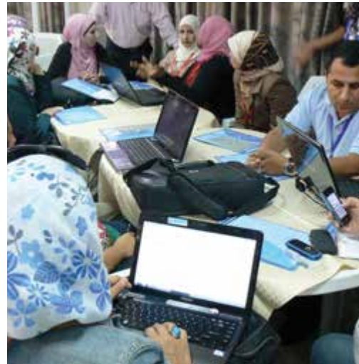
ABOVE: Youth Tech Festival 2011, Amman, Jordan: Building Youth Capacity to Drive Social Change

This global phenomenon is a marked characteristic of what is now known as the “Asian Century”, clearly both the asset and challenges of such a rapid transition need to be addressed in the Asia-Pacific Region. In addition to population dynamics, is the fast growth of Information- and Communication Technology in the region, and the theme of this 4 th APMCHUD conference connects the two phenomena namely, “Youth” and “ICT”. It examines systematically the challenges and repercussions on youth employment in the process of sustainable urban development