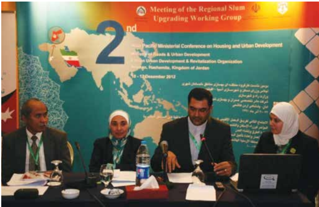
ABOVE: The 4 th session of Asia Pacific Ministerial Conference on Housing and Urban Development (APMCHUD) in Amman, Jordan.

vironment is a central element in sustainable urban development. Youth have demonstrated a huge promise and readiness in addressing environmental concerns through leadership of environmental projects in the areas of safe water, renewable energy and sustainable consumption and through contributing to and influencing the inclusion of sustainable development in policies and programs. Information is critical for development and tangible support should be provided for the youth initiatives around the world including technology tools, training, financial resources, and the creation of networks to allow sharing of knowledge and experiences that enhance influence and impact. Young people are an important resource in urban service delivery.