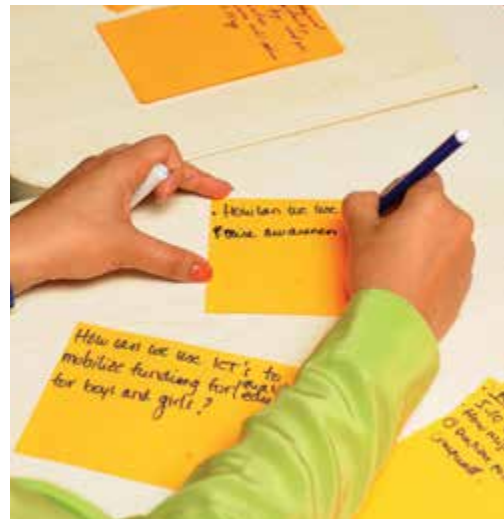
ABOVE: Millennials Jam Workshop, Youth and ICTs beyond 2015 where approximately 25,000 young people will input their ideas for the post-2015 global development agenda.

The working group areas of APMCHUD are broad, going beyond the Youth and IT nexus, as a hook linking the theme of APMCHUD to previous themes which cover all aspects of sustainable urban development. The conference will not only serve as benchmark for members states to consolidate their national plans but will also inform the Asia ministers at subsequent UN-Habitat and related milestones such as the 24 th Governing Council of UN-Habitat in April 2013, post 2015 Development Agenda/ Sustainable Development Goals, World Urban Forum VII in 2014 and the Habitat III conference in 2016.