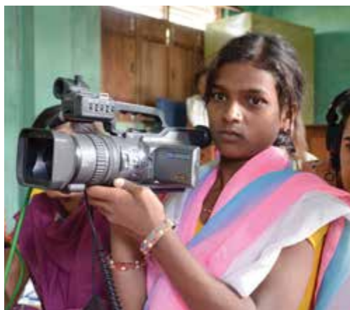
ABOVE: Participatory video project in Dhanusha District, south Nepal.

This 14-year-old girl has struck a chord with the citizens of the world by highlighting the issue of girls' education. Her actions show two facets of the demographic and socio-economic change that is currently taking place in the world. A young teenager was able to take up a global campaign on behalf of her peers who were denied the right to education by using the web to reach out to people far beyond her country. Like Malala, thousands of young unsung heroes are taking up the challenge of changing their worlds and are addressing some of society's most persistent problems such as lack of education, health care and employment opportunities.