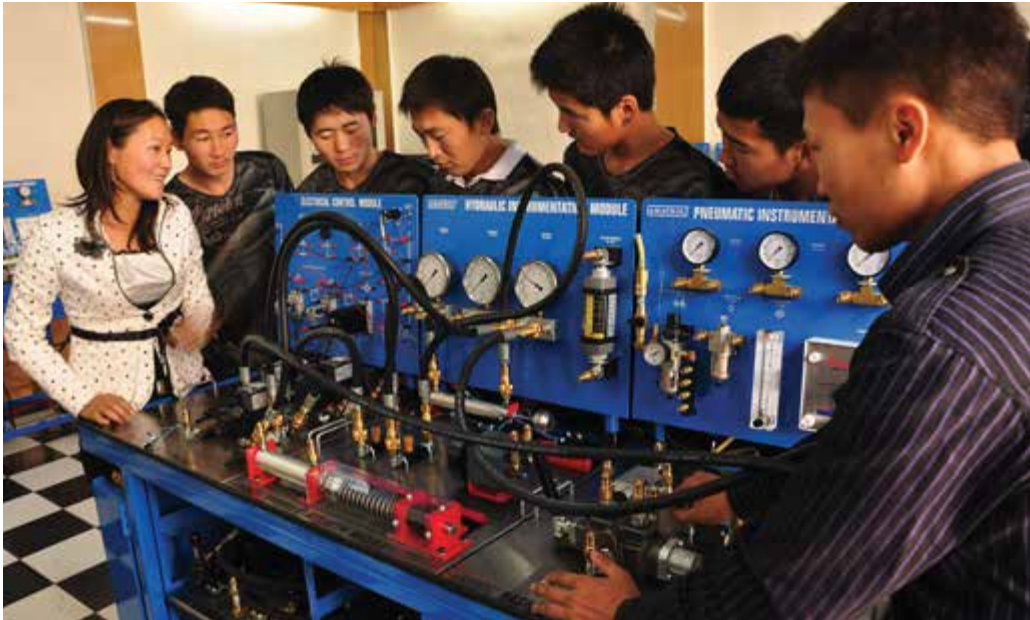
ABOVE: Vocational training students, southern Mongolia. ADB's education strategy in Mongolia includes supporting the government's attempts to align the skills and education of the labor force with market demand.

Web-based delivery of educational content is supplemented by numerous online tools that empower Academies to manage all aspects of the program. In addition to the networking curriculum, it provides online testing.