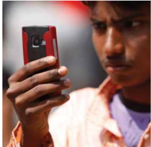
ABOVE: A young man takes a photo with his mobile phone in Dhaka, Bangladesh.

HarassMap addresses a problem increasingly seen in many countries. Through its surveys it has found that 83 per cent of Egyptian women reported being harassed and half of those on a daily basis. Harassment occurs at all levels and young people suffer it in silence and accept blame as victims or risk the severe social consequences of speaking out. The project makes reporting possible, prompt, secure and safe through mobile phone communication and social networks. It also trains youth to take on the responsibility of being resource persons in times of crisis.