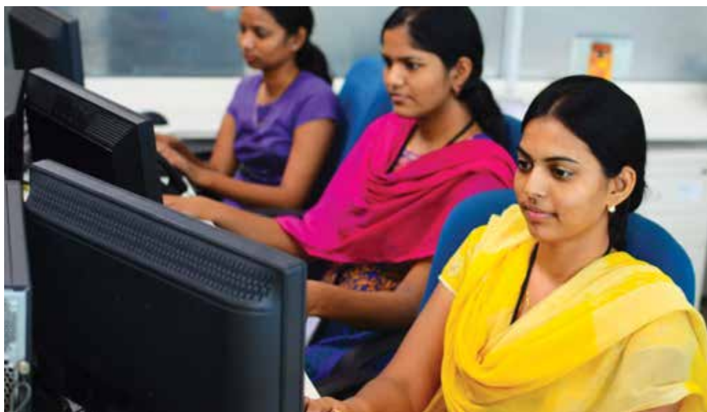
ABOVE: U.S. envoy: ICT industry in India 'more women-friendly' than other sectors.