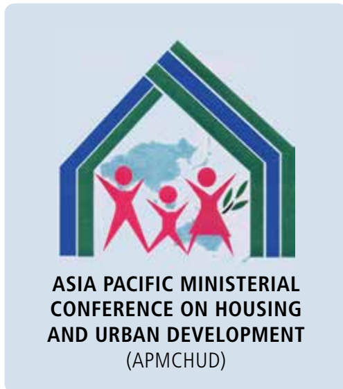
ABOVE: Asia Pacific Ministerial Conference on Housing and Urban Development (APMCHUD) logo.

The Asia-Pacific region has more than half of its population composed of young people. The region is experiencing quite a number of positive developments but equally in the same measure registers quite a number of challenges