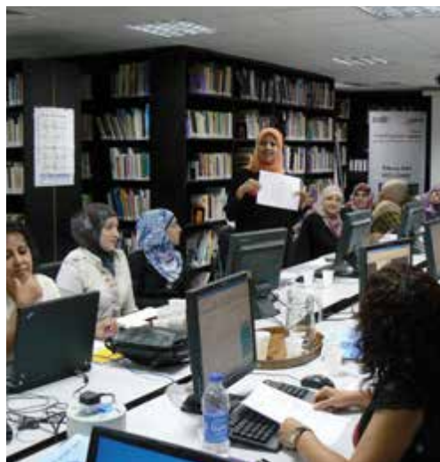
ABOVE: Youth Tech Festival 2011, Amman, Jordan: Building Youth Capacity to Drive Social Change.

In addition, many Asian countries have not managed to narrow the gap in wealth between them and developed countries while achieving similar standards of living.