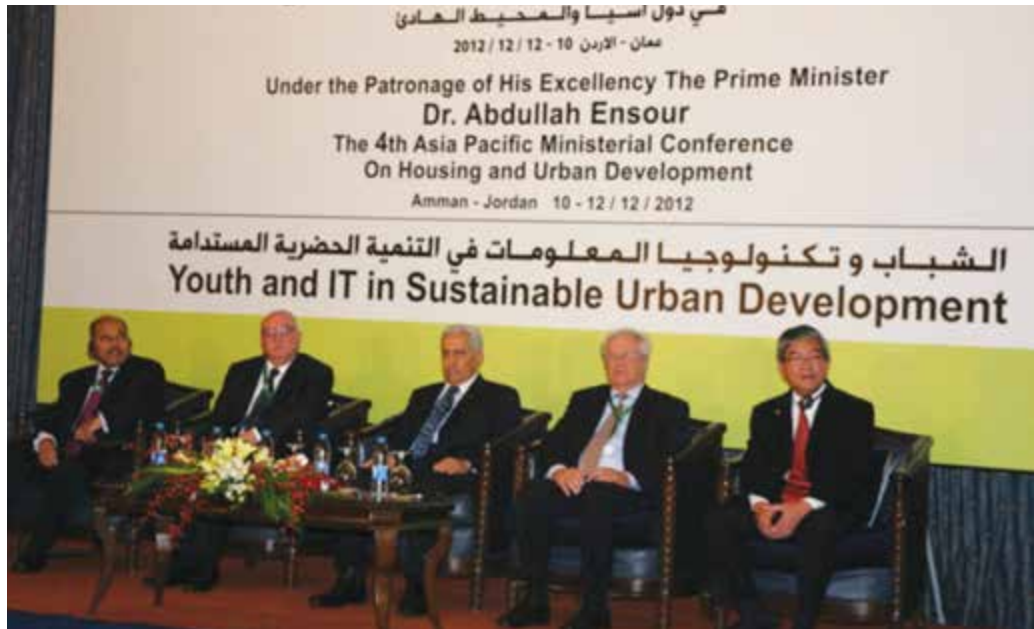
ABOVE: The 4 th session of Asia Pacific Ministerial Conference on Housing and Urban Development (APMCHUD) in Amman, Jordan.

Sub-theme 5: Youth as City Changers for prosperous cities