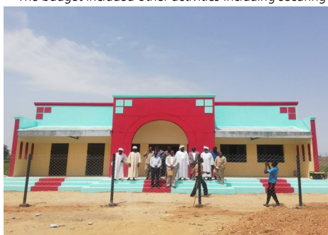
Sirba (Jabal) rural court

*The budget included other activities including securing land rights for IDPs and hosting communities.