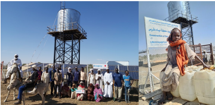
The water service constructed in Dagarese, South Darfur (2019)

In total 59 villages in five Darfur States.