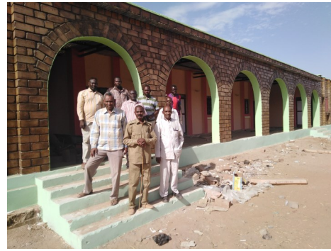
The new administrative building in Shangili Tobay using stabilised soil block (SSB)

During the long-lasting conflict in Darfur, 77% of health facilities were destroyed or damaged (67% needed rehabilitation and 10% needed full construction)*. Other source shows that around one-third of all the settlements were destroyed or damaged. Due to the limited access to public and health services, the quality of life of the people were severely influenced.