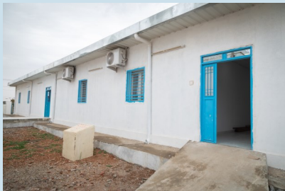
Alwohda Hospital Complex (Nyala, South Darfur)