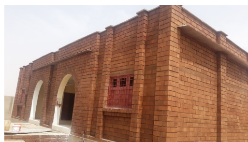
Yasin attorney office