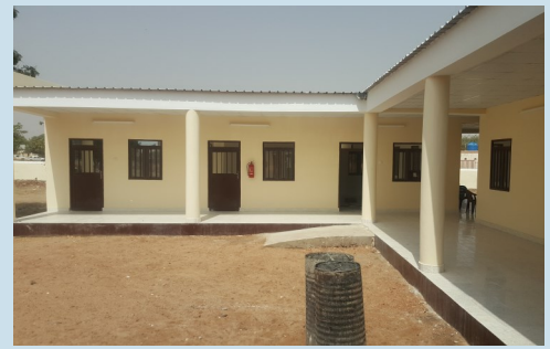
Rehabilitated Rural Hospital in Rihaid al-birdi (South Darfur)

Health service is essential particularly in post conflicts areas. Health services in Darfur are remarkably weak, fragmented, insufficient because of interlinked factors: insecurity, remoteness, poor infrastructure, severe understaffing, and lack of incentive policies. UN-Habitat constructed or rehabilitated the health facilities in remote areas and return sites where most of the facilities were destroyed or damaged. The infrastructure of the facilities were well designed and upgraded taking the hygienic and medical measures into consideration.