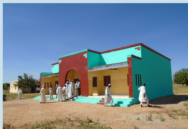
Gobi rural court in West Darfur

UN-Habitat constructed six rural courts in North, South, East and West Darfur States in 2019. Along with the construction of facilities, UN-Habitat provided trainings for 240 rural court judges to mediate land disputes in collaboration with The Judiciary Training Department. One of the trainees says, “I learned the vital role of justice in transformation of traditional community to civil community, and the importance of coordination between traditional authority and judges to resolves the land issues.” The project is continuing to the following phases in 2020.