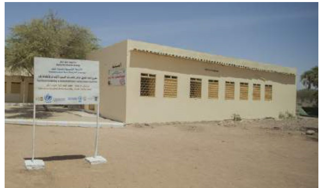
Rehabilitated rural hospital in Umlabasa, South Darfur State (2017)