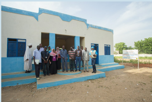
Police Office in Dimsu, South Darfur

People displaced by the conflict are now returning to Dimsu where the situation has become stable and secured over the last two years. UN-Habitat constructed Prosecutor Office, Education Office and Police Office to contribute to their easier returning. “The new constructed facilities are supporting community’s stability and improvement of the settlement,” the women’s group says.