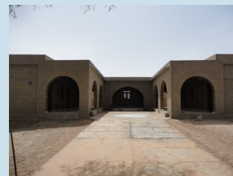
Kutum midwife school

Kutum is a town located 120 kilometres northwest of the capital of North Darfur State, El fasher. The Sudan Household Health Survey in 2010 showed that the maternal mortality ratio in North Darfur was 177.5 per 100,000, but in some areas, such as Kutum, it was significantly higher. It is not easy to access to the capital hospital for residents in Kutum. To fill the considerable needs, UN-Habitat constructed a midwife school with a lecture hall, laboratory, office rooms and stores.