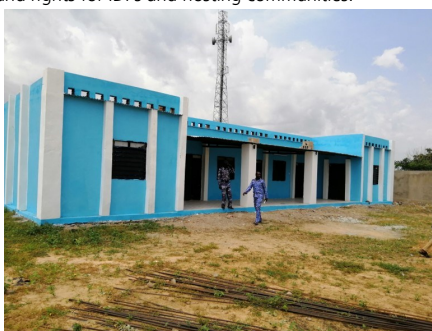
Yasin police office