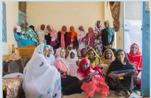
Consultation with the women’s group at a new facility

..... Project “Construction of Public Buildings/Facilities and Housing in Return Sites and Urban Settings” funded by the government of Qatar, 2016-2018