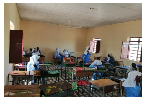
Ed Daein girls' secondary school