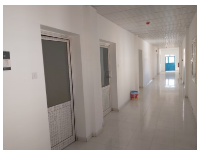
Alwohda hospital complex