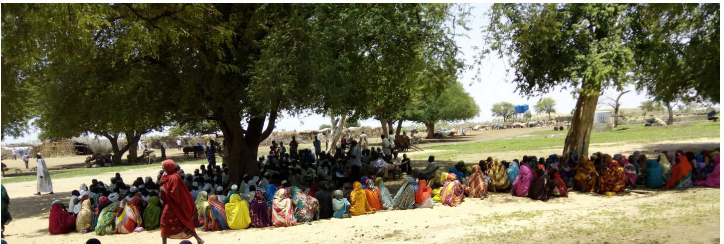
Community meeting for sketch mapping exercise

51 Village Mapped in the 5 states of Darfur