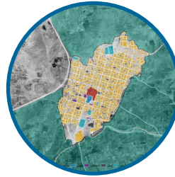
Digitize Map with Social Tenure Domain Model (STDM)