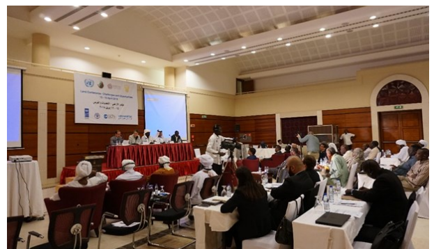
Land Conference in Sudan on 15-16 April 2018