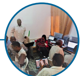
Training and Capacity Building