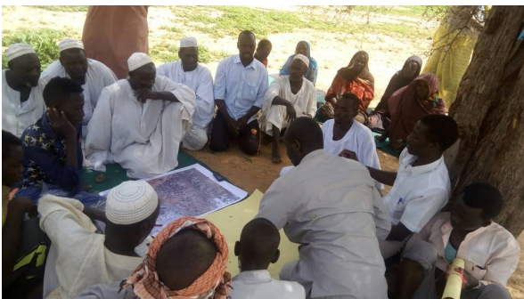
Community meeting for sketch mapping exercise