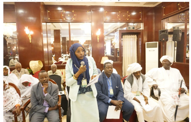
Participant in Darfur land conference 10-11 December 2018

UN-Habitat will continuously contribute to land management reform for peaceful co-existence in Sudan.