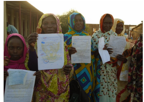
The IDPs holding the land title documents who were granted the plots by the government for free of charge