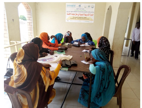
Training on socio economic activities for women

Strategic urban development /structure plans for the towns of Ad-Damazine and Al-Roseires illustrating IDP resettlement plots located next to the town center of Ad-Damazine Block 128.