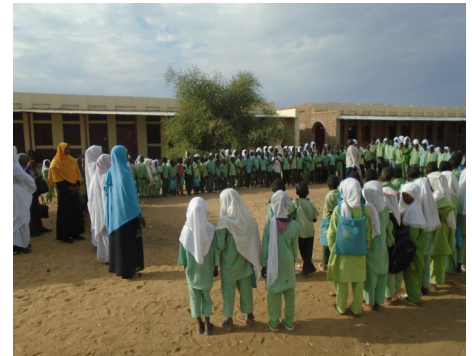
Building public facilities including schools