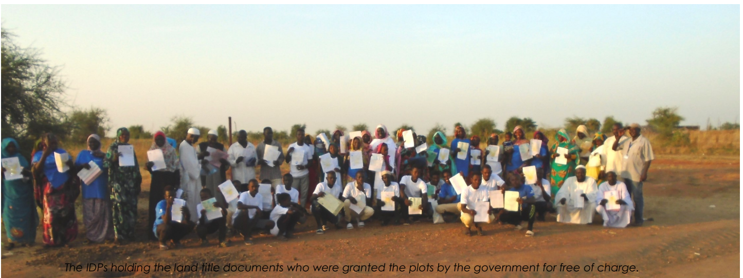
The IDPs holding the land title documents who were granted the plots by the government for free of charge.

UN-Habitat introduced the environmental friendly durable, cost effective Stabilized Soil Blocks (SSBs) technology for reconstruction of public facilities. Two SSB vocational training courses were provided within a package of vocational training that targeted 258 youth women and men. Machines for production of SSB were provided for the community to sustain the construction of housing and facilities using SSB.