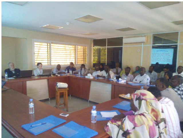
Training and capacity building of MPPPU staff on development of urban plans conducted by UN-Habitat, University of Khartoum, and German-Jordanian University.