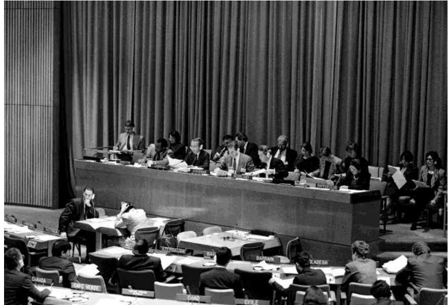
Image 6: Preparatory Committee for HABITAT II during a three –day organizational session on 5 March 1993

Support from friendly governments was essential to get resolutions adopted on gender issues, both as separate gender resolutions, or as components of other resolutions. Similarly, friendly governments provided, or pushed for, funding and other resources for gender work. Earmarked funding or “soft” ear marking of core funding, from friendly governments, were prerequisite for implementing gender focused programmes as well as conferences and meetings, and for the participation of women in more general meetings. Further, such governments applied pressure on UN-Habitat senior management on many issues concerning programming, resource allocation and internal policy support for gender mainstreaming.