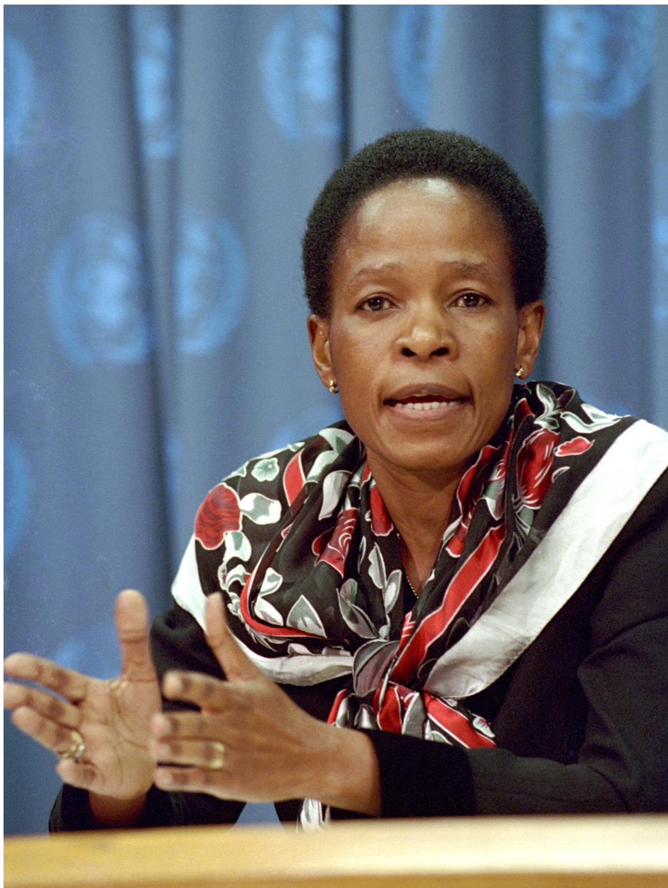
Image 10: Anna Tibaijuka, Executive Director of UN-Habitat, briefs correspondents ahead of a special General Assembly session on the implementation of the Habitat Agenda, 2001