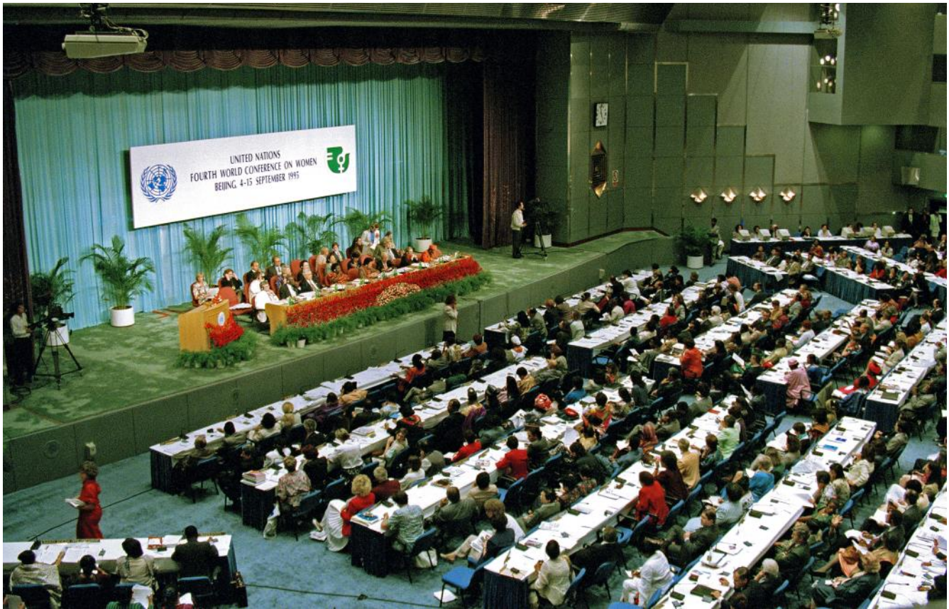
Image 7: Plenary, general view at the UN Fourth World Conference on Women in Beijing, China

The major event on women and gender in this time period was the Fourth World Conference on Women in Beijing, China, in 1995. The preparatory process saw massive mobilization of women's organizations worldwide, including those concerned with women and habitat. HIC Women and Shelter Network mobilized through its regional structures to identify issues of concern to grassroots women and bring them, and the women themselves, to meetings, including in China, so as to influence the outcome.