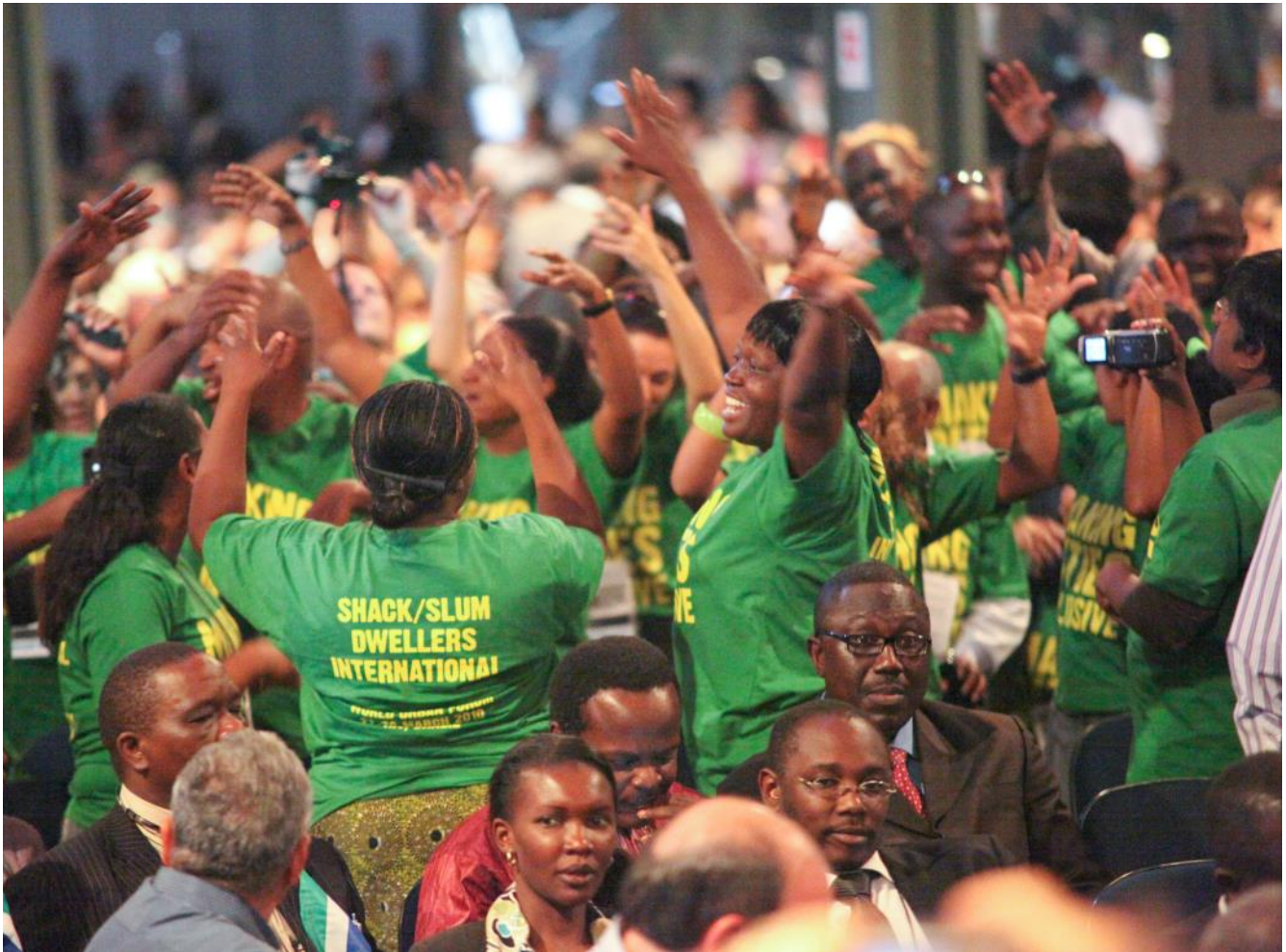
Image 11: Jubilant exhibitors at the World Urban Forum 5 (WUF5) closing ceremony, Brazil, 2010. Gender training was an integral part of WUF 5.