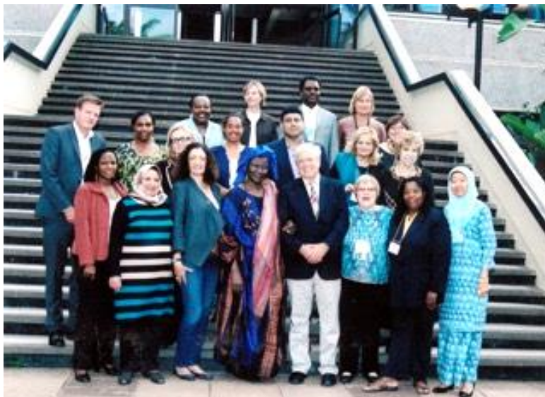
Image 1: Second meeting of the UN-Habitat Advisory Group on Gender Issues (AGGI), Nairobi UN Gigiri . 30 November - 1 December 2012

The concluding section seeks to highlight some observations and lessons learned from the entire period – 1985-2012 – and to understand the strategies and organizing that took place to engender the work of UN-Habitat.