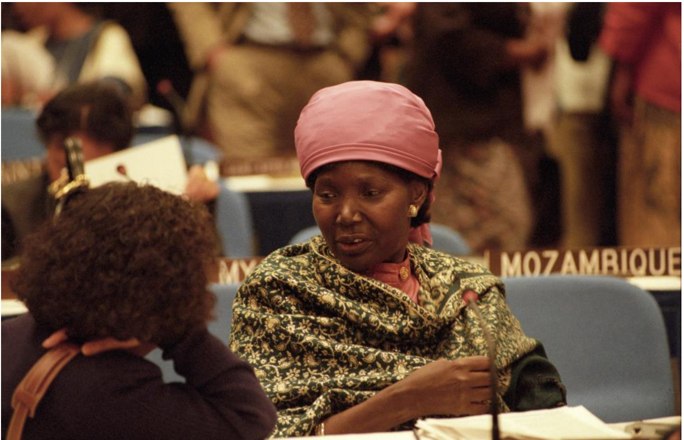
Image 8: Women attending the UN Fourth World Conference on Women in Beijing, China

Secure Tenure. Women’s rights to land and property in Islamic countries became a special focus and area of support by UN-Habitat, taking advantage of its partnership with HIC’s Centre on Land Rights and Evictions based in Cairo, which also took up the cause of women’s property rights following the Beijing and Habitat II advances in international agreements.