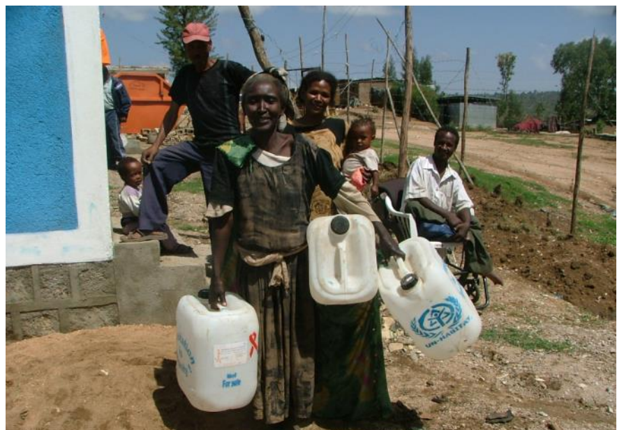
Image 12: Clean water, a challenge for women in Harar town, Ethiopia. Water and sanitation has been a key part of UN-Habitat's work

The projects in question are at different stages of implementation, with different levels of the participation of the GMU (direct versus indirect) and have various degrees of success vis a vis gender mainstreaming. However, all show