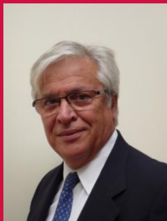
Dr. Joan Clos UN-Habitat's Executive Director

We are in a crucial moment for urbanization. Urbanization has become a global trend; an engine of development and a transformative force that can lead the world to overcome challenges related to sustainability, climate change, poverty, exclusion and gender inequality. Equality for women in an urban world is progress for all.