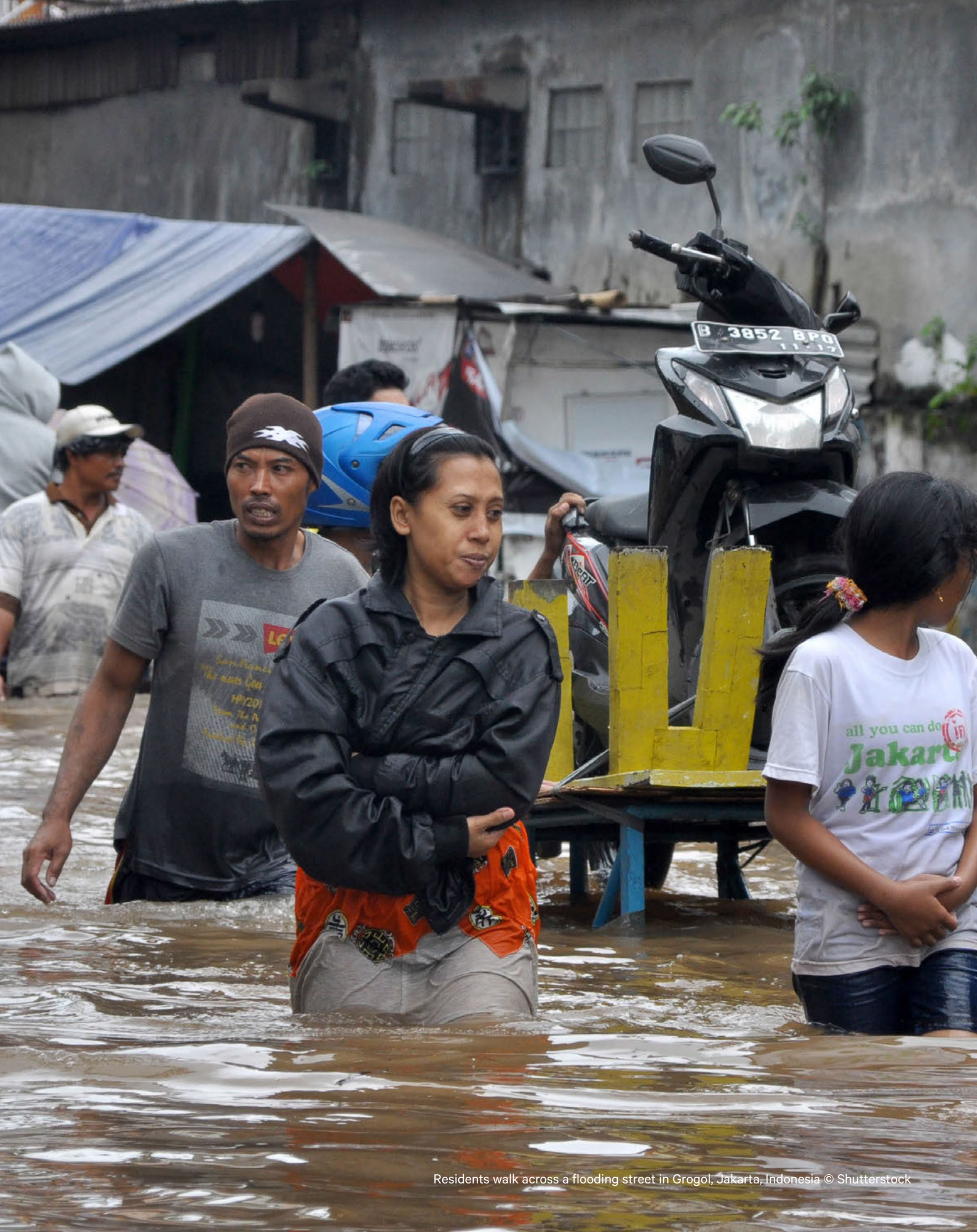
Residents walk across a flooding street in Grogol, Jakarta, Indonesia