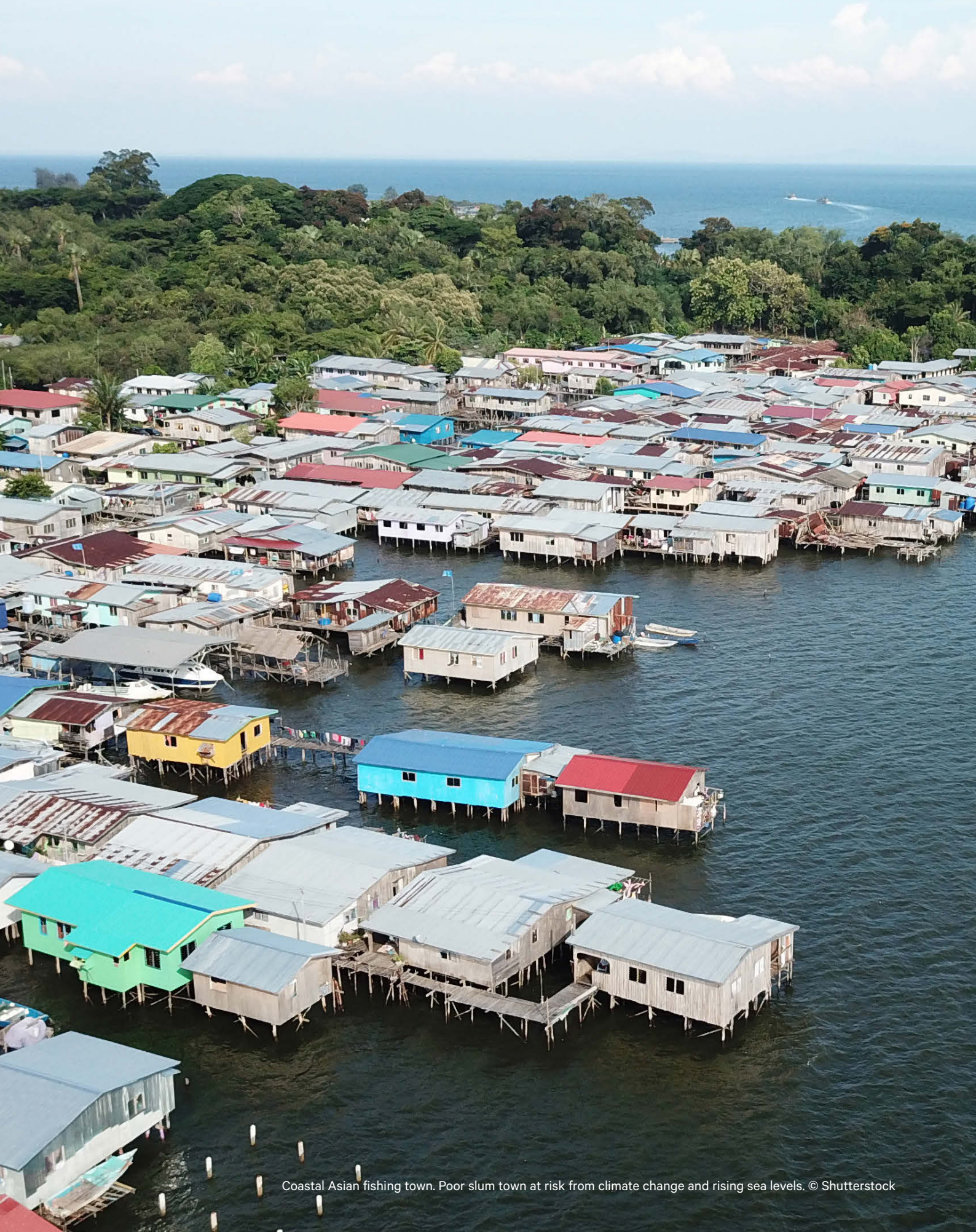
Coastal Asian fishing town. Poor slum town at risk from climate change and rising sea levels.