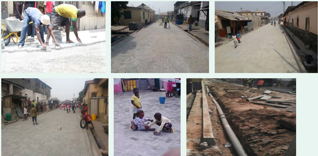
Figure X: Clockwise from top; Alley paving providing labor to local youth and results of alley block paving providing much needed public spaces. Sewer lines to improve sanitation were also rehabilitated (bottom right)

Over 14,400 square meters of alleys were paved with cement blocks that were manufactured in the locality thus providing employment to over 250 community youth in the execution of the projects. The paving has not only sanitized the environment, but has also consolidated the alleys as public spaces for various social and economic activities. In particular, the alley paving and increased lighting has provided safer environment for women and youth. The alley paving process provided an opportunity for the community to quantify the cost effectiveness and sustainability of using the blocks as an alternative to concrete slabs as a means of improving drainage and sanitation in low income neighbourhoods. It has been established that the blocks are 1.5 times cheaper and in addition are manufactured locally and offer better opportunities for employment of local youth. This is an opportunity to upscale the project in the rest of the city neighborhood with little accessibility to improve accessibility and drainage as part of a citywide slum upgrading programme.