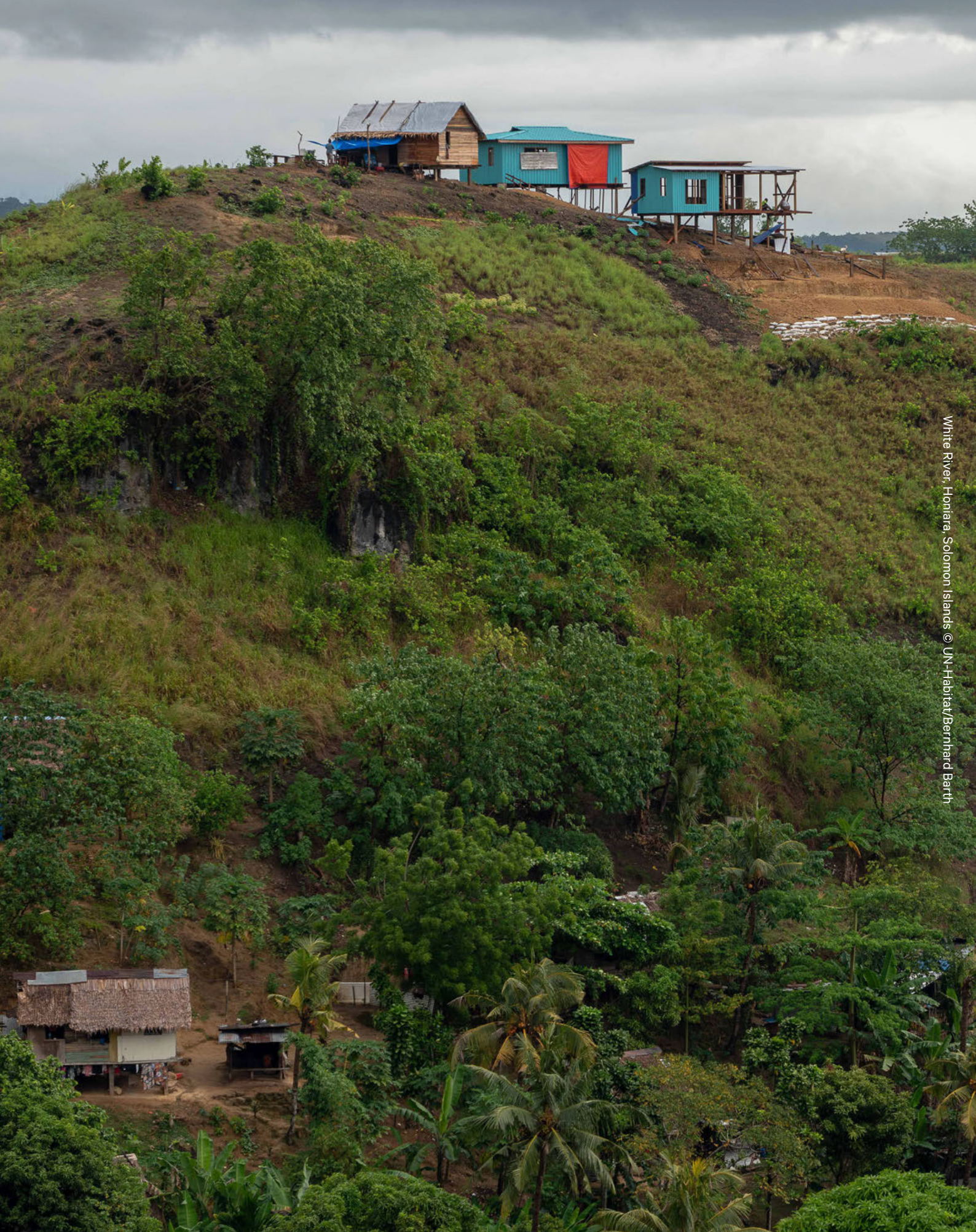
White River, Honiara, Solomon Islands