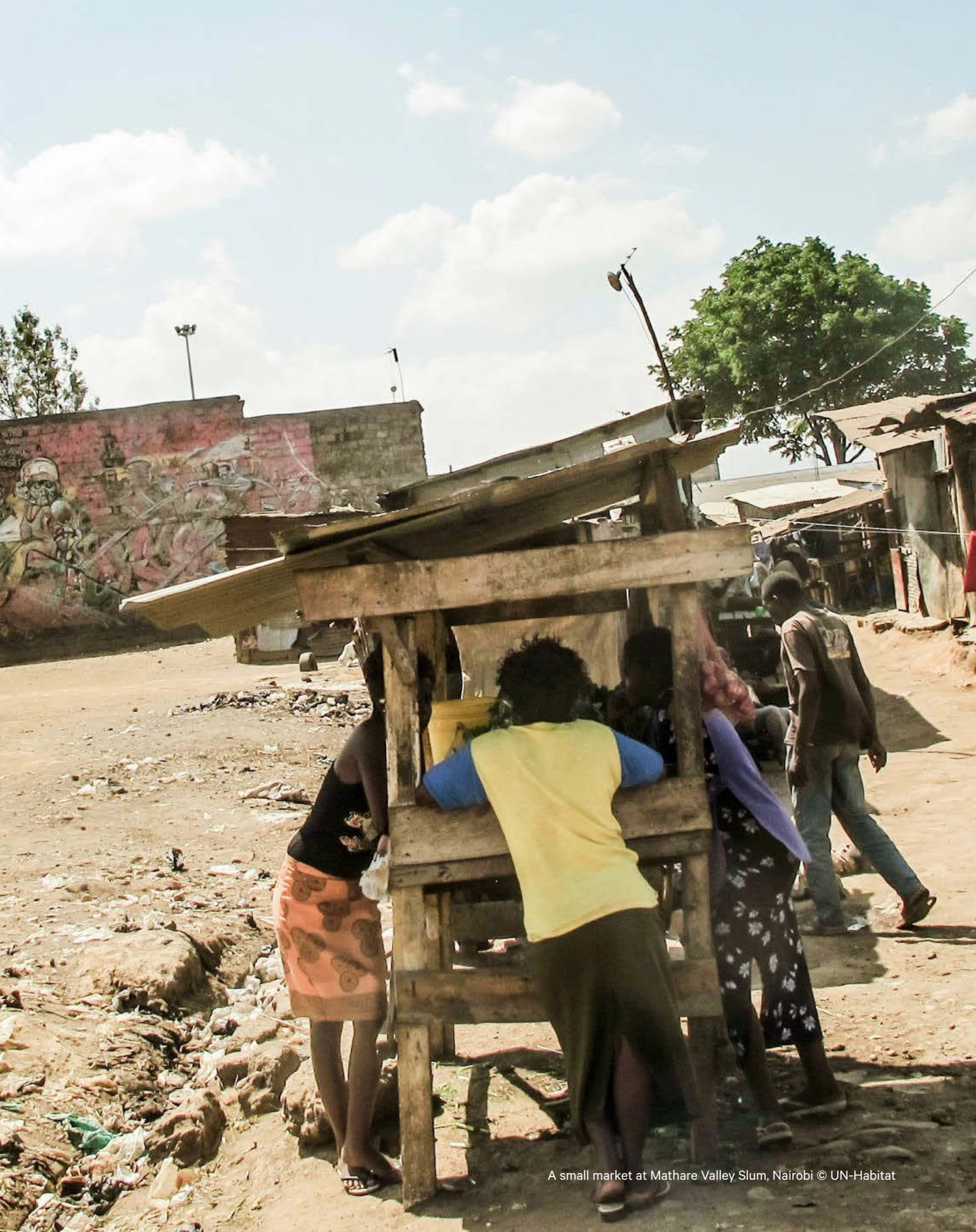
A small market at Mathare Valley Slum, Nairobi