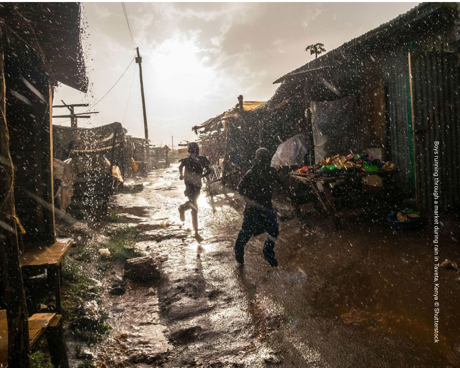
Boys running through a market during rain in Taveta, Kenya

Households in South Africa have been moving away from paraffin lamps or illegal electricity connections in favour of the cheaper and safer alternative provided by solar energy. In Ruimsiq community, 75 households have had solar home systems installed in their shacks, providing energy for lighting, radio, TV and cell phone charging, with support from the South African Federation. This initiative, once it reaches all households, will help eliminate the risk of fire in the settlement, ensure cleaner air inside the homes. Similar initiatives are taking place in Zambia, where unplanned settlements do not qualify for basic services from the government. Solar household systems help to eliminate energy poverty in a low-emissions manner while creating training and employment opportunities for local technicians to install and maintain the solar panels.