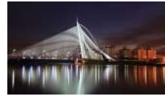
New Urban Development