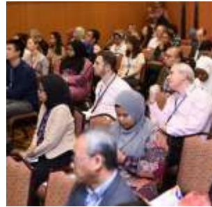
168 Side events