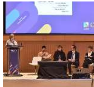
10 Plenary Meetings