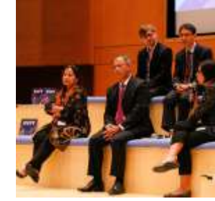
15 Stakeholders Roundtables