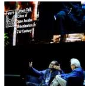
3 Urban Talks