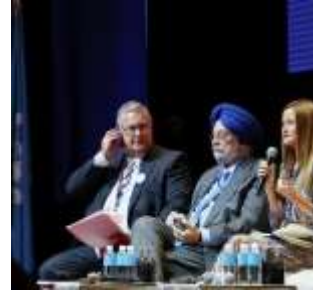
1 Ministers Roundtable