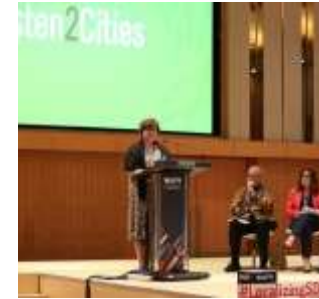
30 Listen to cities events