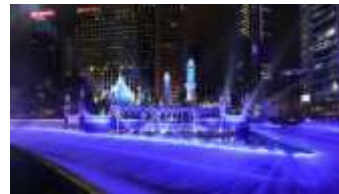
Urban Solution and Innovation