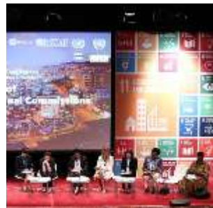
33 ONE UN events