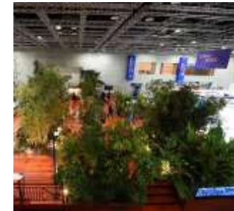
93 Exhibition Booths