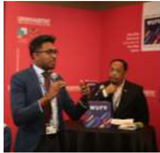
143 Networking events