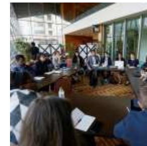
1 Urban Journalism Academy