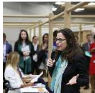
33 Launch of publications