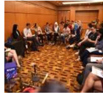
60 Training events