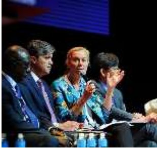
6 High-level Roundtables