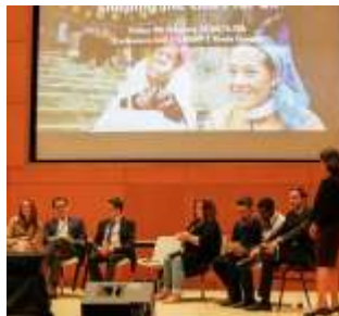
21 Special Sessions