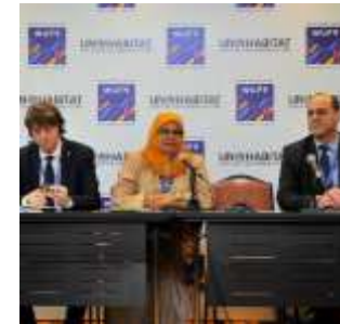
17 Press Conferences