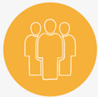
Social Cohesion and Equity