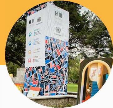
42 Habitat III Village Projects