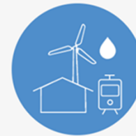
Urban Housing and Basic Services