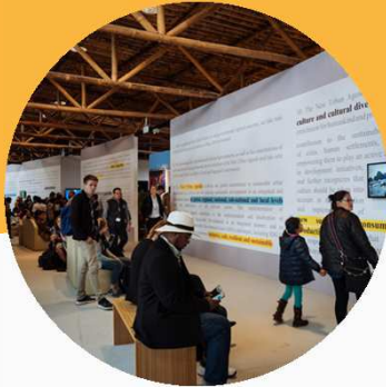
59 UN Events