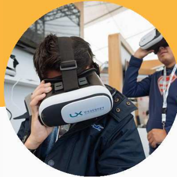
57 Exhibition Booths