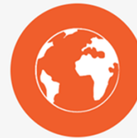
Urban Ecology and Environment